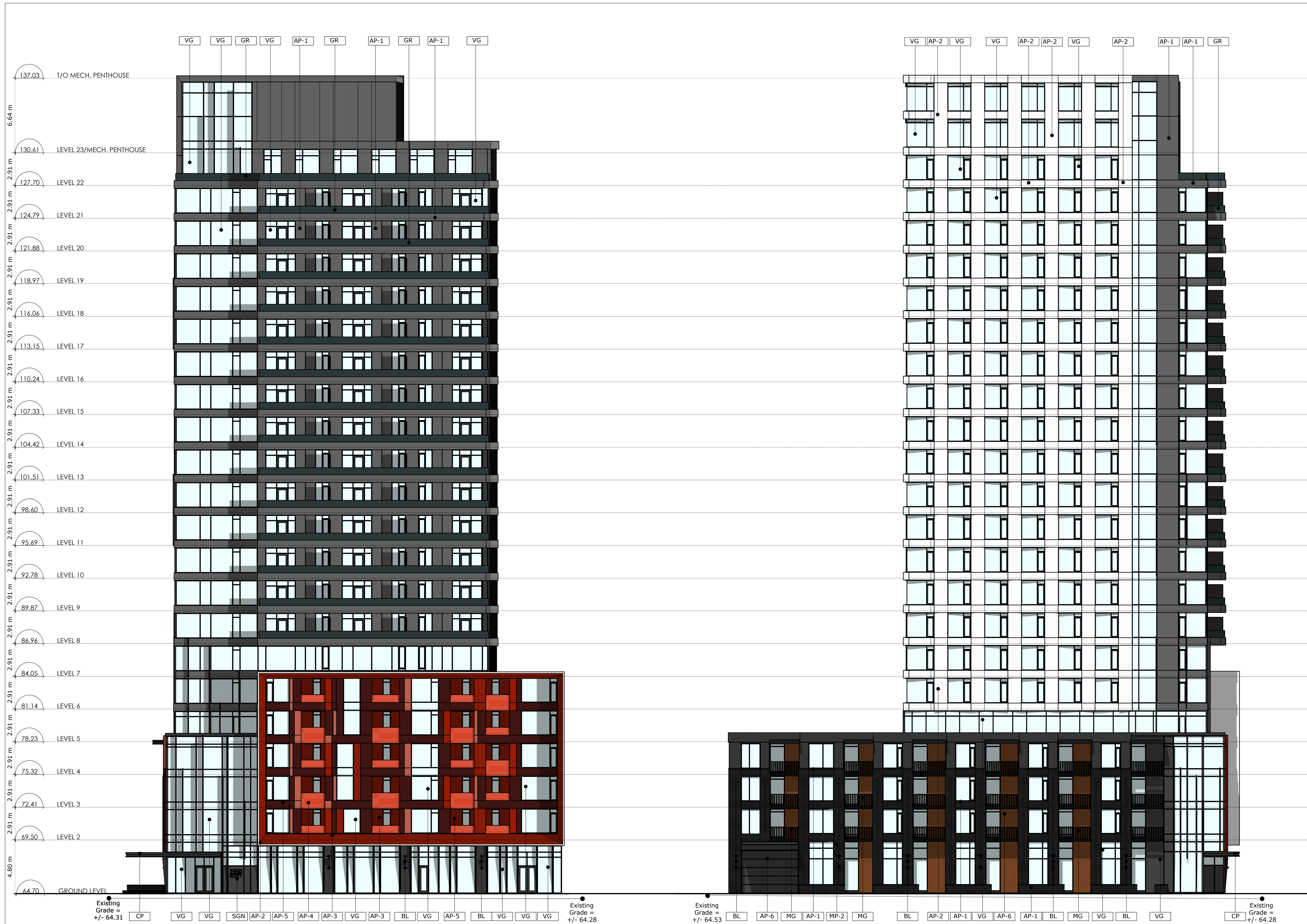
1 NORTH ELEVATION A3.00 Scale: 1: 150