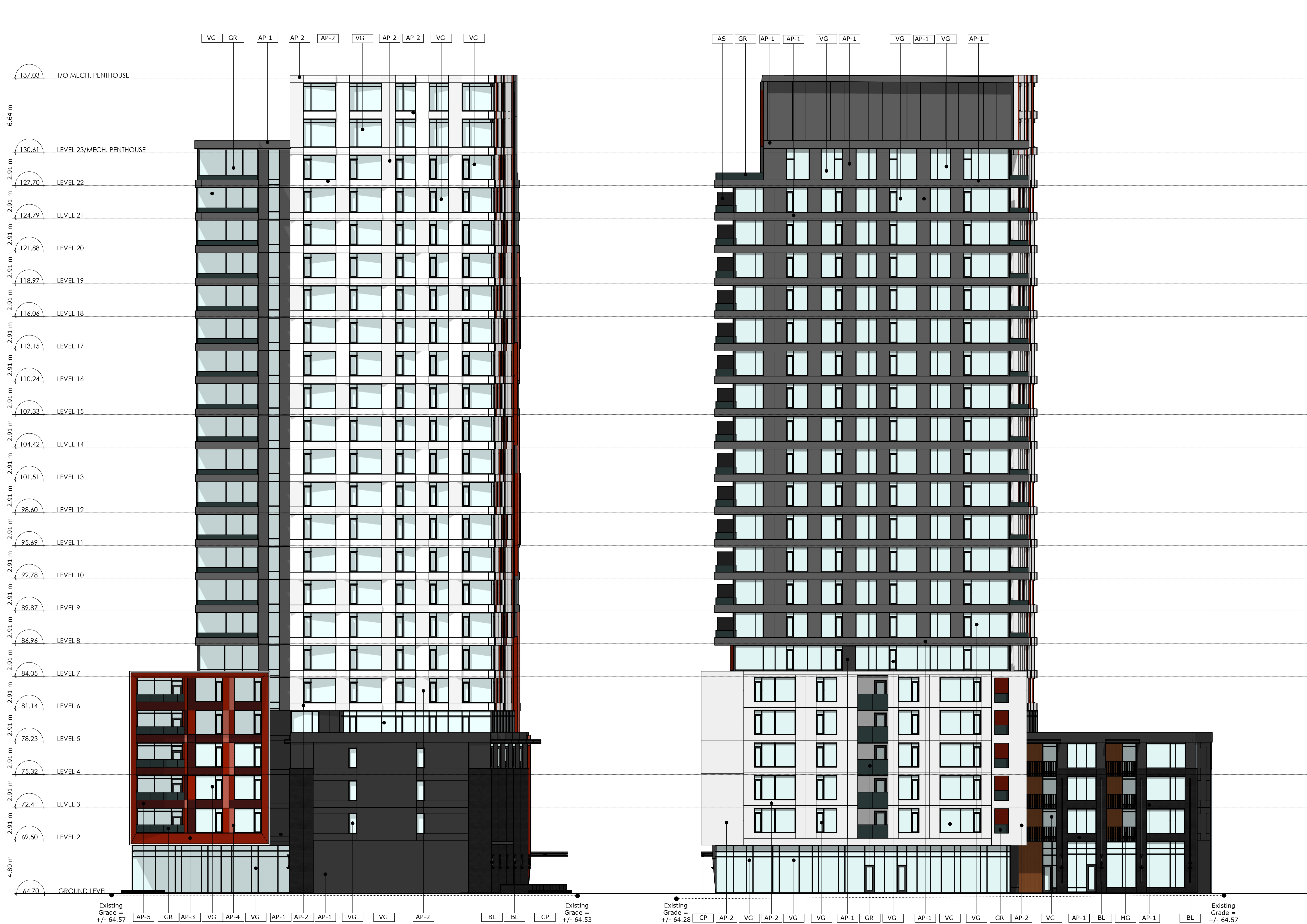
1 SOUTH ELEVATION A3.01 Scale: 1: 150