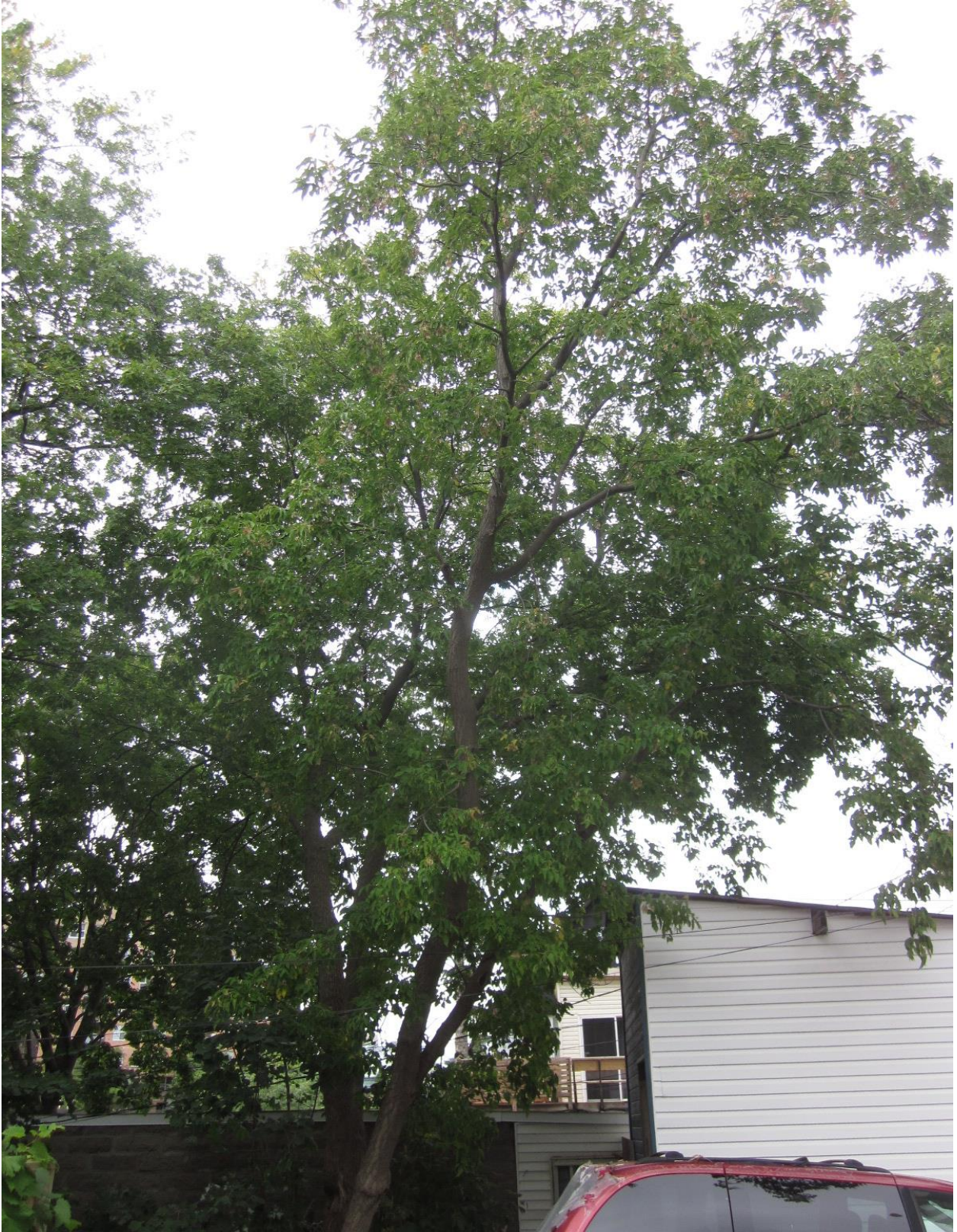
Picture 5. Tree #6, neighbouring Manitoba maple at 1088 Somerset Street