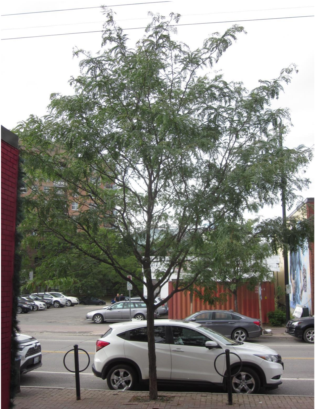
Picture 1. Tree #1, honey-locust on City property adjacent to 1088 Somerset Street