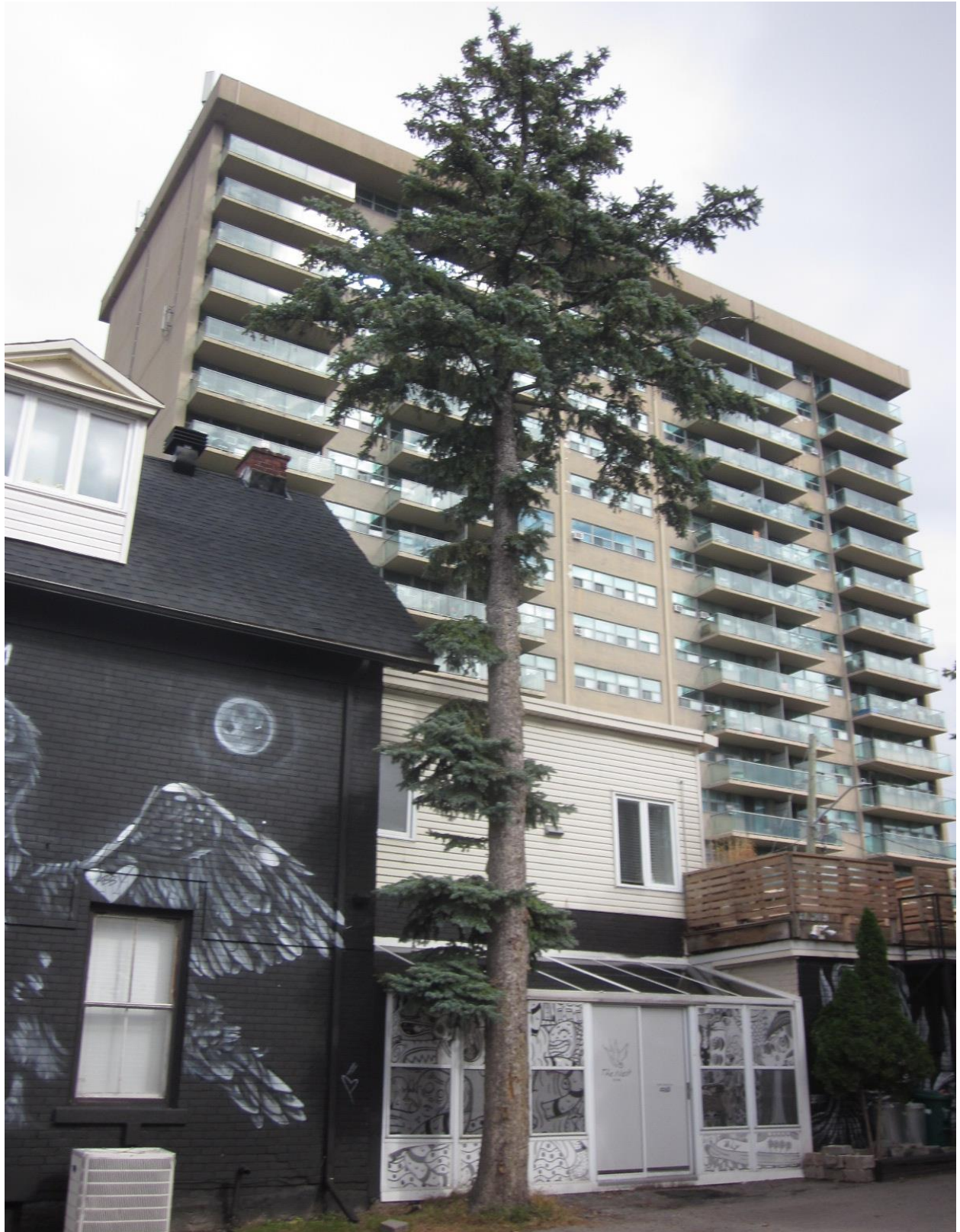
Picture 3. Tree #4, private Colorado blue spruce at 1088 Somerset Street