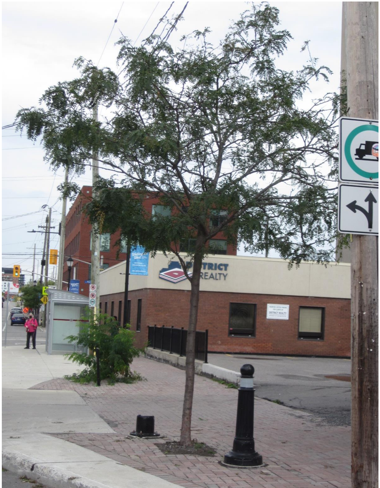
Picture 2. Trees #2 and 3 (background), honey-locusts on City property adjacent to 50 Baywater Avenue/1088 Somerset Street