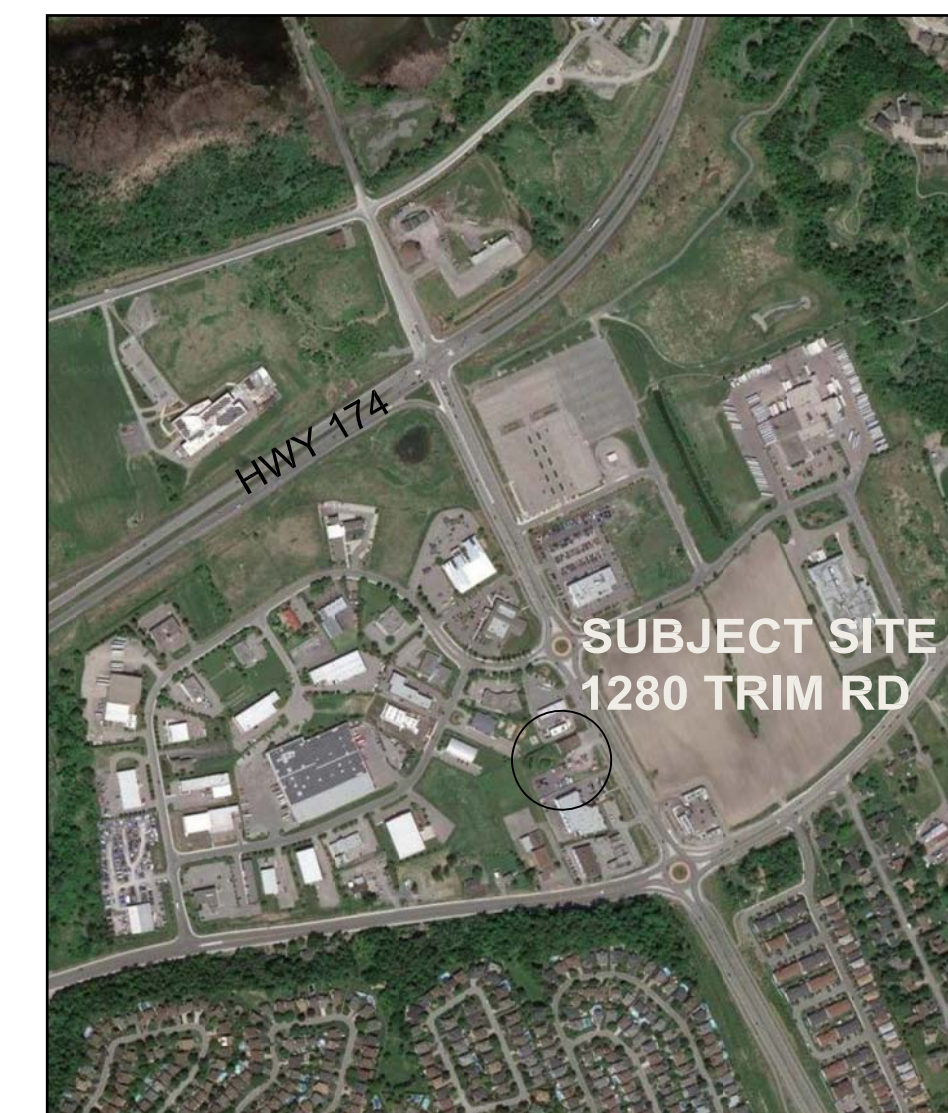
03 LOCATION PLAN SCALE: NTS

TRAFFIC ENGINEERING J.L.RICHARDS & ASSOCIATES LTD. 1000-343 Preston Street Ottawa, ON K1J 1N4