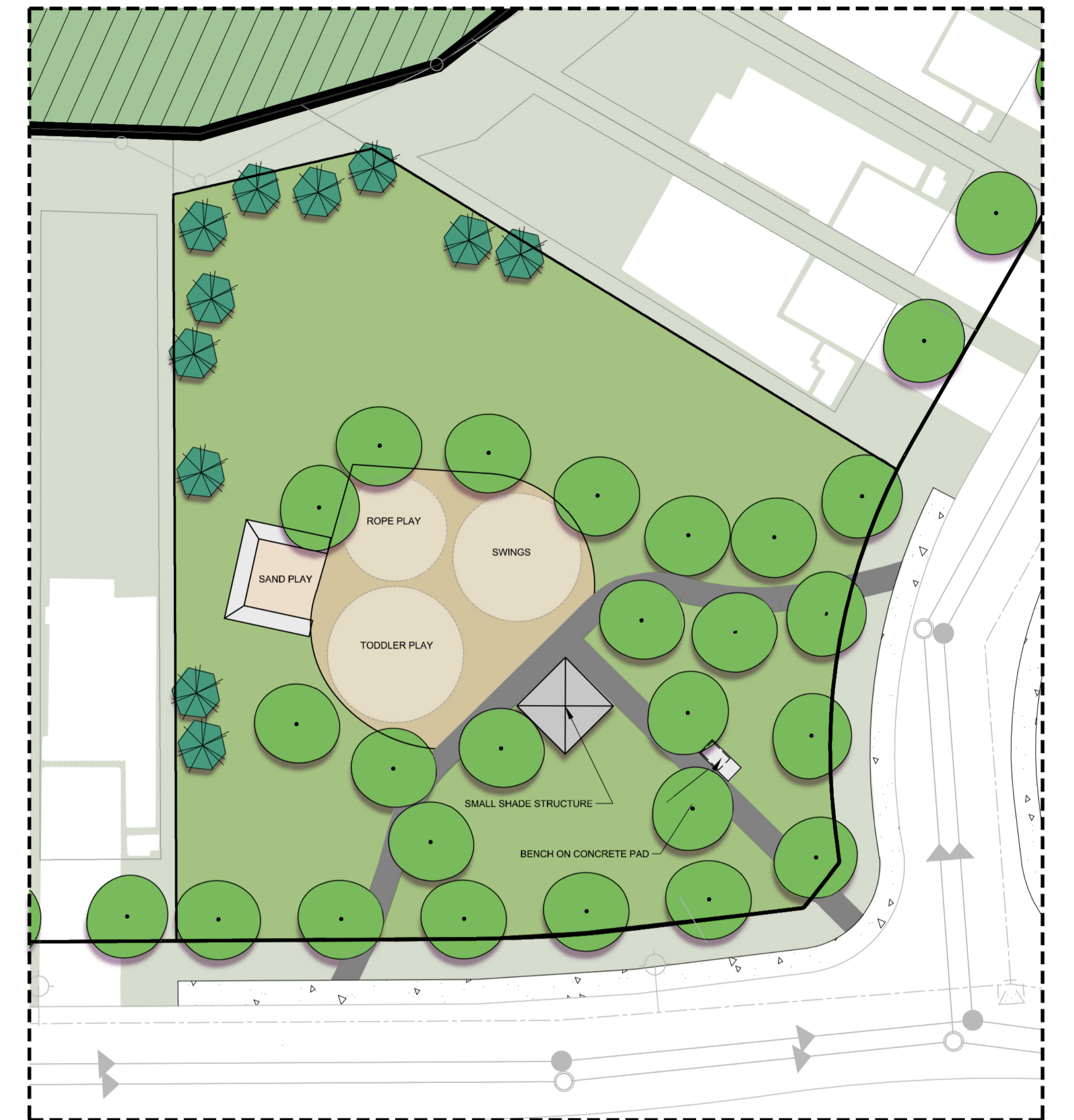
VIEW B- COMMUNITY PARKETTE