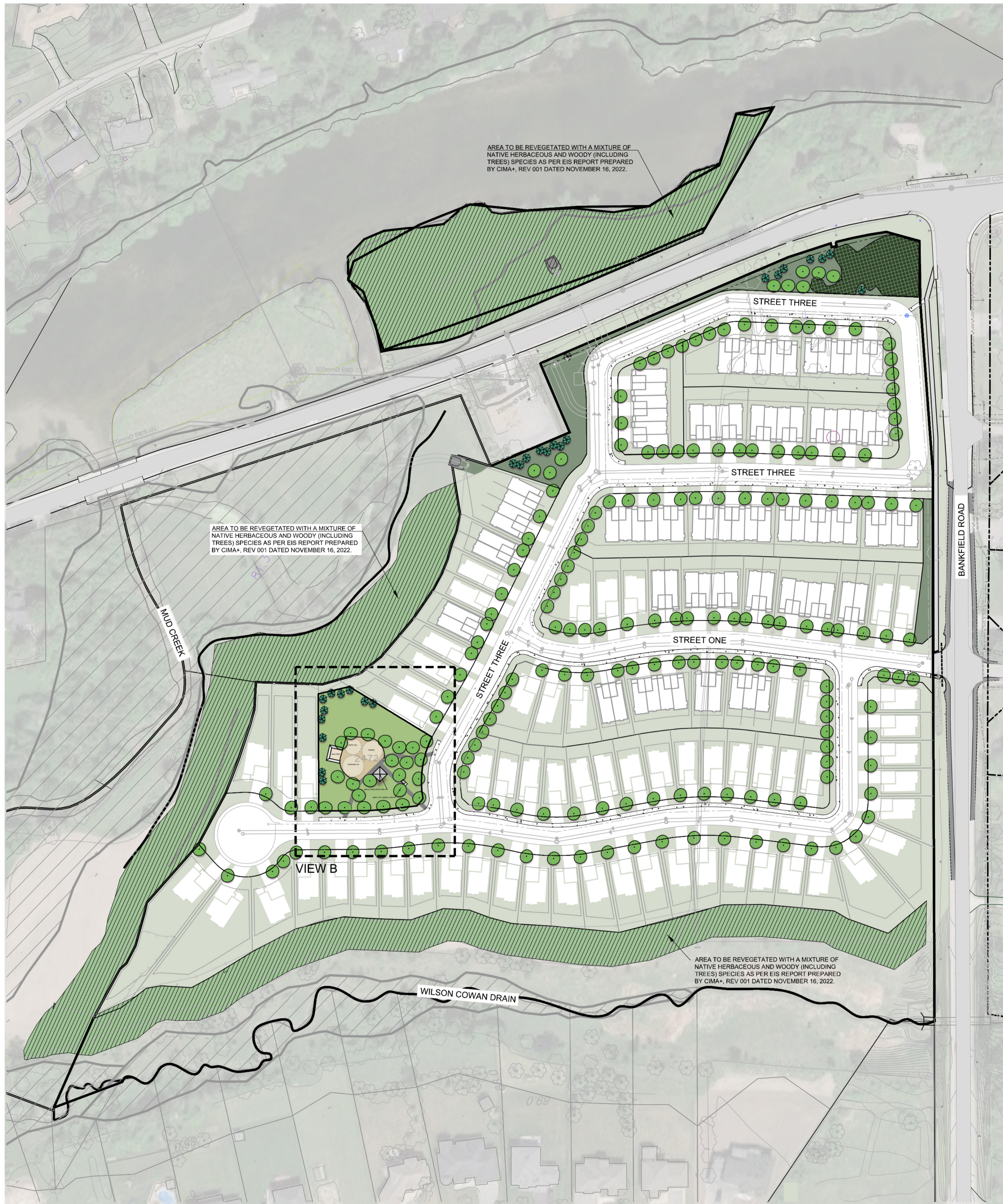
VIEW A- COMMUNITY GREENSPACE