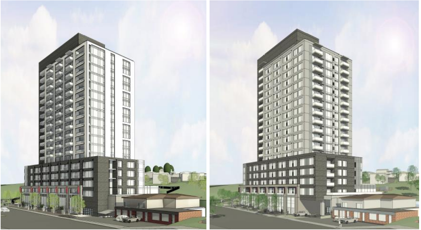
Figure 4: View Looking Southeast from across St. Joseph Boulevard, with the original design (left) and revised design (right)