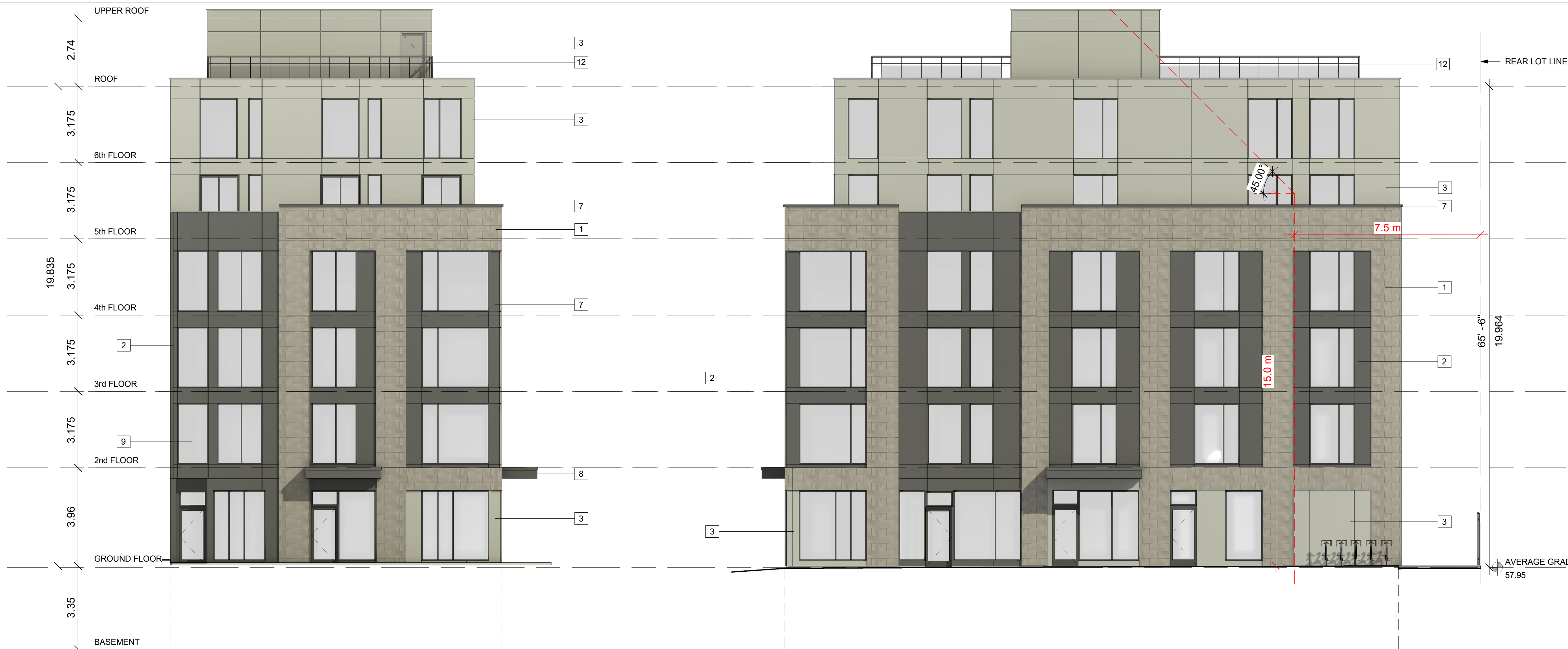
1 East (Front) Elevation 1:100