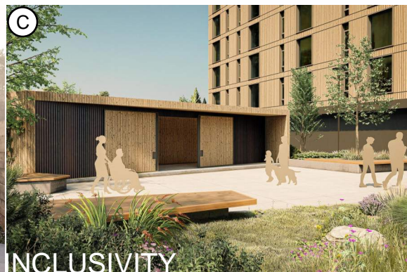
INCLUSIVITY Accessible for users of all ages and abilities. Unobstructed views from internal and external streets, walkways, and buildings, are maintained.