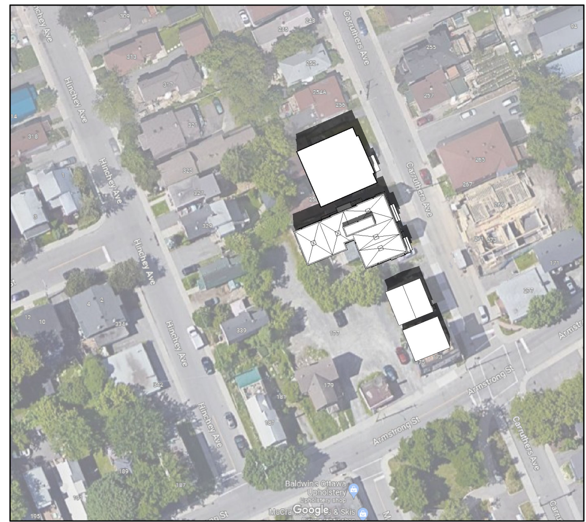
6 Summer Solstice 12pm SS-1 SCALE 1: 1000