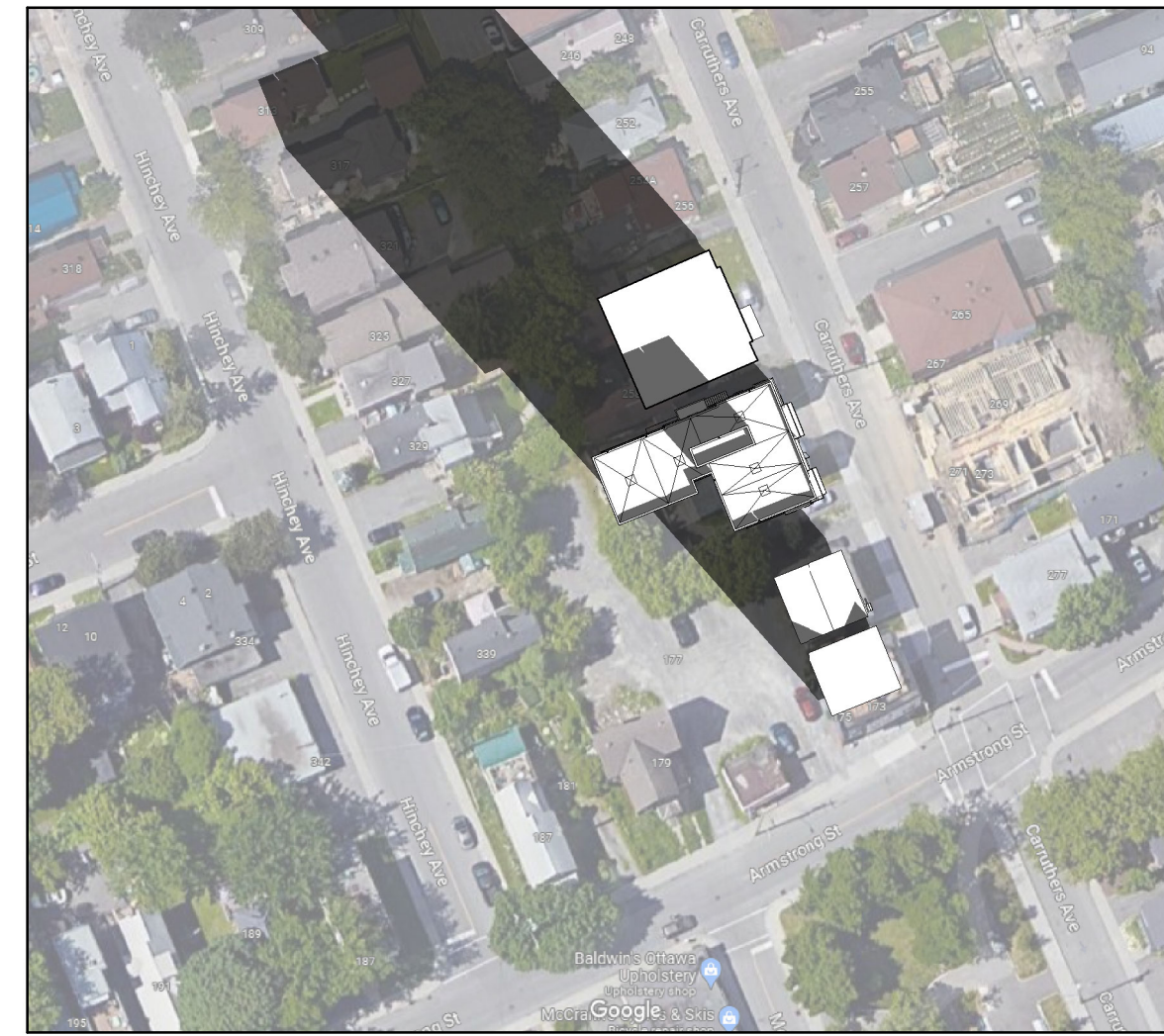
4 Winter Solstice 9am SS-1 SCALE 1: 1000