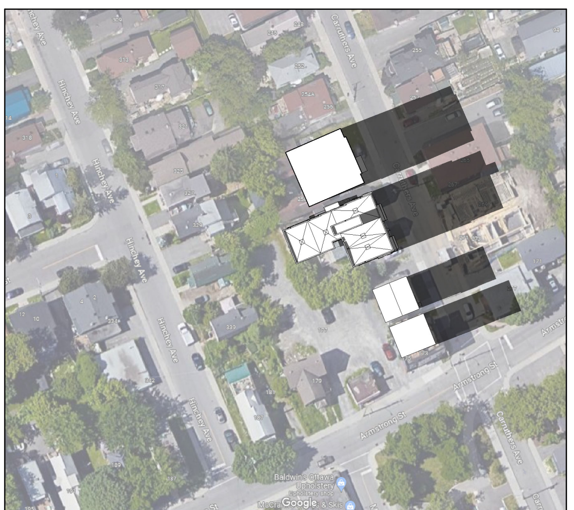
11 Fall Equinox 4pm SS-1 SCALE 1: 1000