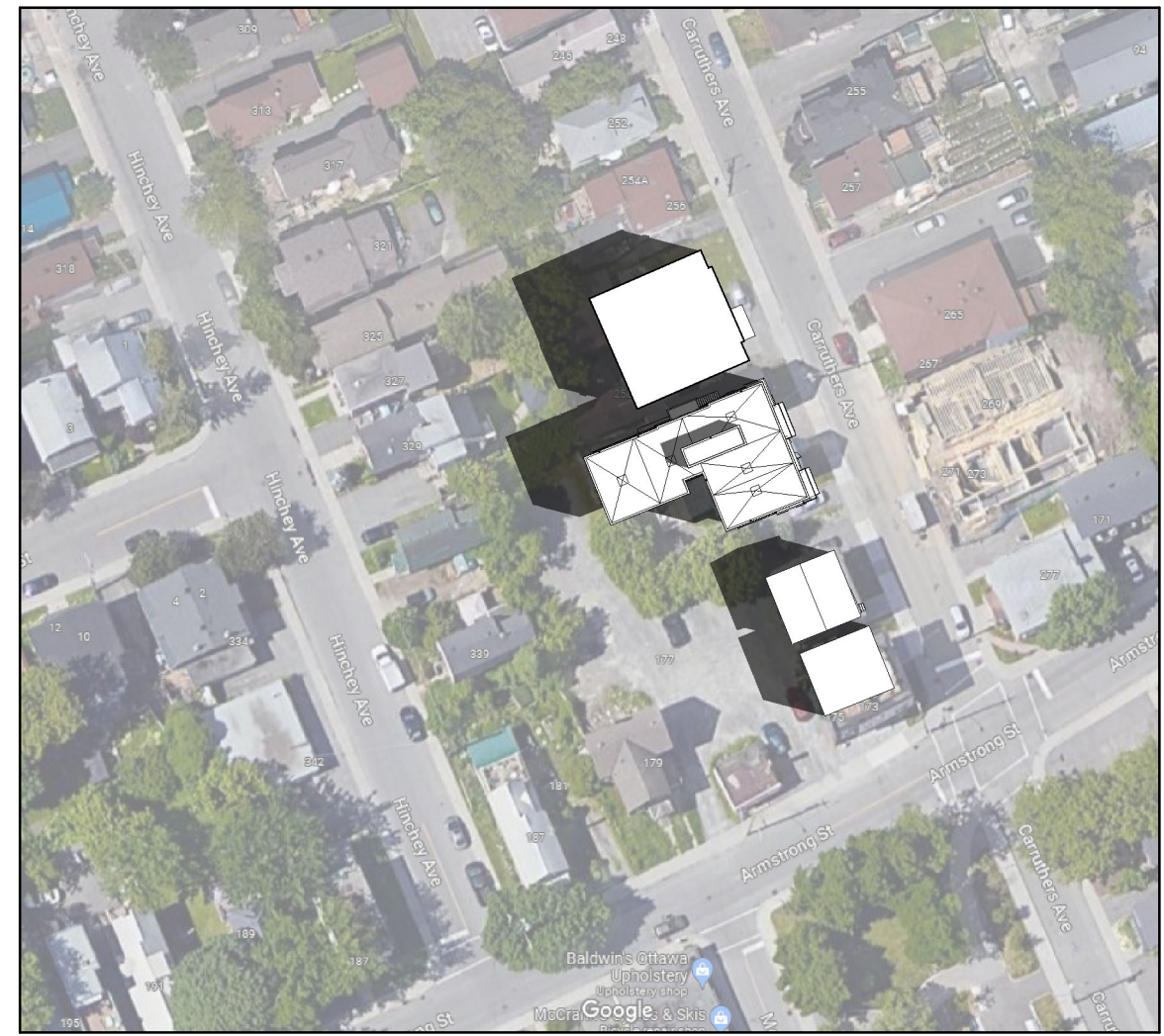
2 Summer Solstice 9am SS-1 SCALE 1: 1000