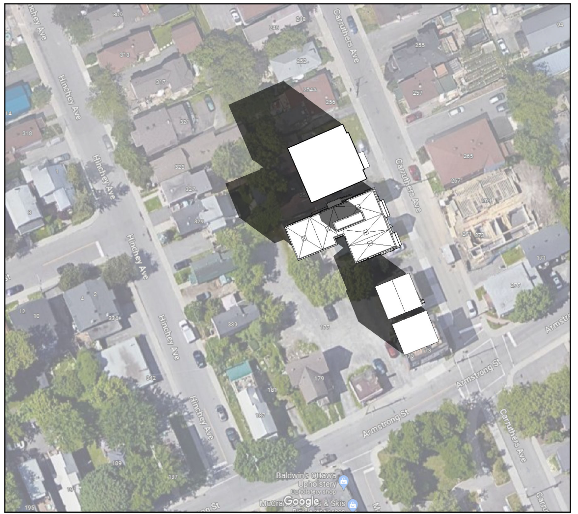
3 Fall Equinox 9am SS-1 SCALE 1: 1000