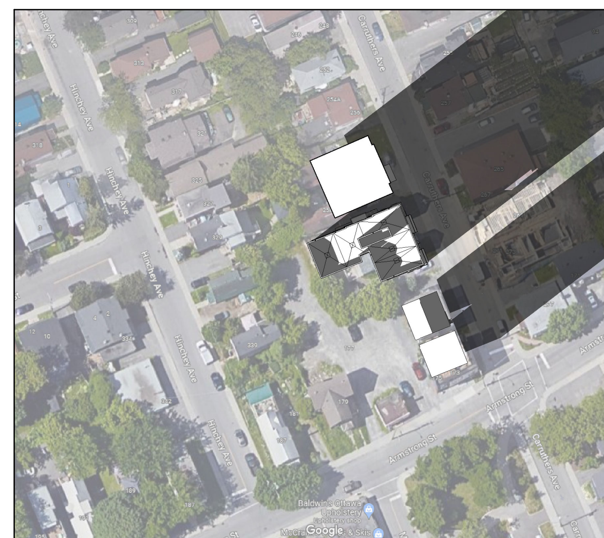
12 Winter Solstice 4pm SS-1 SCALE 1: 1000