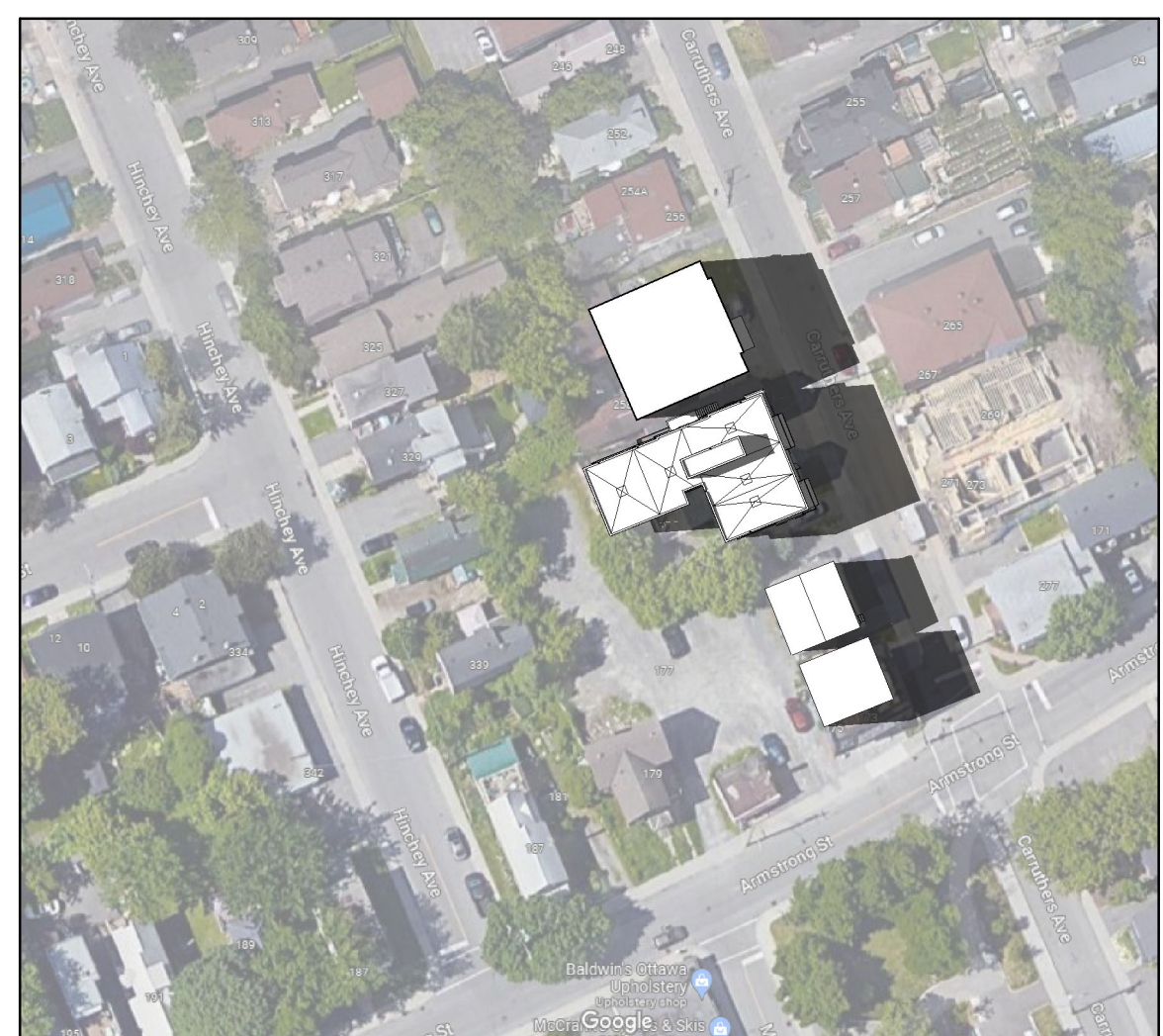
10 Summer Solstice 4pm SS-1 SCALE 1: 1000