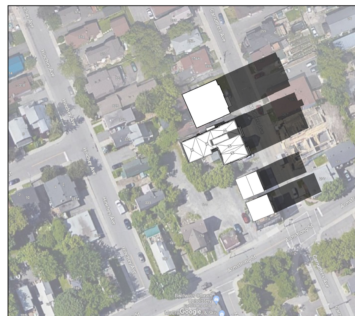
9 Spring Equinox 4pm SS-1 SCALE 1: 1000