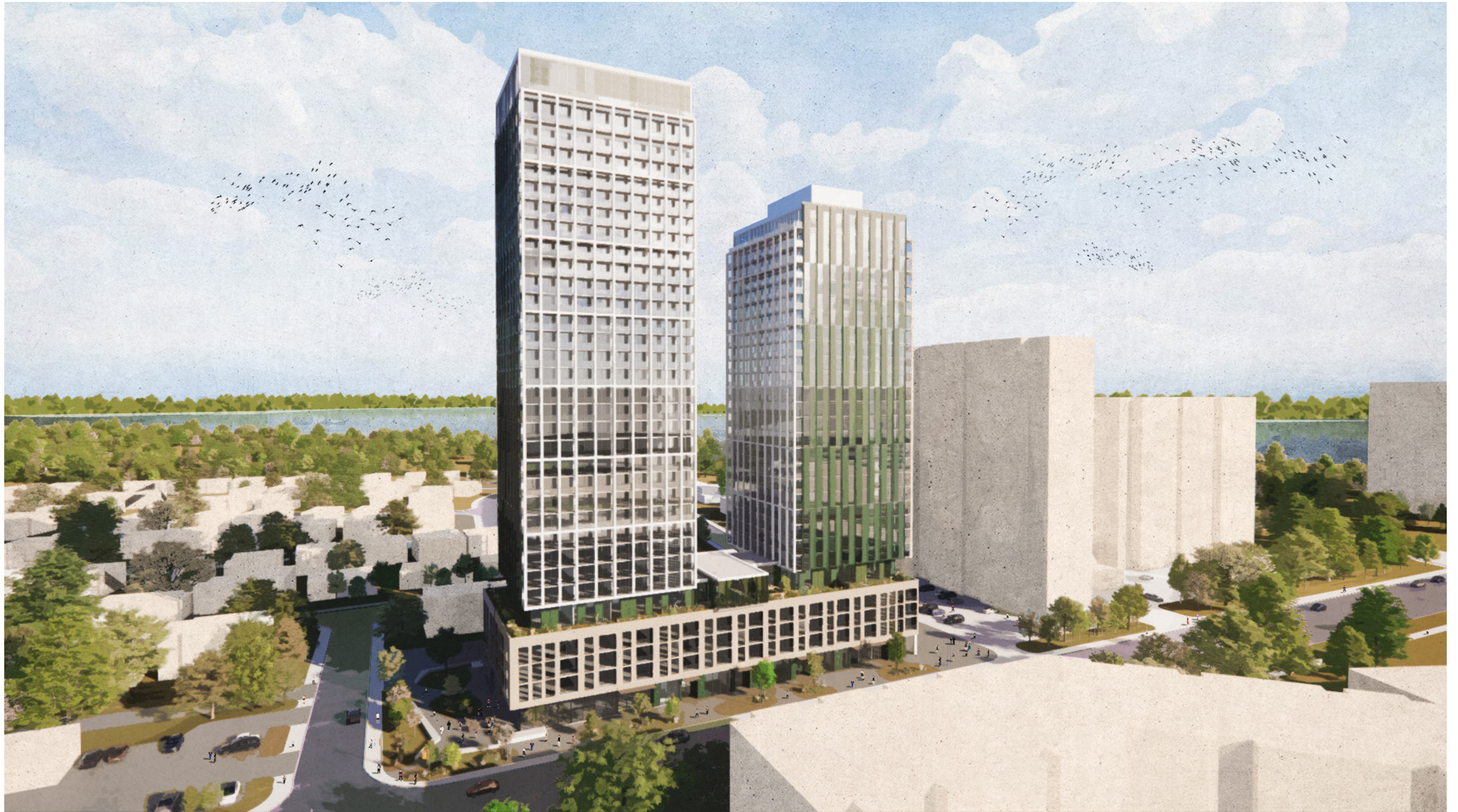
View of the site looking north