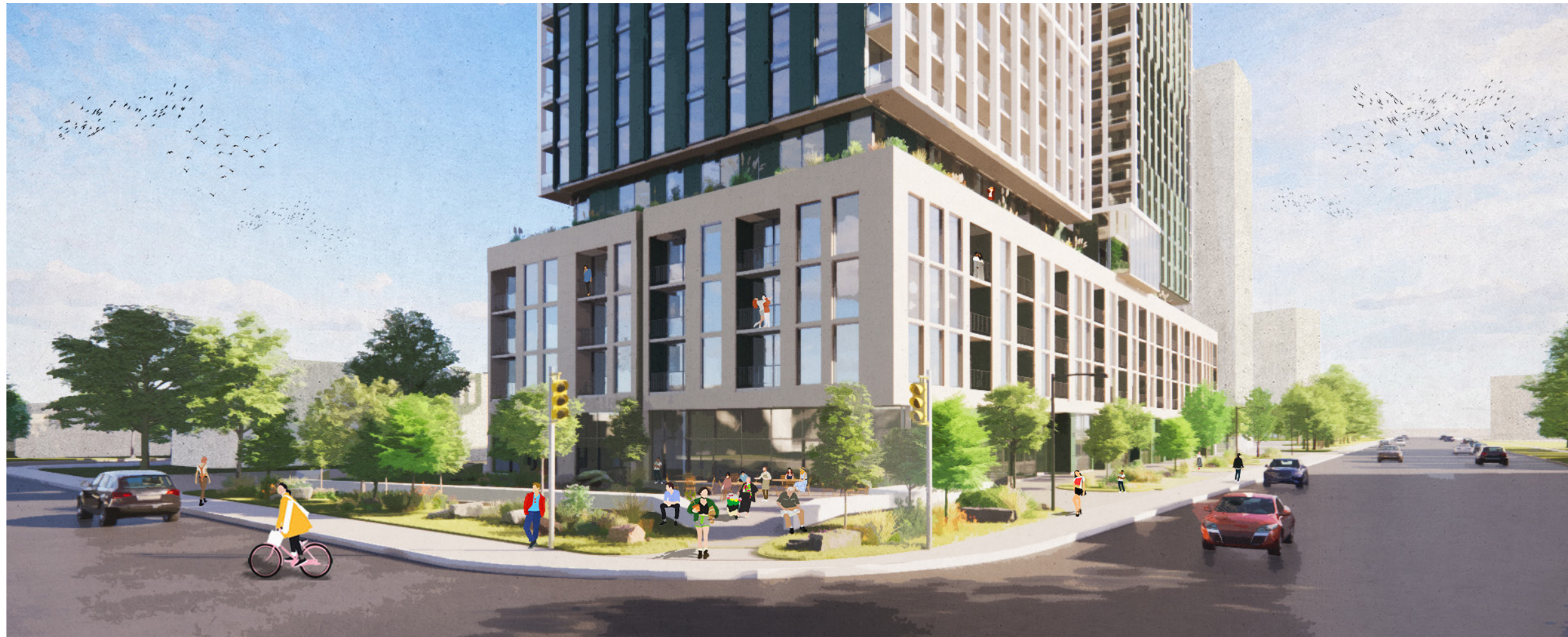
View looking northeast from the intersection of Richmond Road and Assaly Road

As per Park Design Criteria, features of the urban plaza may include but are not limited to: decorative paving; shade structure(s); water feature or water play; seating; games tables; play components; fitness structures; performance areas.