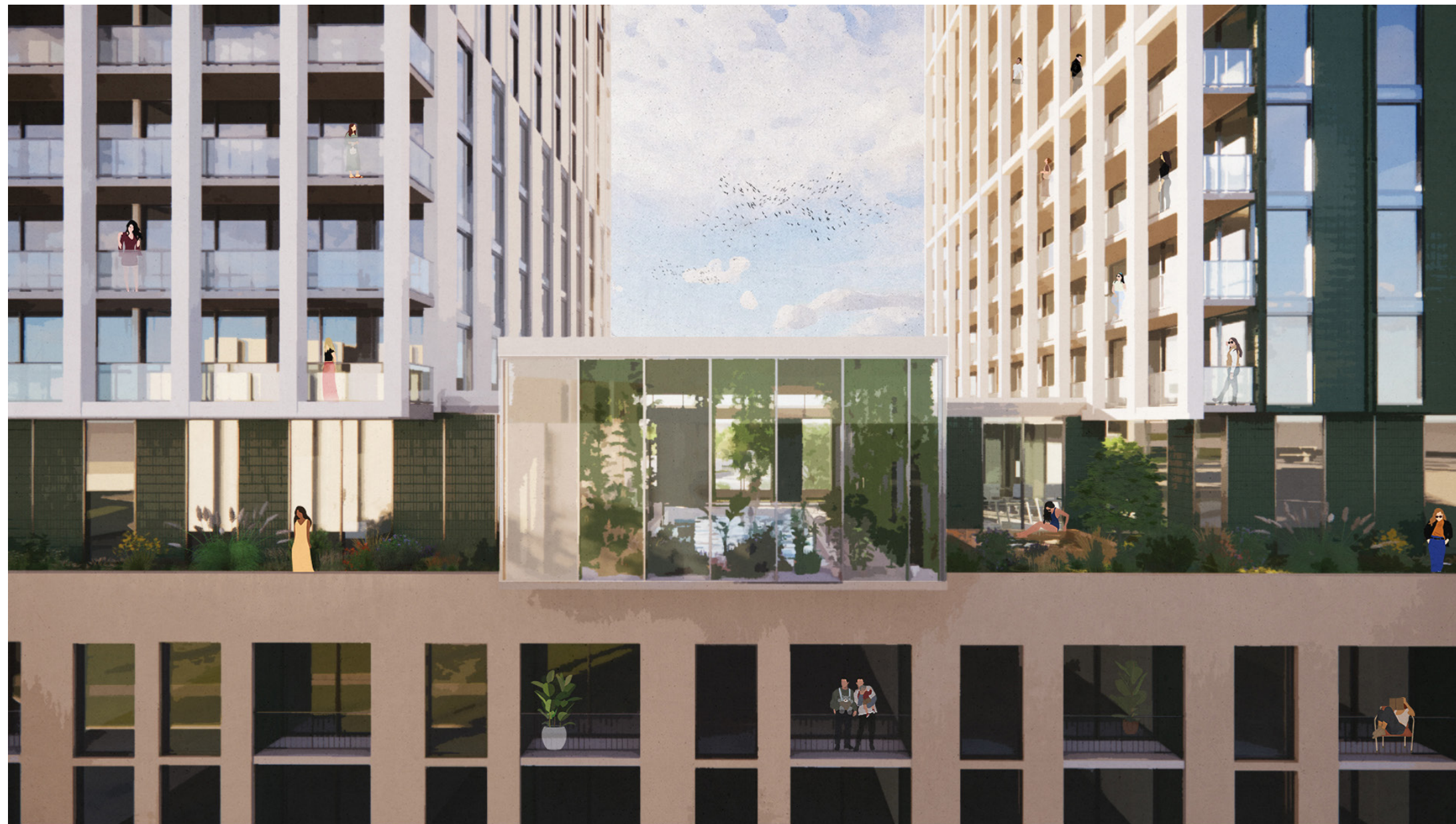
View looking north at the 5th Floor amenity level

The expression of the buildings is characterized by two towers of similar design - with one tower turned 90 degrees from the other to provide both visual interest and to mitigate and improve potential privacy and overlook issues to and from individual residential balconies. The tower balconies are defined by a grid of frames with the balconies on Tower 1 located on the north and south façades while the balconies on Tower 2 are rotated, facing east and west. Inset balconies are provided throughout the podium. The streetwall along Richmond Road will have variations in building material, colour and texture to create visual interest and distinction. Areas of interest will be highlighted by a colourful and similar cladding motif to tie the unique programming elements together. These features include: the retail space fronting the park and main entrance, the swimming pool amenity at the 5th Floor and the Skylounge at the top of Tower 1. The architectural expression at grade enhances the public realm by highlighting the special moments within the building. Materials planned include a variety of masonry textures and colours, along with a lattice-style tower balcony treatment.