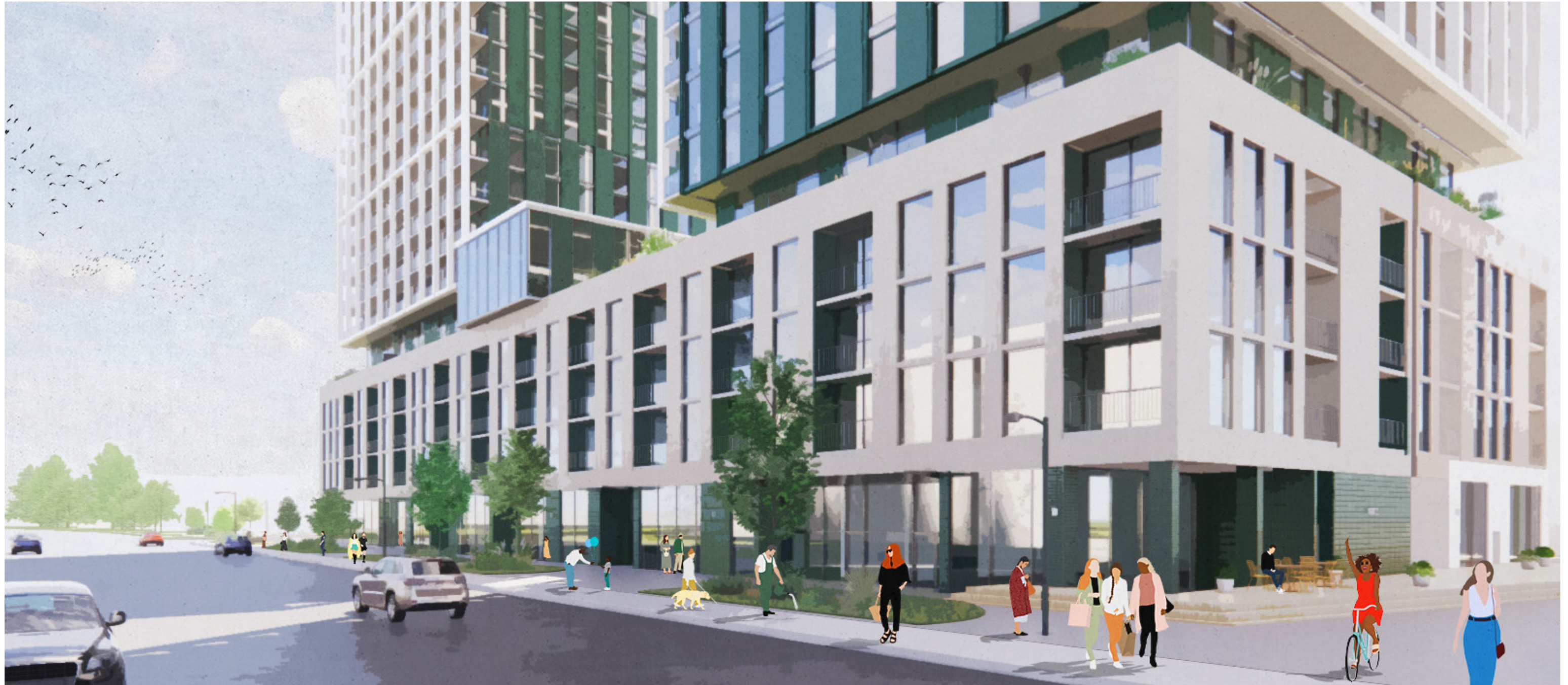
View looking west along Richmond Road

The towers are positioned to be along the South of the site to minimize the shadow impact to the properties to the north and to allow for increased access to light. The proposed slender tower floor plate of 750 sm generates shadows that are fast-moving throughout the day. In June, the shadows no longer impact the subdivision to the north after 11:00 am, and by 1:00 pm the houses along Starflower Lane are also no longer impacted. In September the shadows no longer impact the subdivision to the north after 1:00 pm.