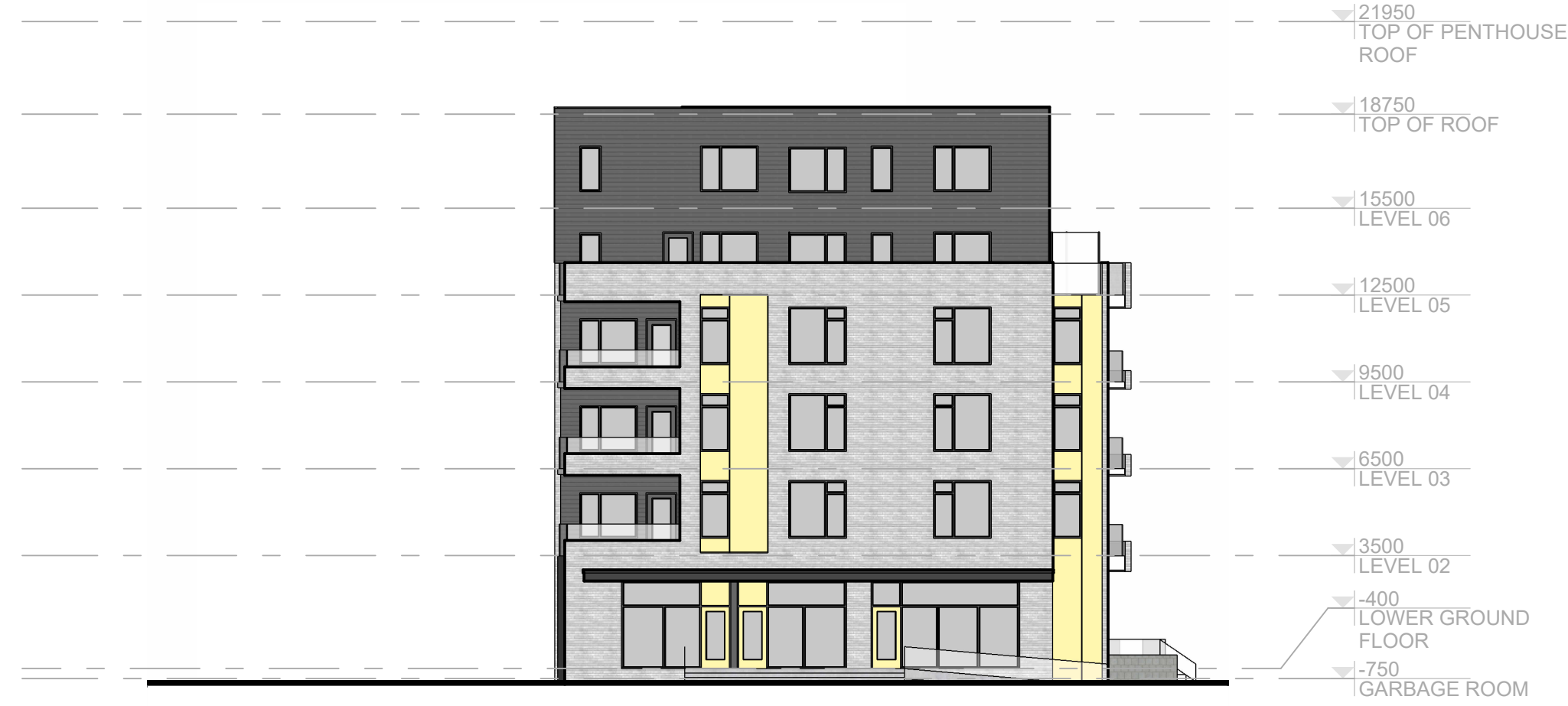
3 SOUTH ELEVATION A.300 | 1:200