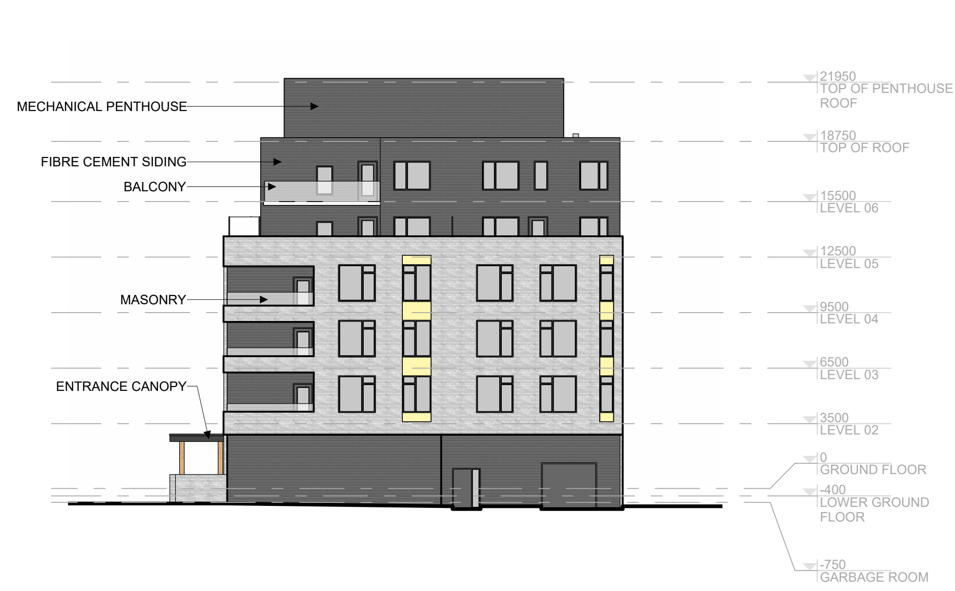
1 North Elevation A.300 | 1:200