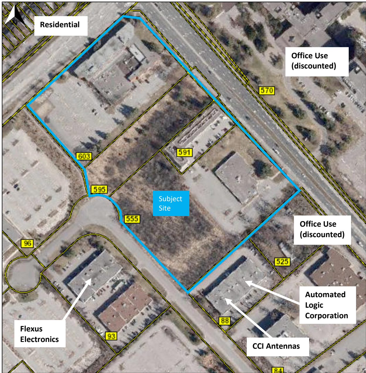
Figure 4: Location of Class I uses relative to the Subject Site