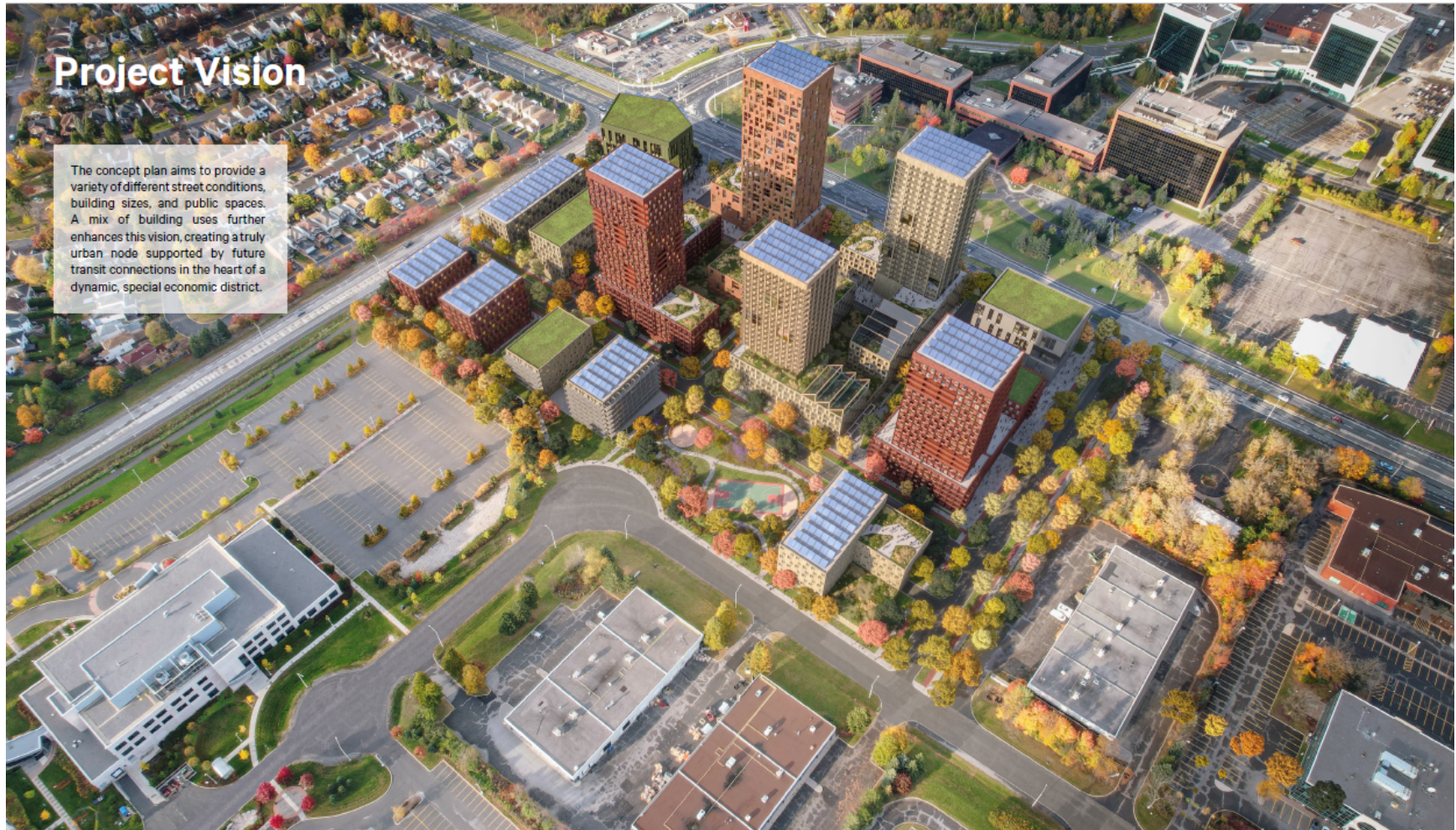
Figure 1: 3D Render looking northeast