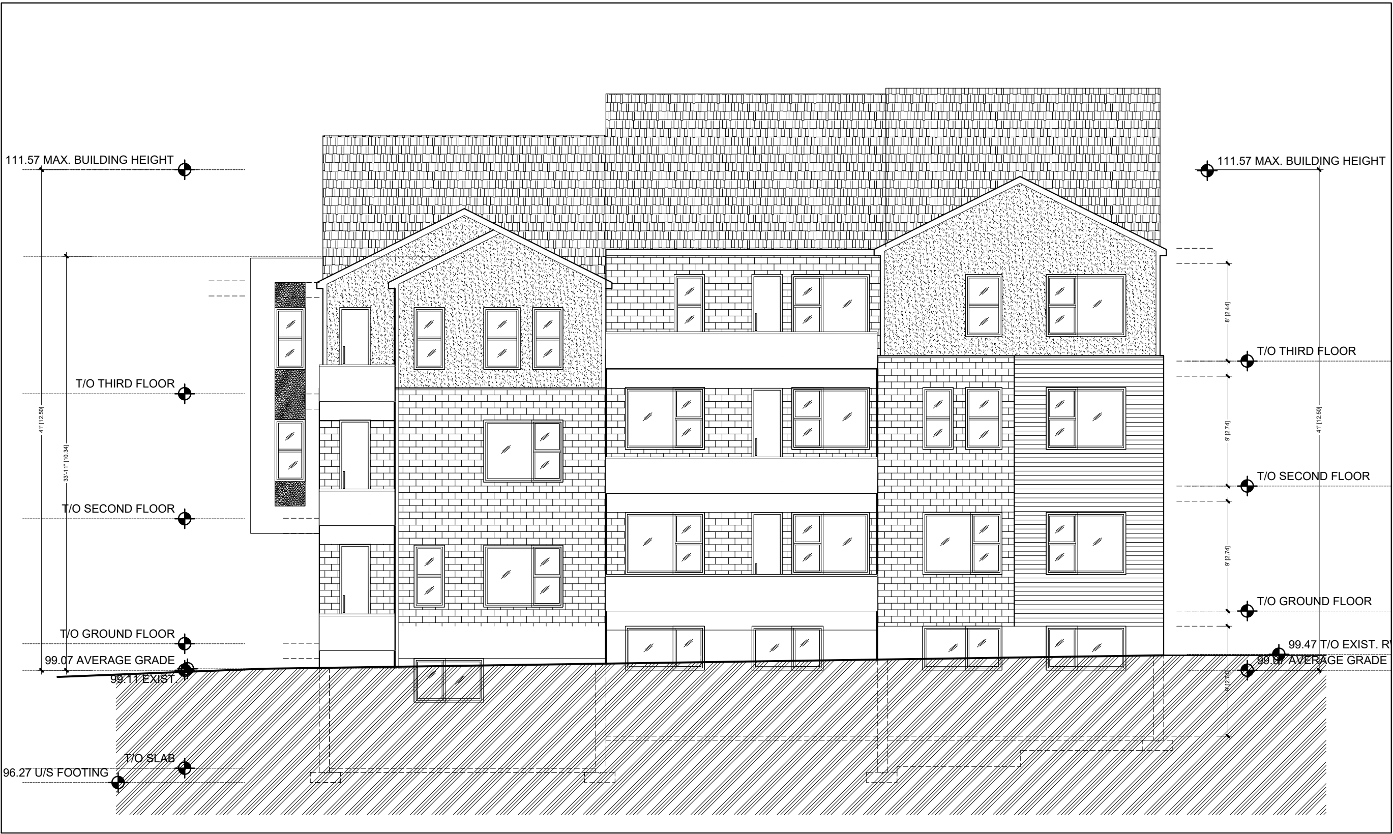
7 REAR (WEST) ELEVATION Scale: 3/32"=1'-0"