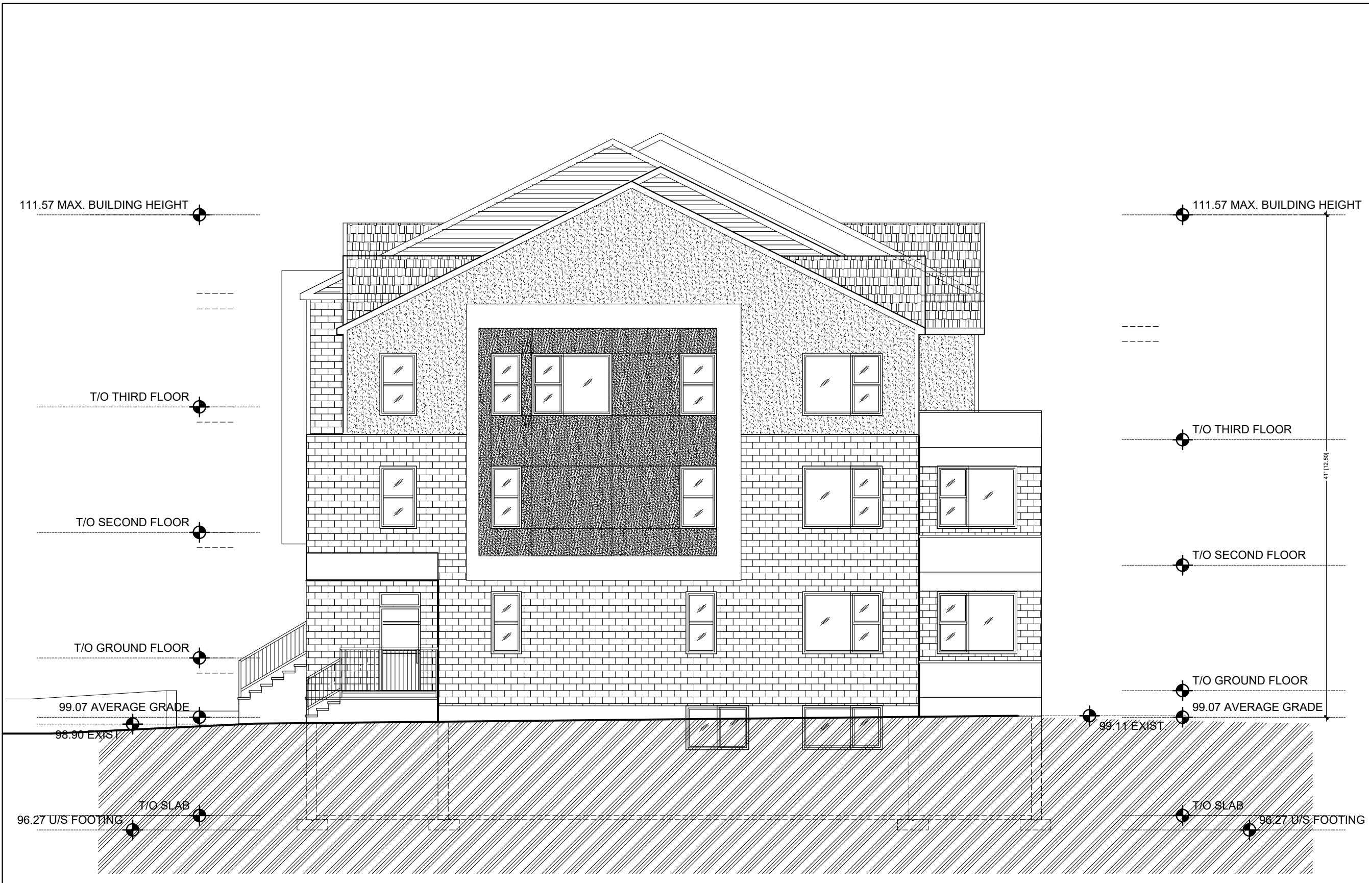
6 NORTH ELEVATION Scale: 1/8"=1'-0"