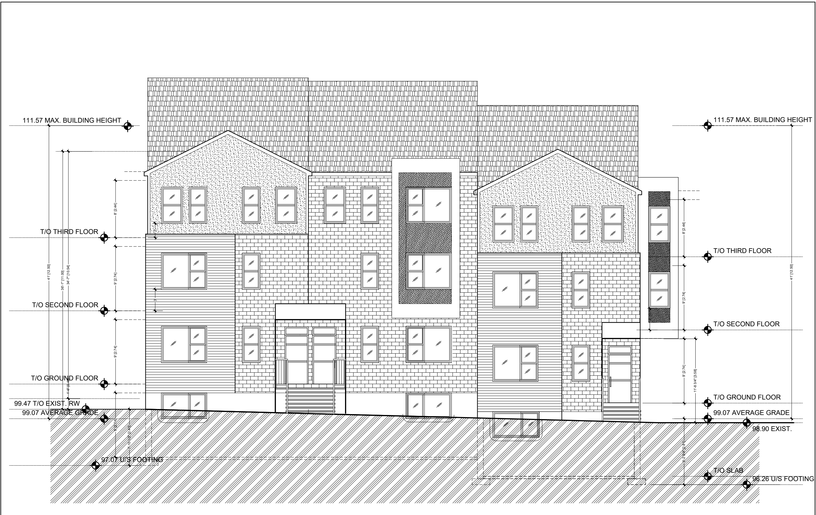
5 FRONT (EAST) ELEVATION Scale: 1/8"=1'-0"