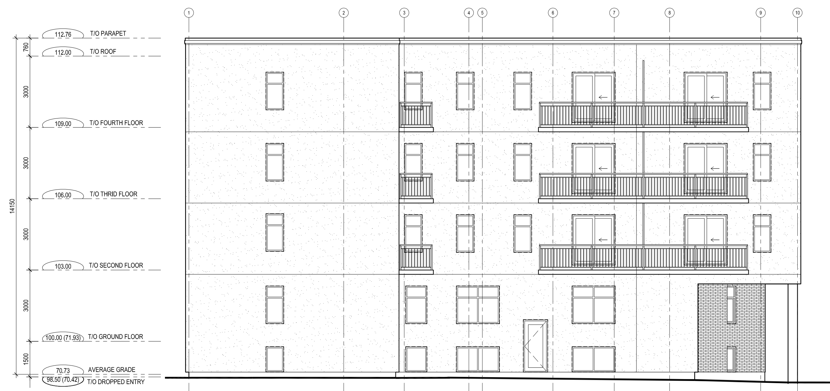
3 A-201 REAR (SOUTH) ELEVATION SCALE: 1:100