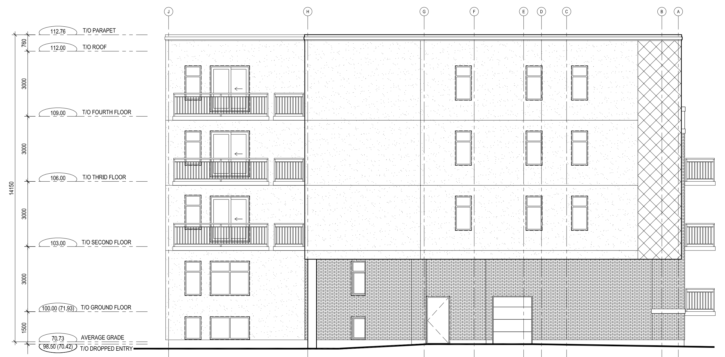
4 A-201 LEFT (EAST) ELEVATION SCALE: 1:100

It is the responsibility of the appropriate contractor to check & verify all dimensions on site and report all errors &/or omissions to the architect. All contractors must comply with all pertinent codes & by-laws, & use proprietary products as directed by the manufacturer. Do not scale drawings. Copyright reserved.