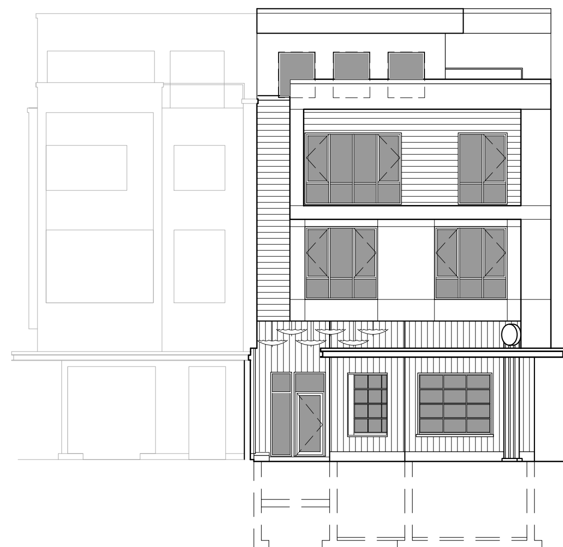
1 FRONT ELEVATION SCALE: 3/32"=1'-0"

598 5/8" T/O SECOND FLOOR 563 7/8" U/S SECOND FLOOR 454 3/4" T/O THIRD FLOOR 438" U/S THIRD FLOOR 328 7/8" T/O SECOND FLOOR 312 1/8" U/S SECOND FLOOR 203" T/O SECOND FLOOR 186 1/4" U/S SECOND FLOOR 98" T/O MEZZ FLOOR 87 3/4" U/S MEZZ FLOOR 0" (65.513) T/O GROUND FLOOR (65.325) AVERAGE GRADE