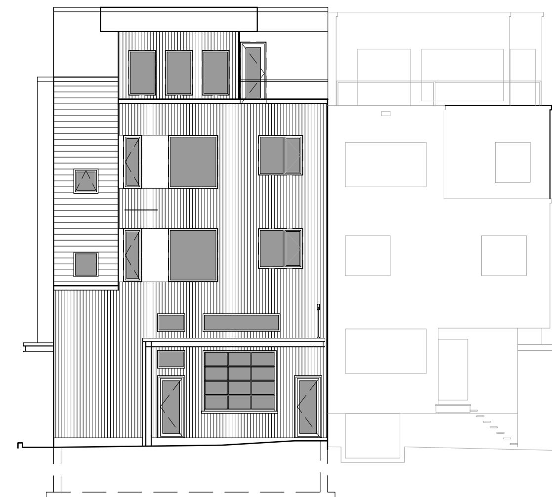
4 REAR ELEVATION SCALE: 3/32"=1'-0"