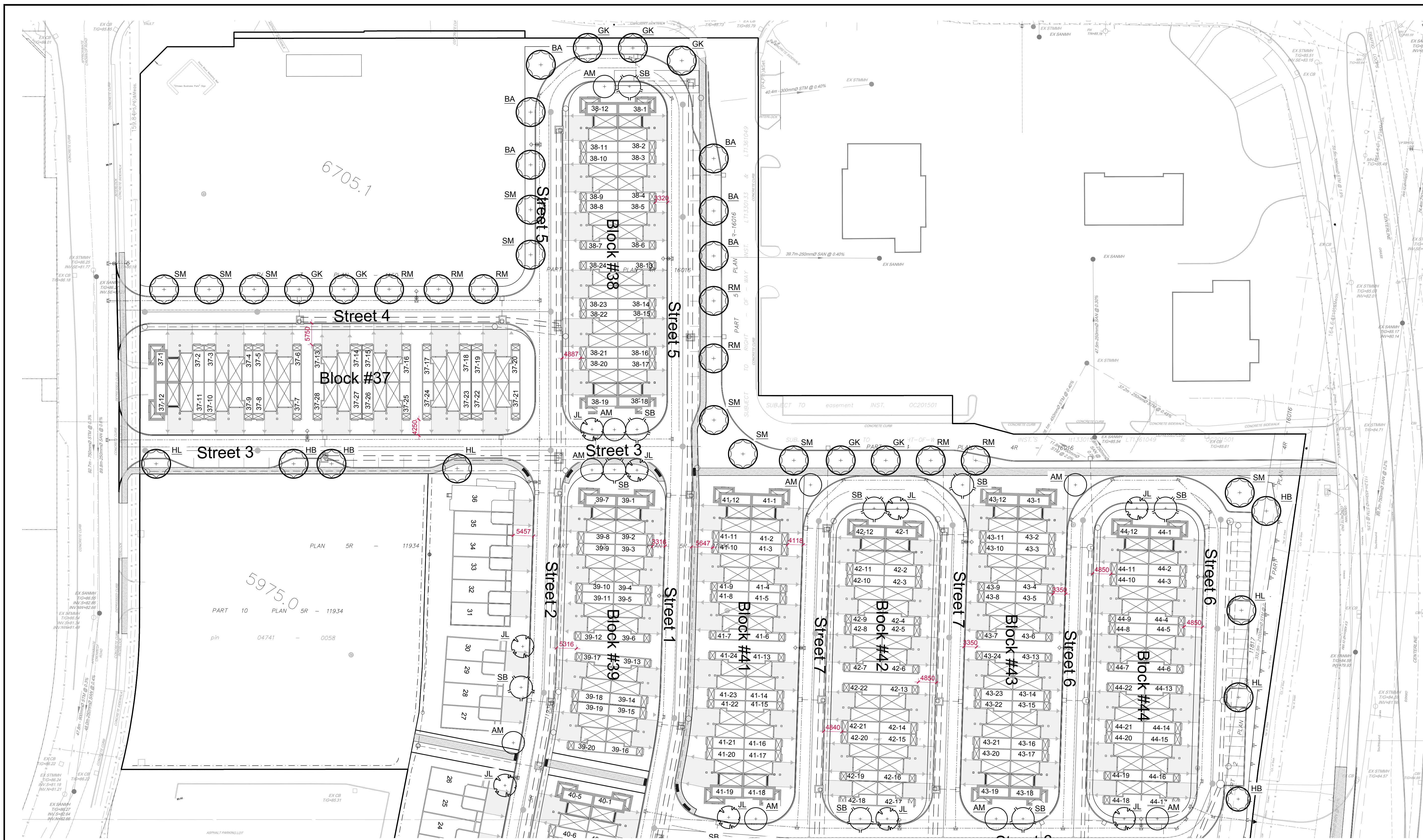
1 LANDSCAPE PLAN L.1 SCALE 1:500