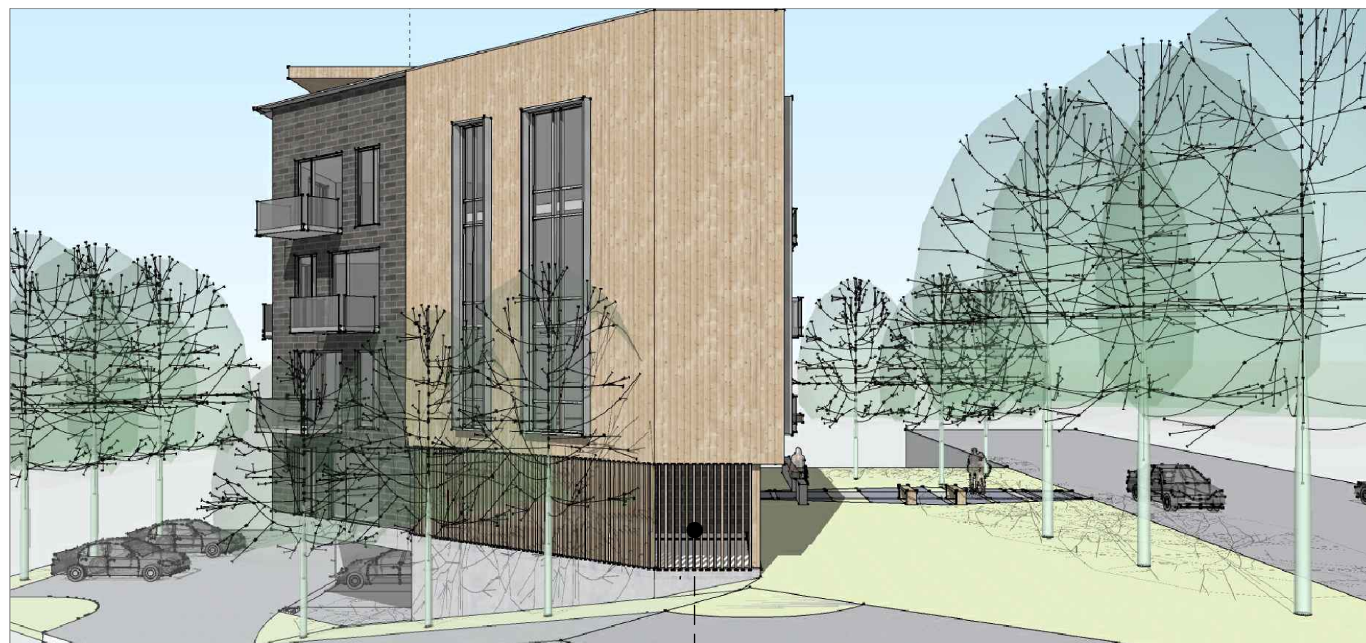
WOOD LATTICE - surrounding amenity space