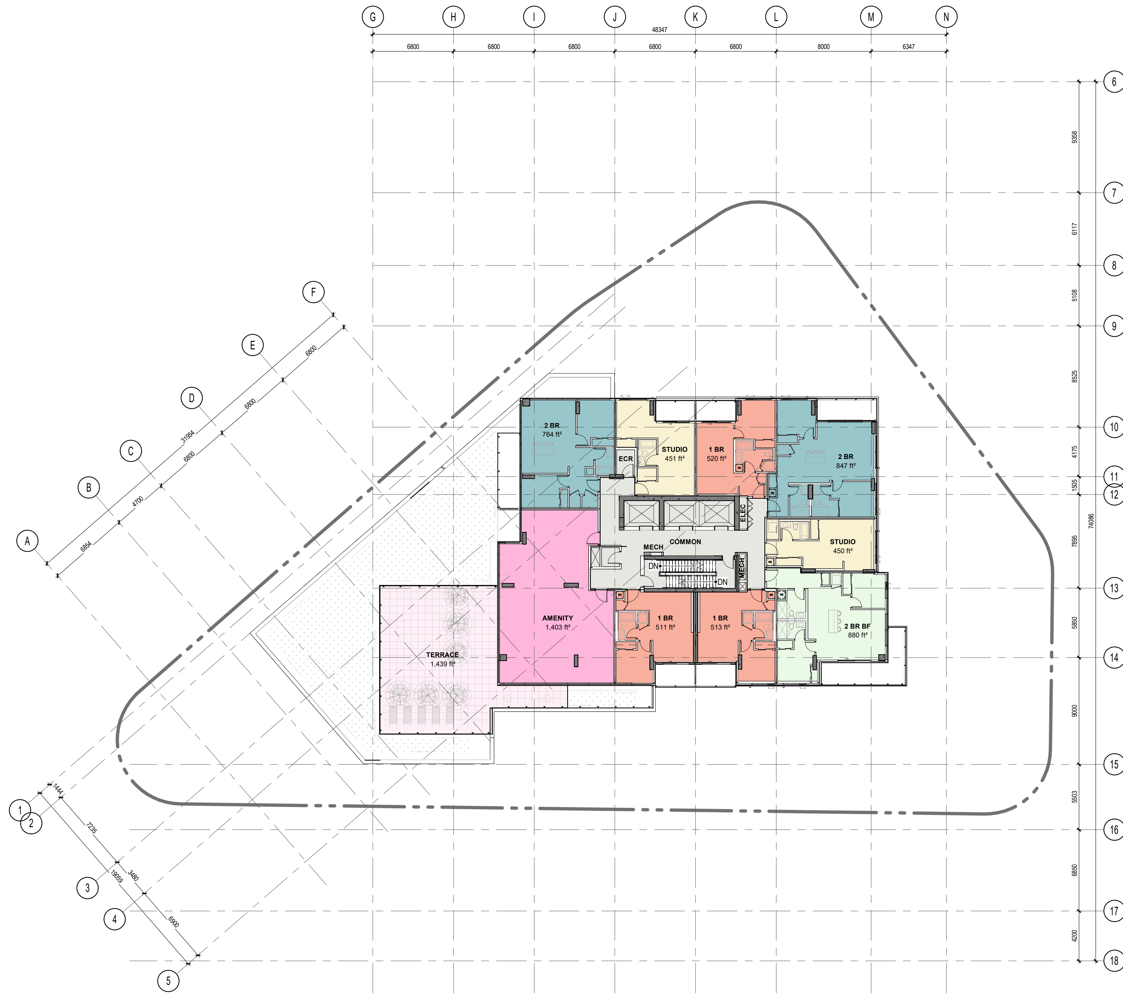
OVERALL PLAN - LEVEL 9 AMENITY 1:200