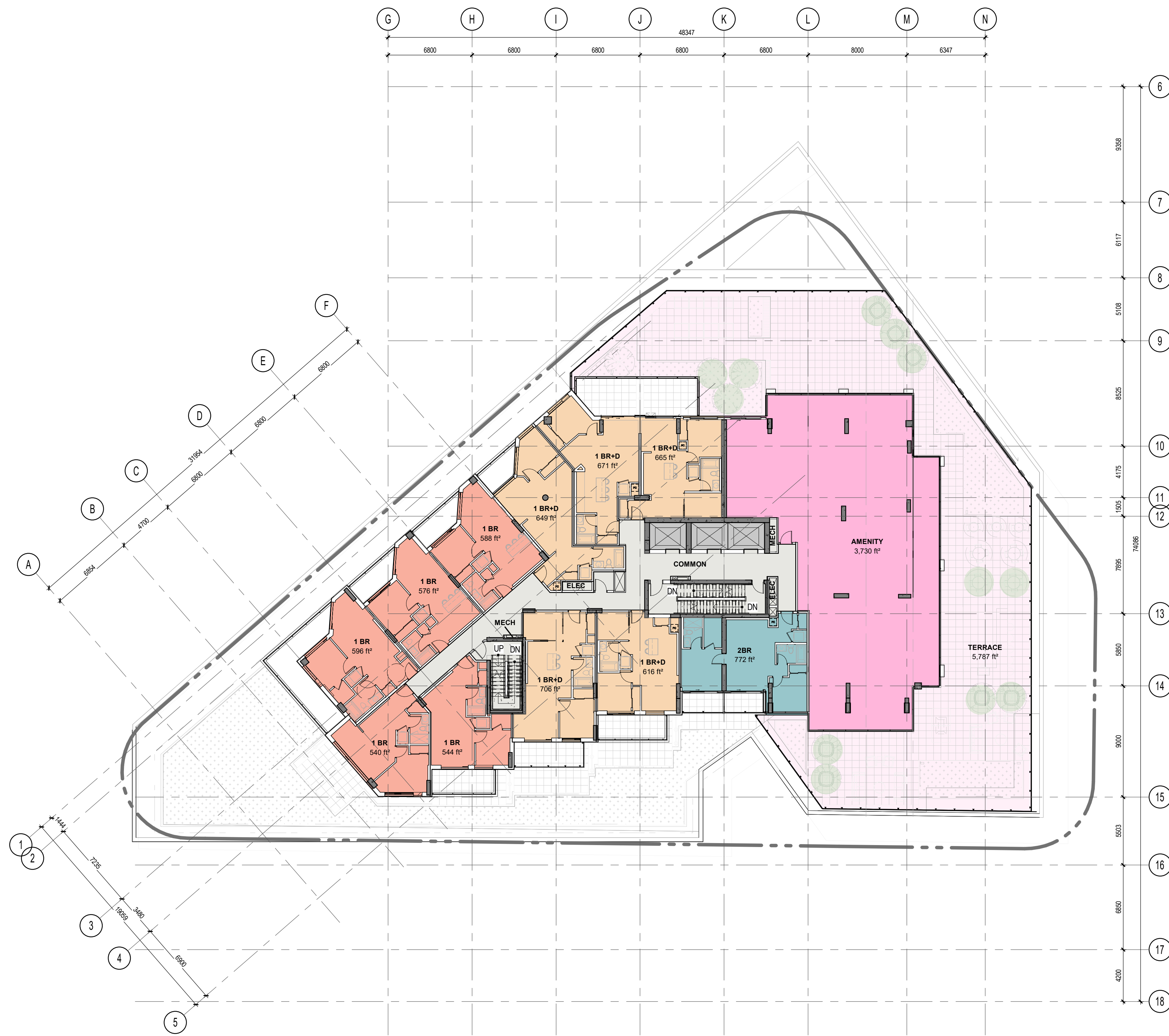
OVERALL PLAN - LEVEL 2 AMENITY 1 : 200 SPA-A202