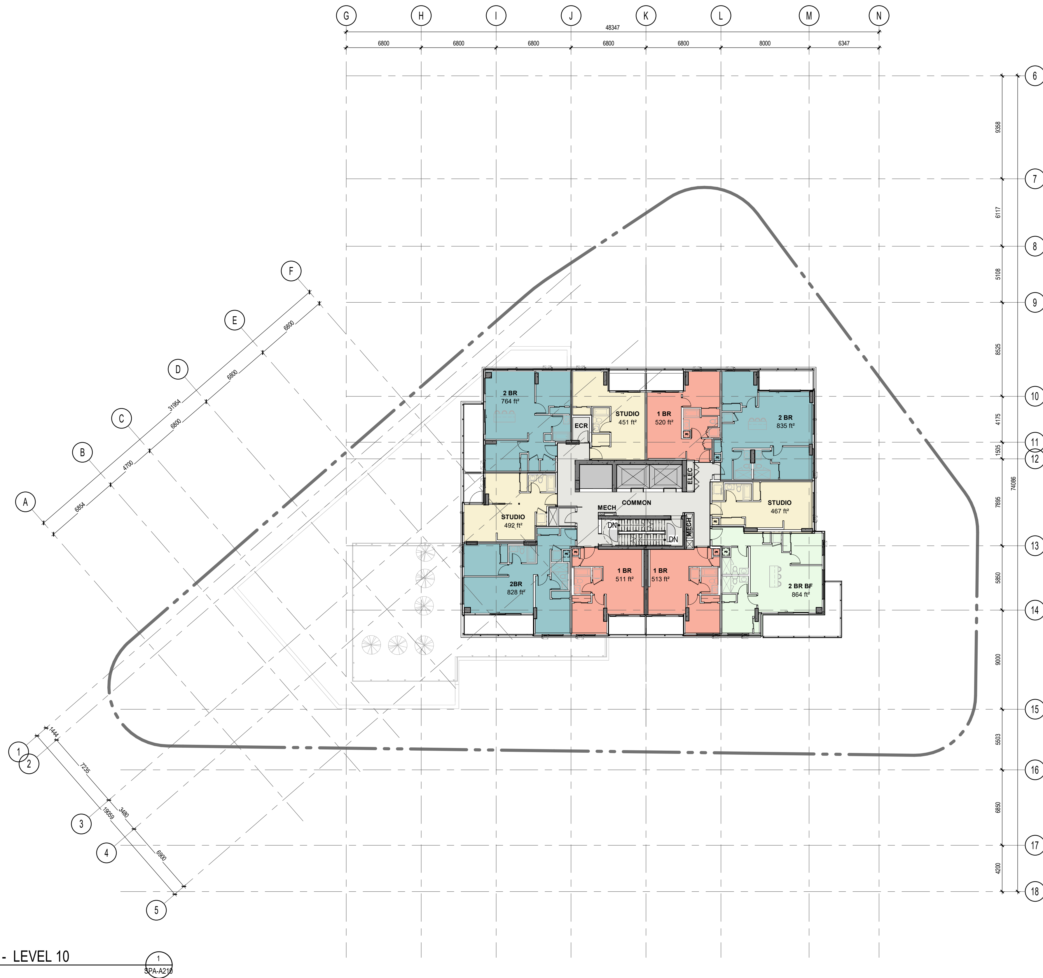
OVERALL PLAN - LEVEL 10 1 : 200