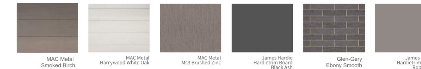
2 EXTERIOR MATERIAL PALETTE A10.03 1:2