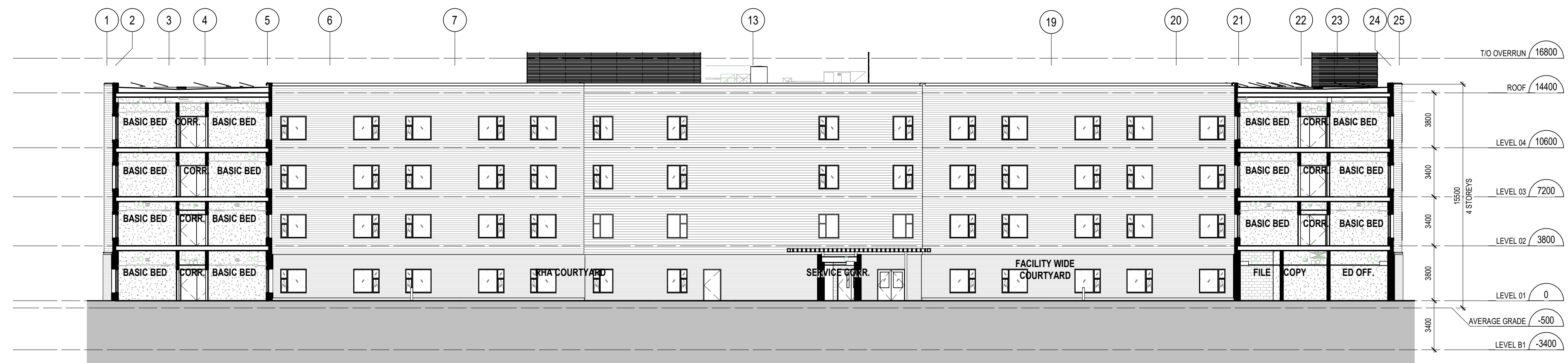
1 BUILDING SECTION - LOOKING EAST A5.01 1:200

8 2022/08/19 RE-ISSUED FOR SITE PLAN CONTROL APPLICATION & ZONING BY-LAW AMENDMENT MSA # date: revision: by: revisions