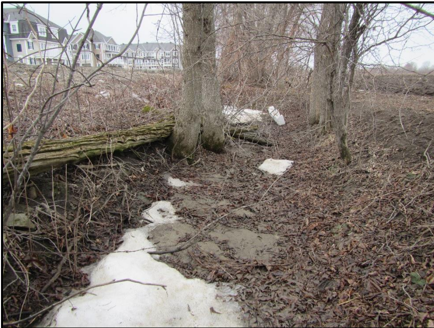
Photograph 4: Survey Site #2 upstream, facing upstream (March 24 th , 2021).