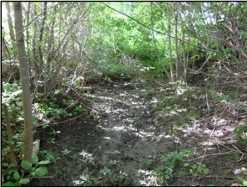
Photograph 27: Survey Site #3 upstream, facing upstream (July 11 th , 2021).