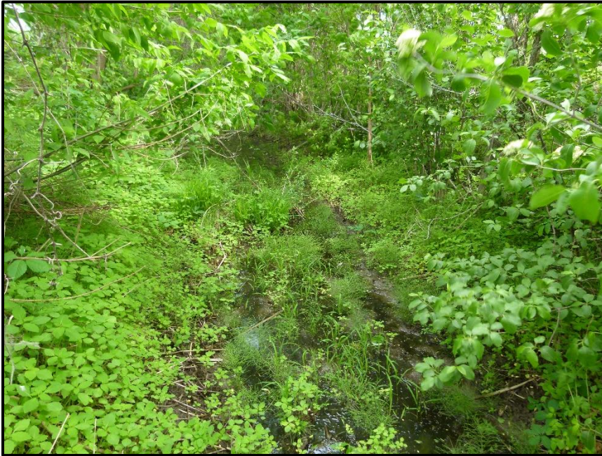
Photograph 17: Survey Site #3 upstream, facing downstream (May 26 th , 2021).