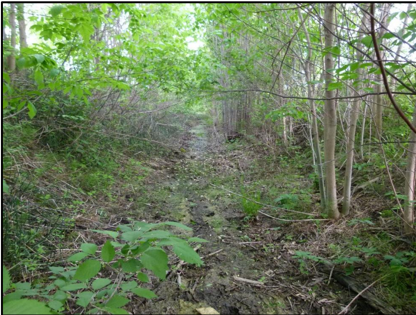
Photograph 18: Survey Site #4 downstream, facing downstream (May 26 th , 2021).