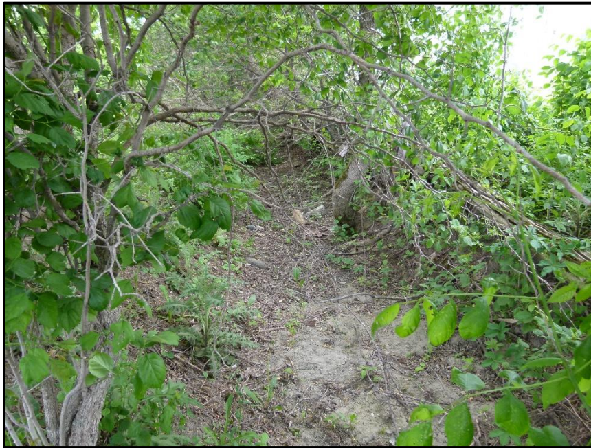
Photograph 15: Survey Site #2 upstream, facing downstream (May 26 th , 2021).