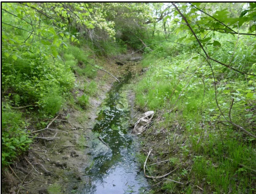
Photograph 20: Survey Site #5 downstream, facing downstream (May 26 th , 2021).