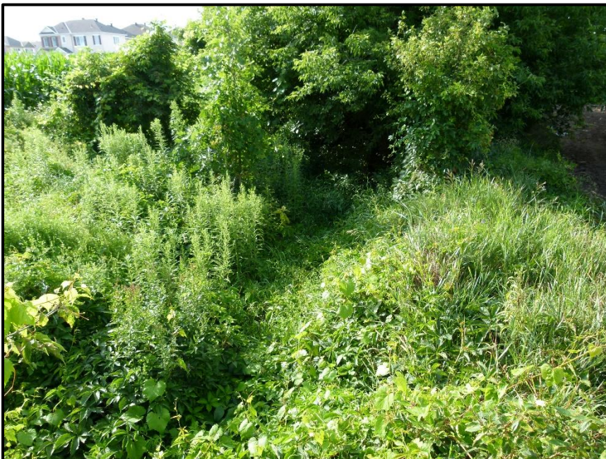
Photograph 24: Survey Site #2 downstream, facing upstream (July 11 th , 2021).