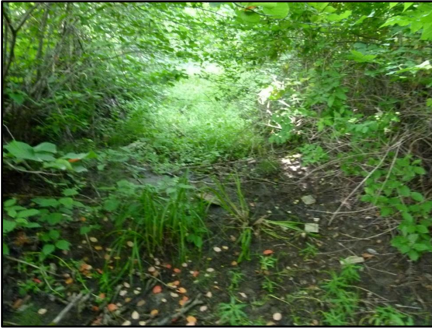
Photograph 29: Survey Site #4 upstream, facing upstream (July 11 th , 2021).