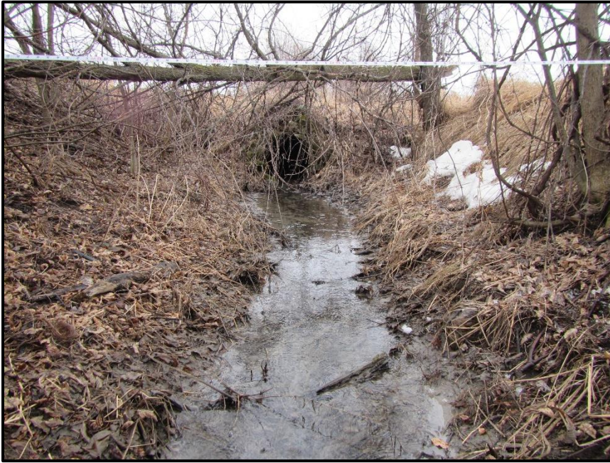
Photograph 5: Survey Site #3 downstream, facing upstream (March 24 th , 2021).