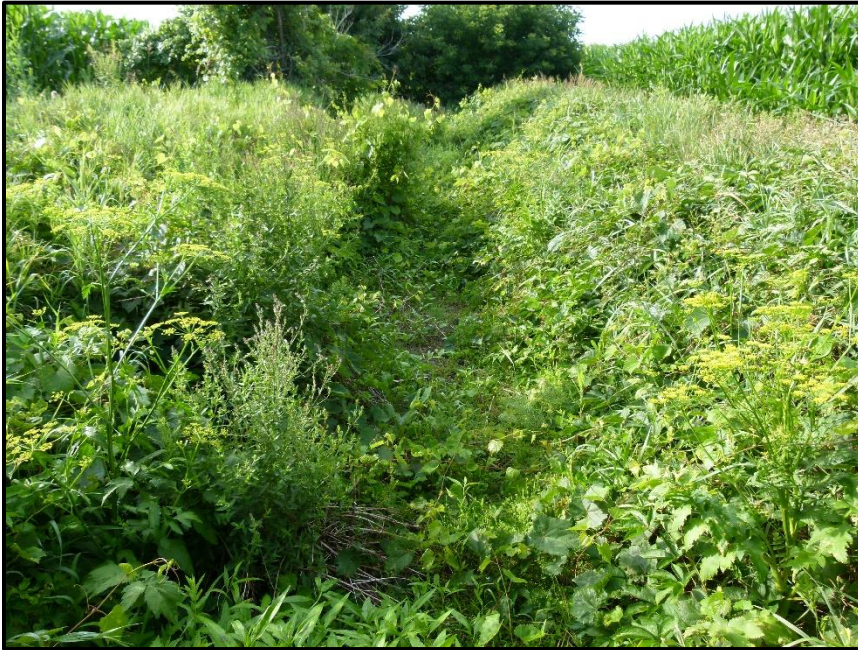
Photograph 23: Survey Site #1 upstream, facing upstream (July 11 th , 2021).