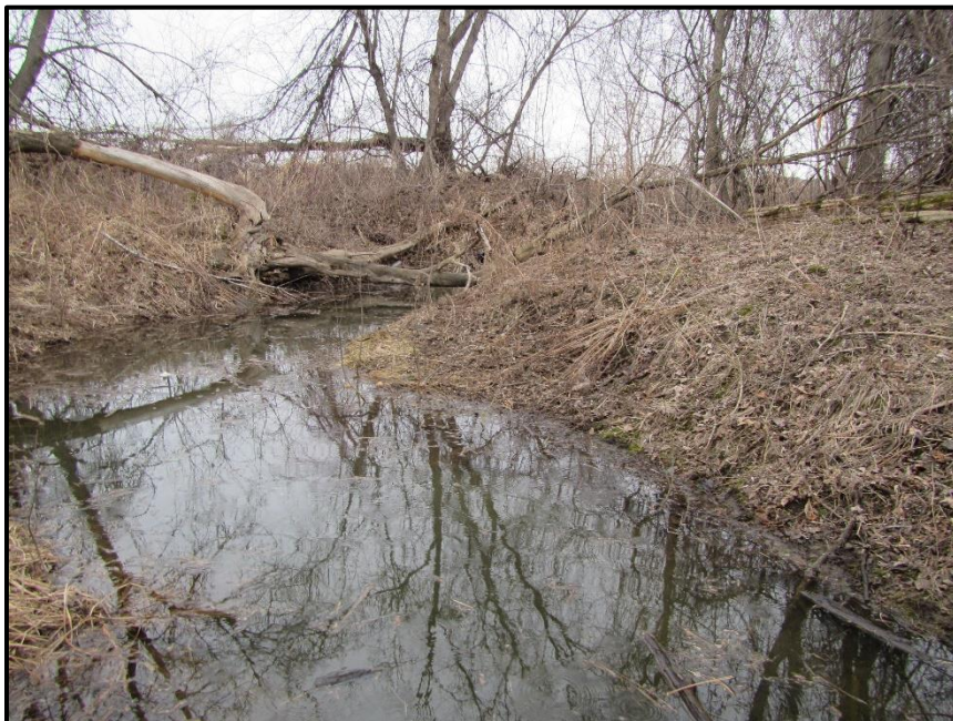
Photograph 10: Survey Site #5 downstream, facing upstream (March 24 th , 2021).