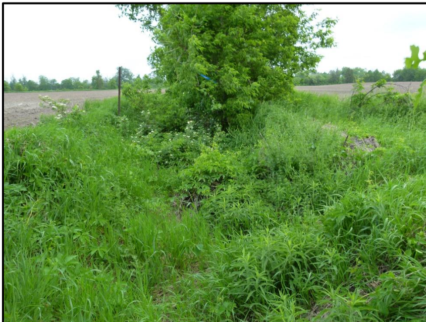
Photograph 14: Survey Site #2 downstream, facing downstream (May 26 th , 2021).