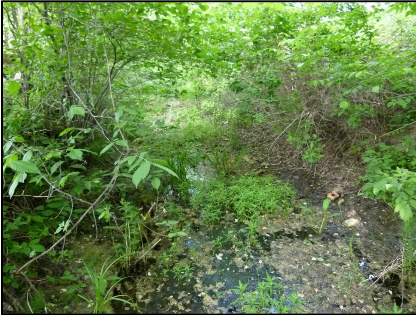
Photograph 19: Survey Site #4 upstream, facing downstream (May 26 th , 2021).