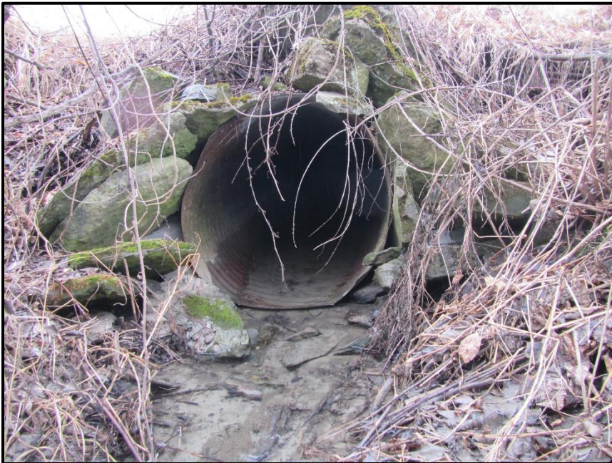
Photograph 6: 850 mm CSP culvert between the upstream and downstream portions of Survey Site #3 (March 24 th , 2021).