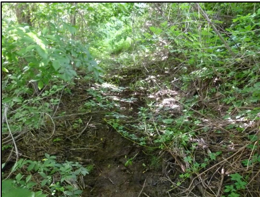
Photograph 28: Survey Site #4 downstream, facing upstream (July 11 th , 2021).