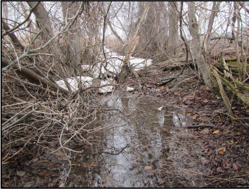
Photograph 3: Survey Site #2 downstream, facing upstream (March 24 th , 2021).