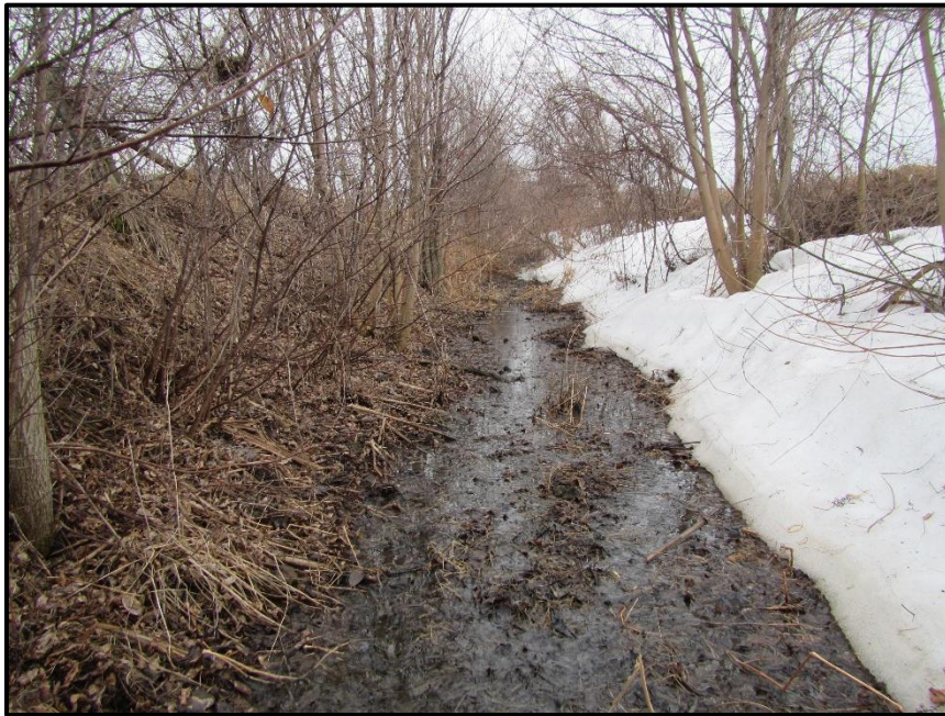
Photograph 7: Survey Site #3 upstream, facing upstream (March 24 th , 2021).