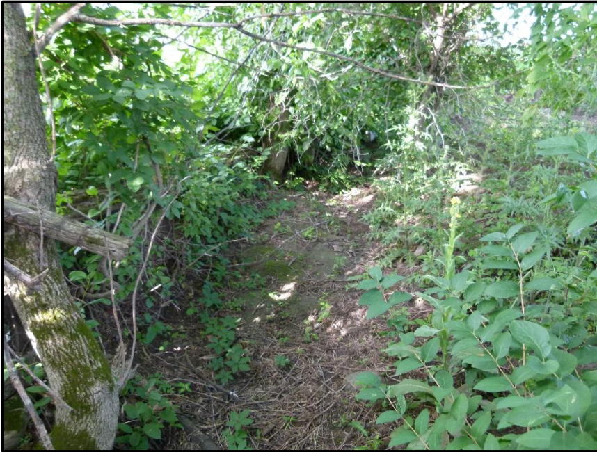
Photograph 25: Survey Site #2 upstream, facing upstream (July 11 th , 2021).