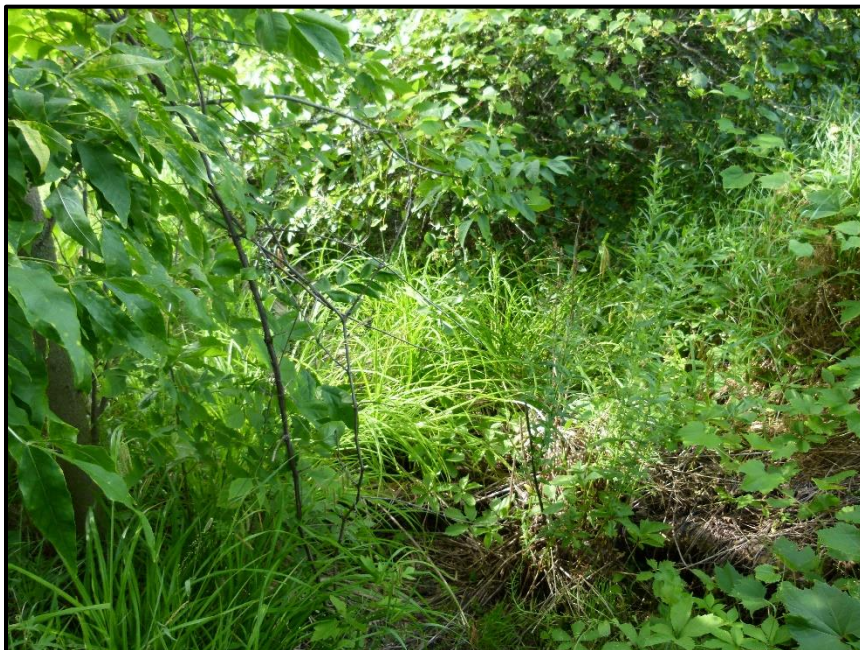
Photograph 22: Survey Site #1 downstream, facing upstream (July 11 th , 2021).