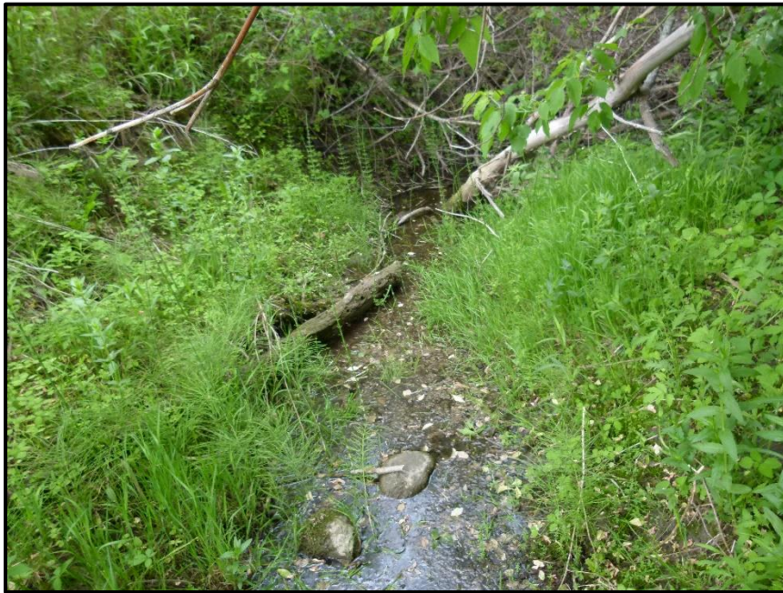
Photograph 21: Survey Site #5 upstream, facing downstream (May 26 th , 2021).