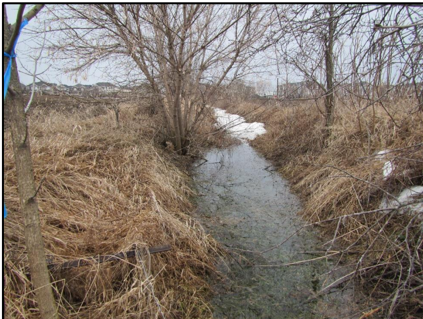
Photograph 2: Survey Site #1 upstream, facing upstream (March 24 th , 2021).