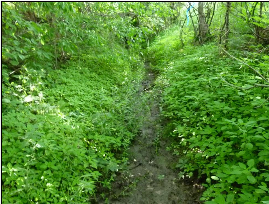
Photograph 26: Survey Site #3 downstream, facing upstream (July 11 th , 2021).