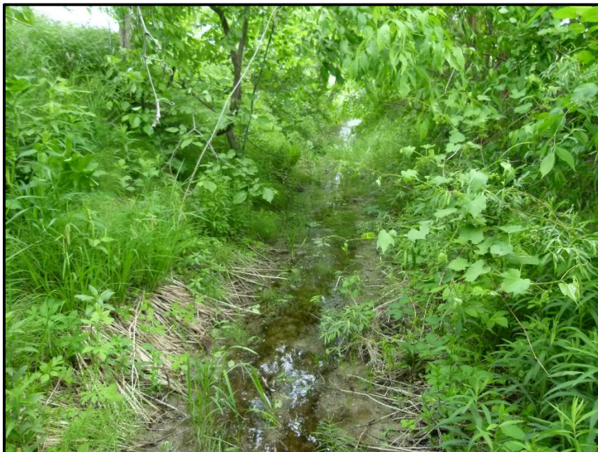
Photograph 16: Survey Site #3 downstream, facing downstream (May 26 th , 2021).