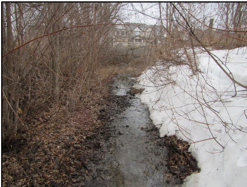
Photograph 8: Survey Site #4 downstream, facing upstream (March 24 th , 2021).