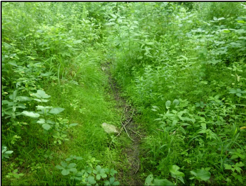
Photograph 30: Survey Site #5 downstream, facing upstream (July 11 th , 2021).