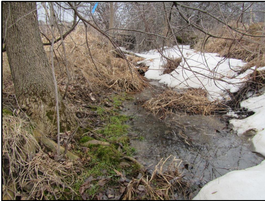
Photograph 1: Survey Site #1 downstream, facing upstream (March 24 th , 2021).