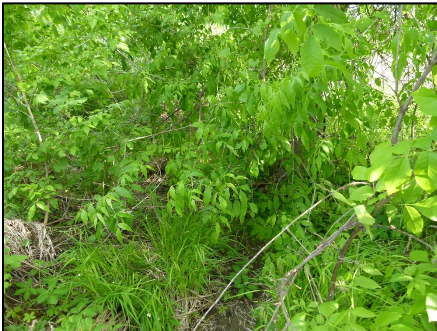
Photograph 12: Survey Site #1 downstream, facing downstream (May 26 th , 2021).