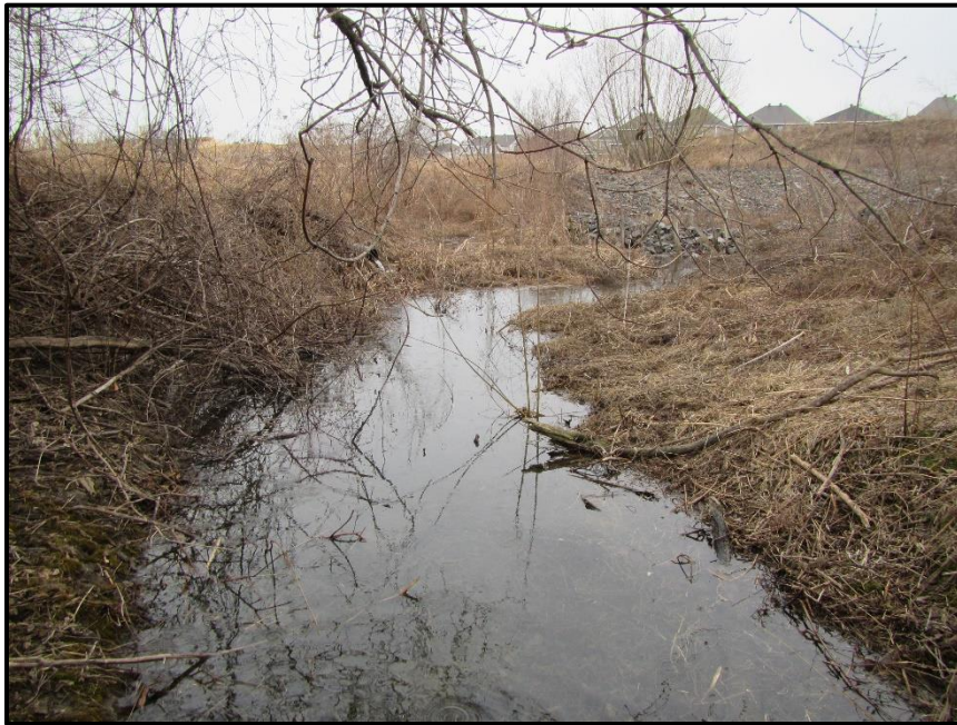
Photograph 11: Survey Site #5 upstream, facing upstream (March 24 th , 2021).