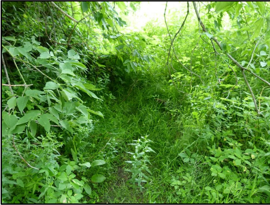
Photograph 31: Survey Site #5 upstream, facing upstream (July 11 th , 2021).