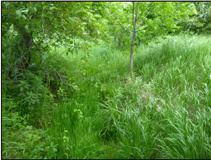
Photograph 13: Survey Site #1 upstream, facing downstream (May 26 th , 2021).