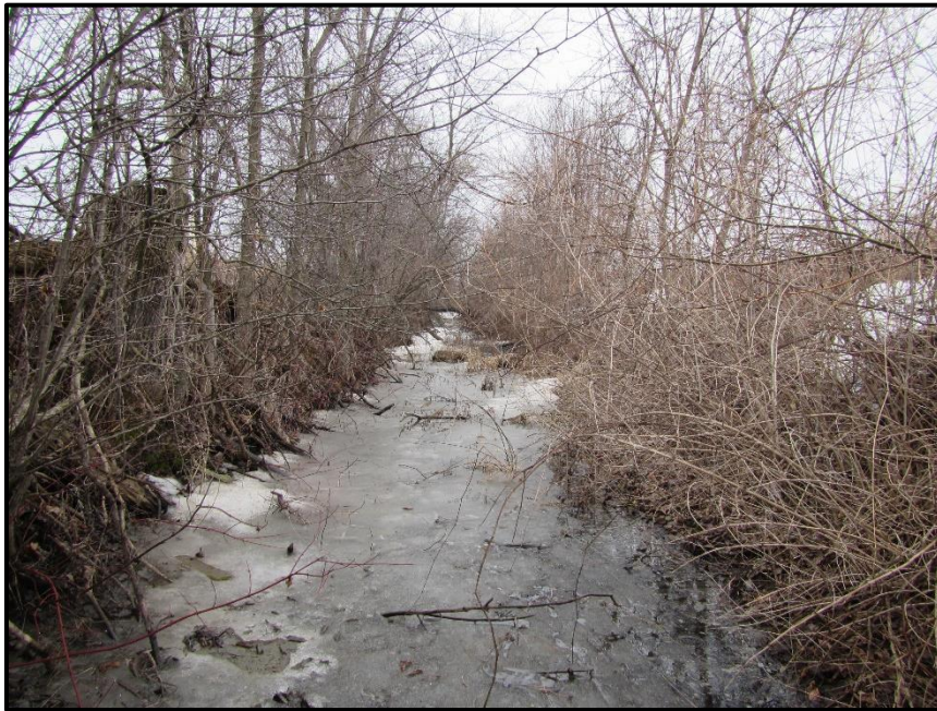
Photograph 9: Survey Site #4 upstream, facing upstream (March 24 th , 2021).