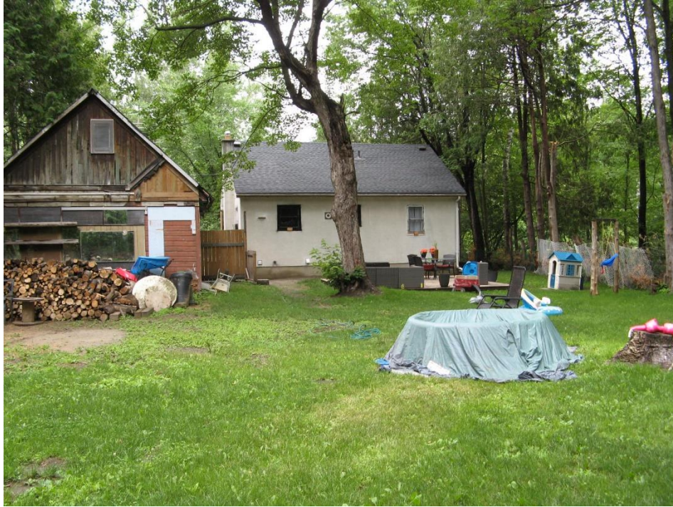
Photo 3 – Rear yard of 3044 Innes Road. View looking north to red maple in apparently poor condition.