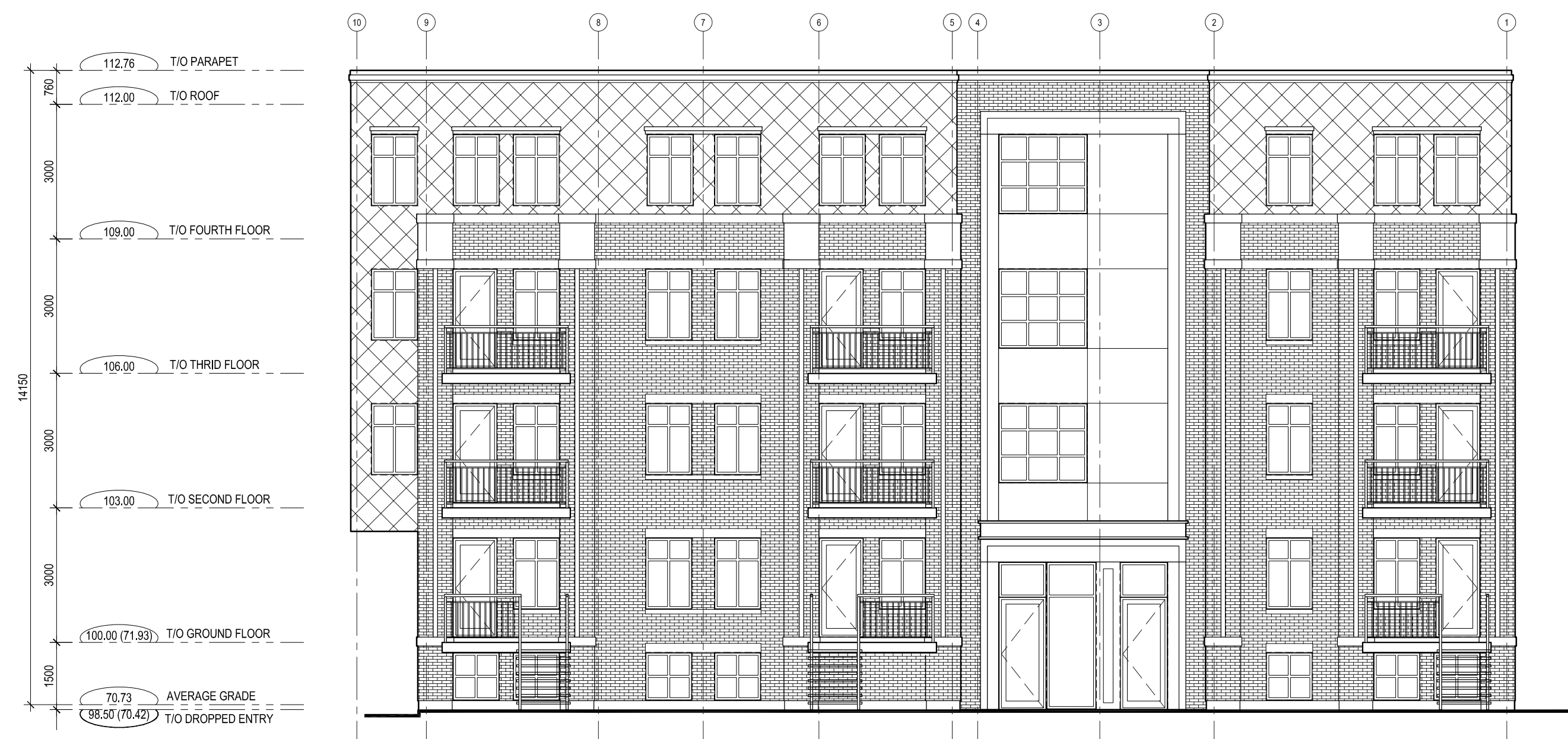
1 FRONT (NORTH) ELEVATION A-201 SCALE: 1:100