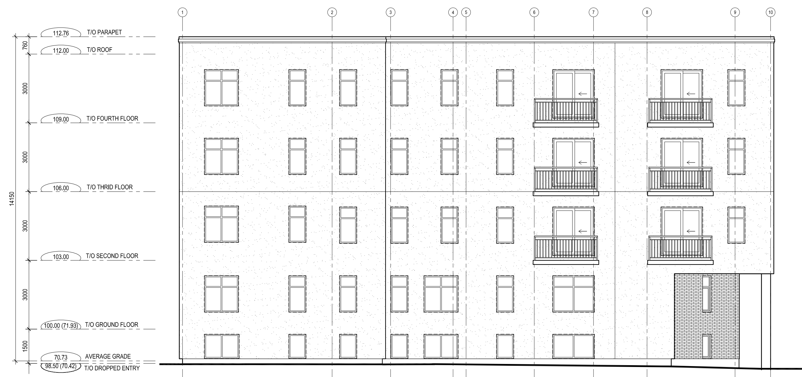
3 REAR (SOUTH) ELEVATION A-201 SCALE: 1:100