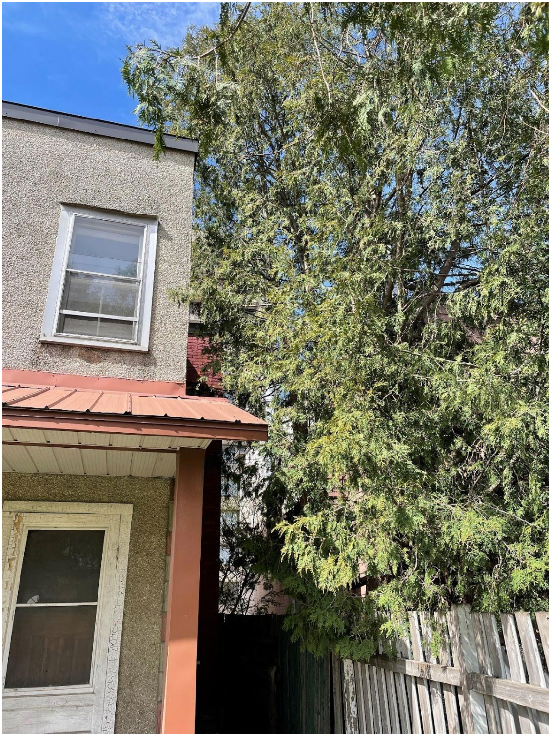
Figure 1: Tree 1, eastern white cedar on adjacent property to be retained