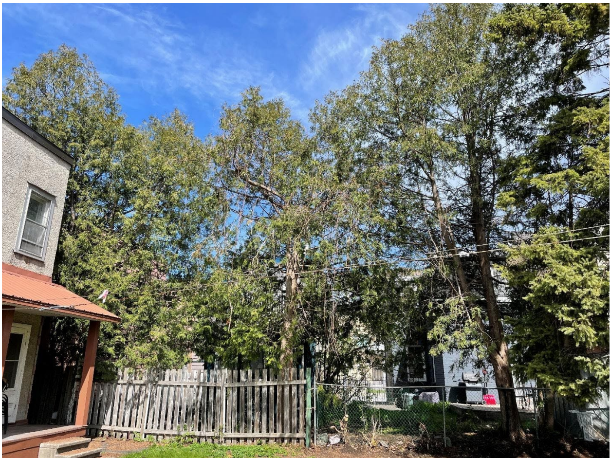
Figure 2: Trees 1 (left), 2 (middle), 3 (right), all eastern white cedar