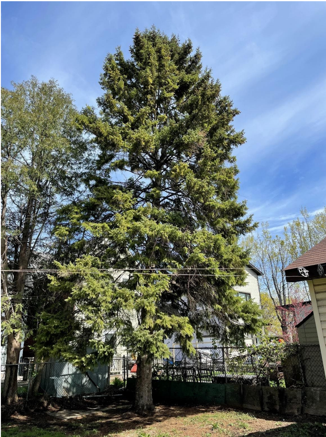
Figure 3: Tree 4, white spruce to be retained