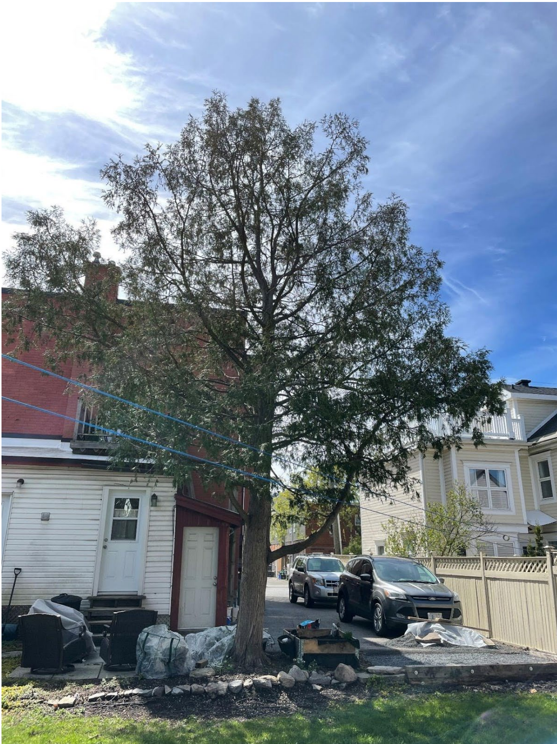
Figure 4: Tree 5, eastern white cedar on adjacent property to be retained