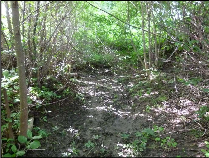
Photograph 27: Survey Site #3 upstream, facing upstream (July 11 th , 2021).