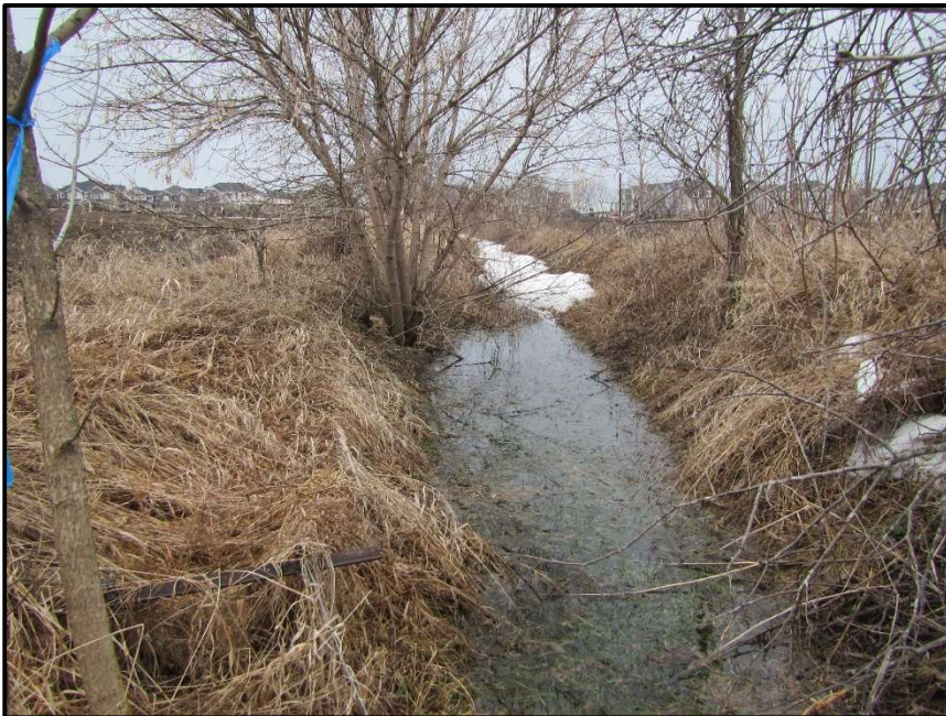
Photograph 2: Survey Site #1 upstream, facing upstream (March 24 th , 2021).