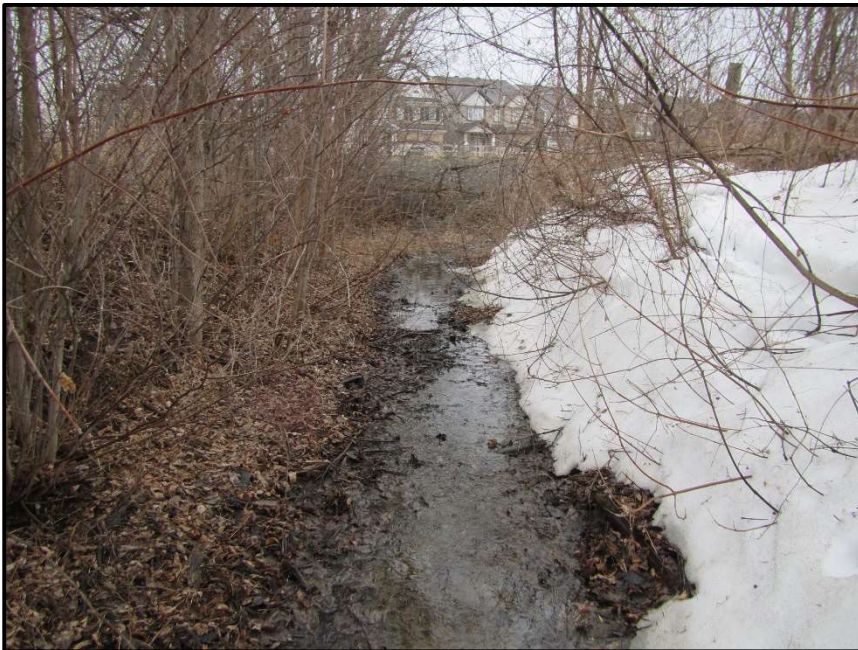
Photograph 8: Survey Site #4 downstream, facing upstream (March 24 th , 2021).