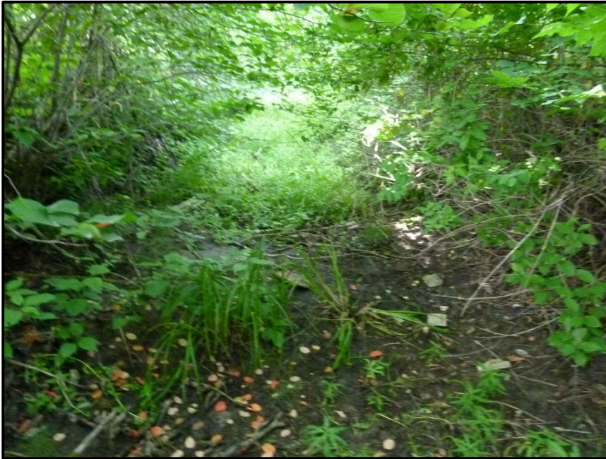
Photograph 29: Survey Site #4 upstream, facing upstream (July 11 th , 2021).