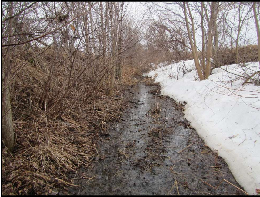
Photograph 7: Survey Site #3 upstream, facing upstream (March 24 th , 2021).