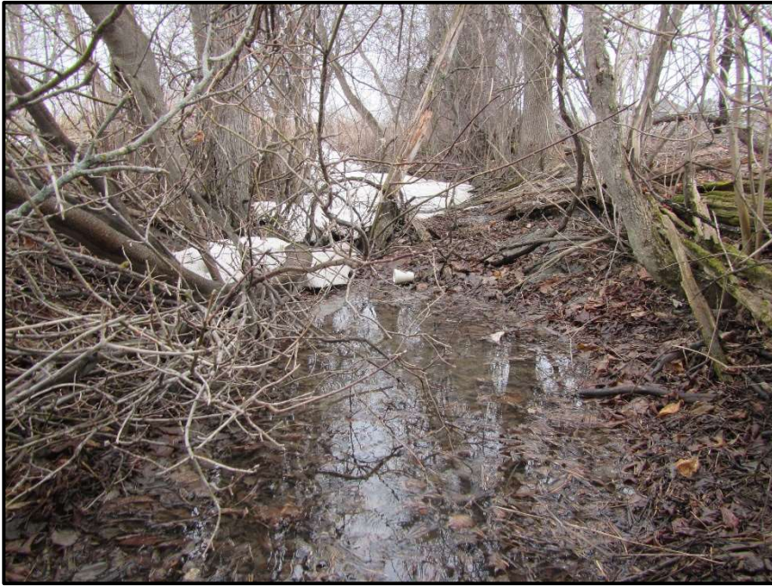
Photograph 3: Survey Site #2 downstream, facing upstream (March 24 th , 2021).