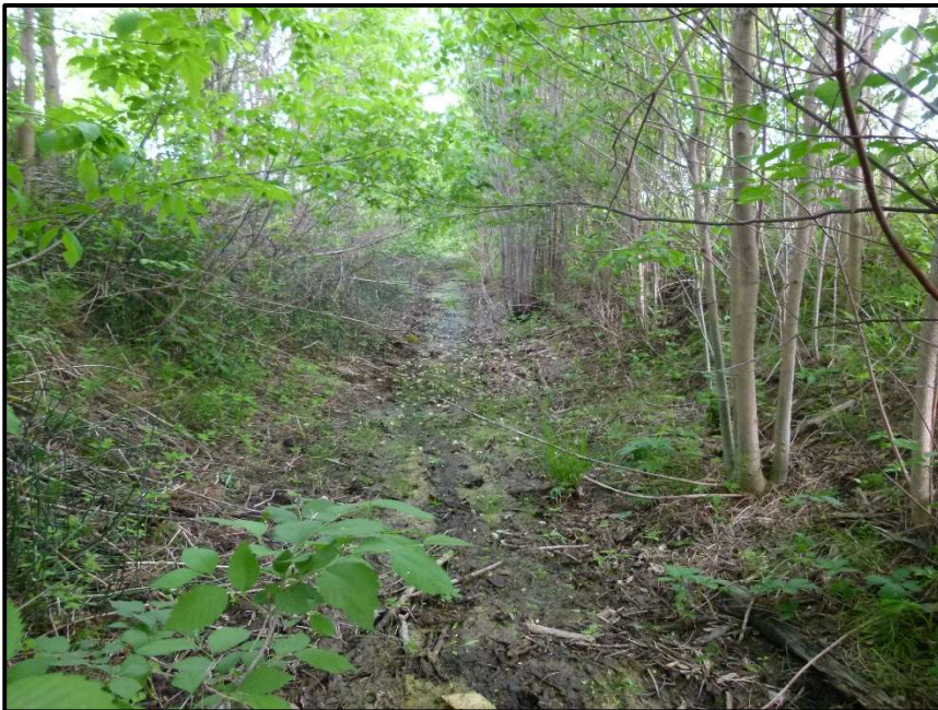
Photograph 18: Survey Site #4 downstream, facing downstream (May 26 th , 2021).