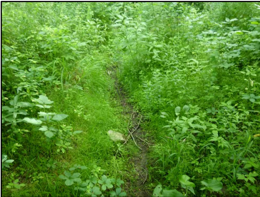
Photograph 30: Survey Site #5 downstream, facing upstream (July 11 th , 2021).