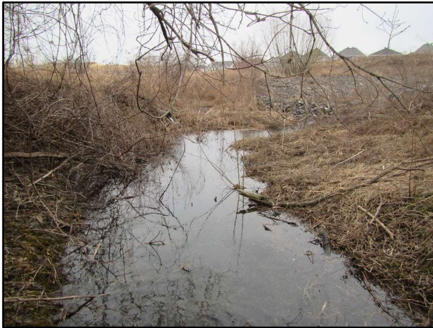
Photograph 11: Survey Site #5 upstream, facing upstream (March 24 th , 2021).