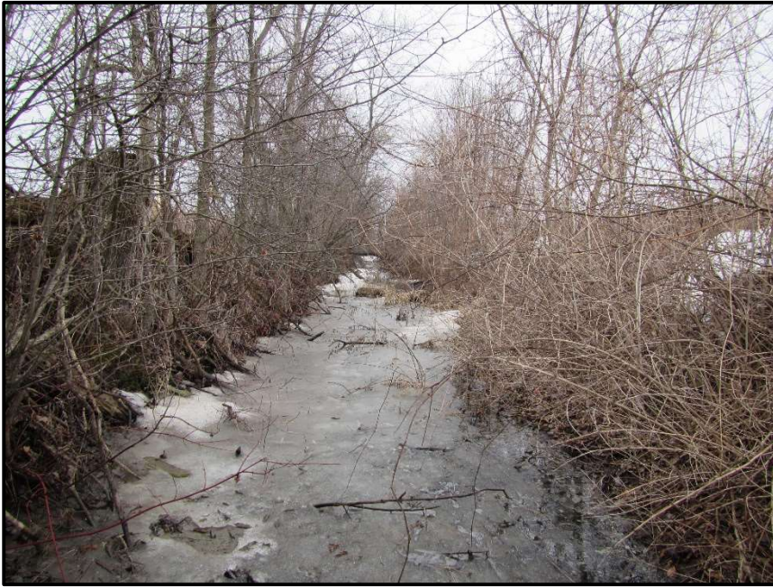
Photograph 9: Survey Site #4 upstream, facing upstream (March 24 th , 2021).