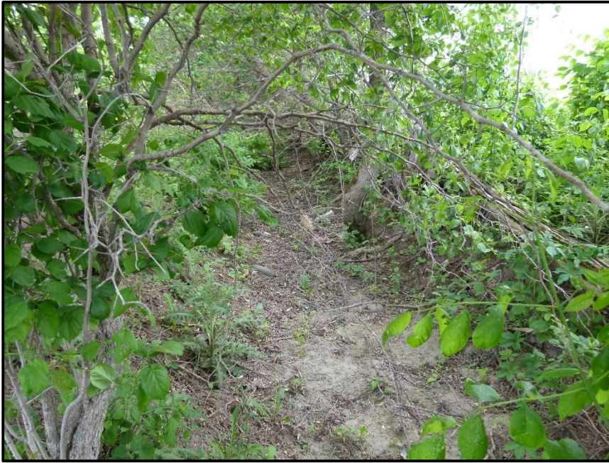
Photograph 15: Survey Site #2 upstream, facing downstream (May 26 th , 2021).