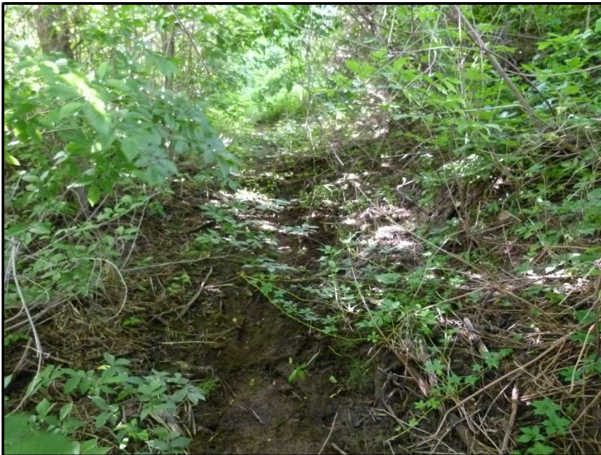
Photograph 28: Survey Site #4 downstream, facing upstream (July 11 th , 2021).