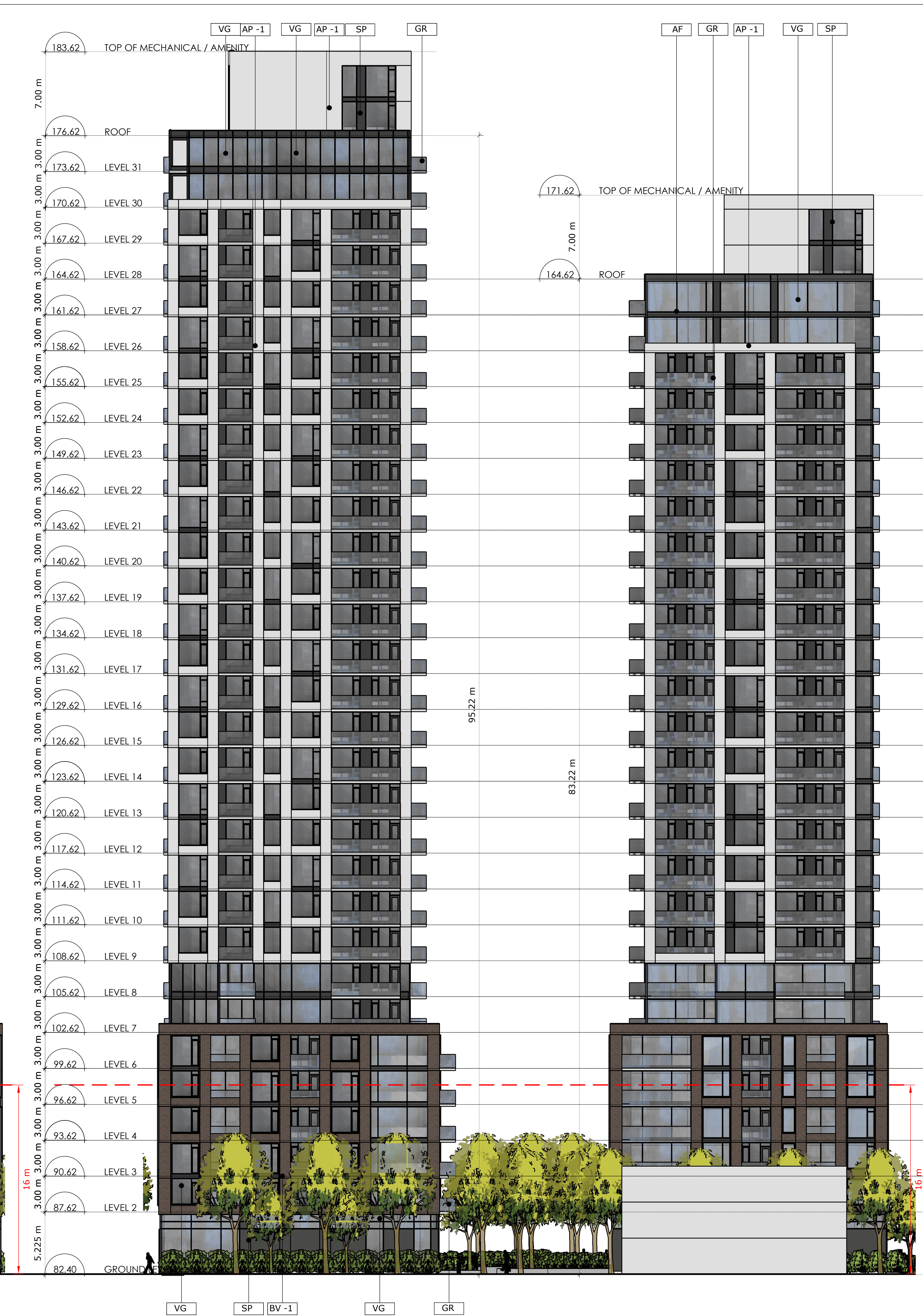
1 NORTH ELEVATION A3.03 Scale: 1: 200