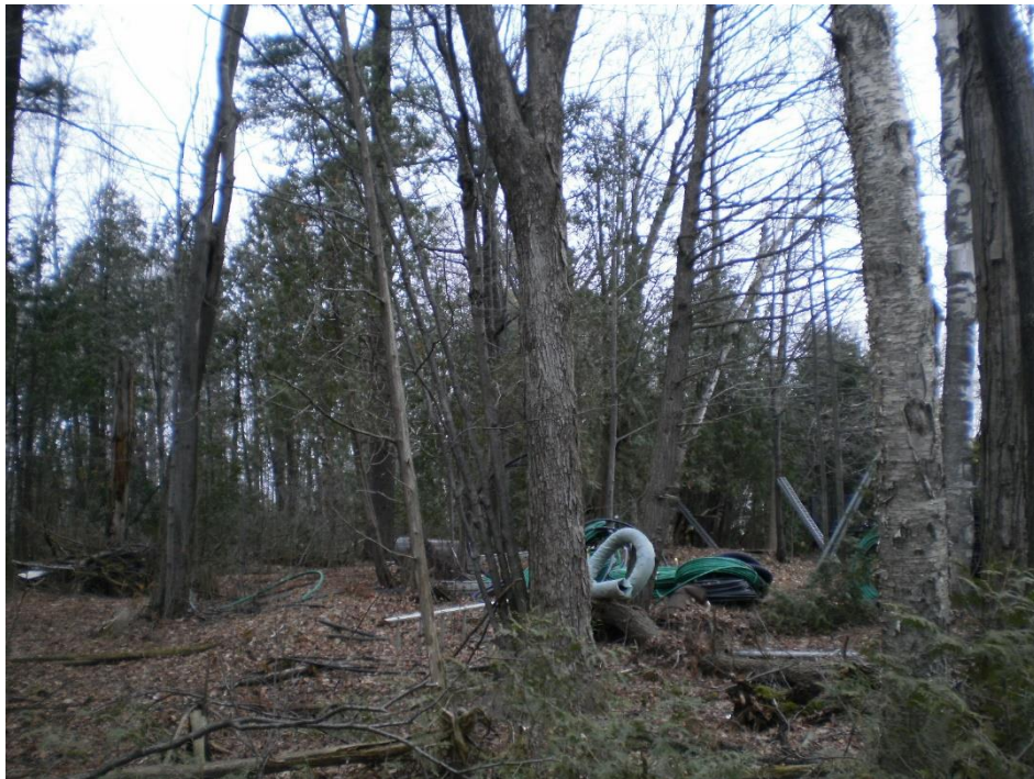
Photo 7 – Larger trees were more common in the northeast portion of the site. Debris was also common in this area (December 4 th , 2017)