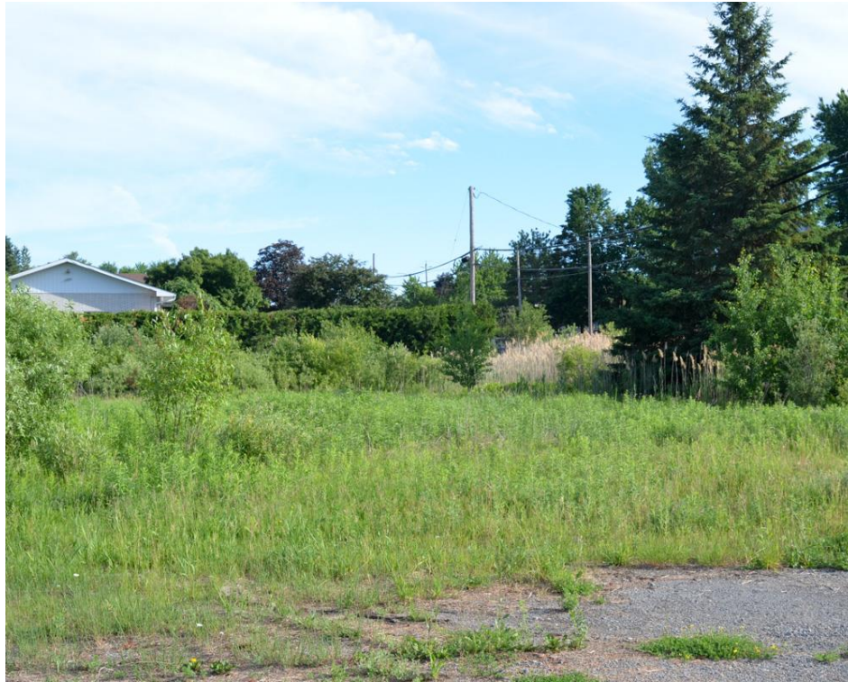
Photo 16 – Cultural meadow in the expanded site area in the southeast corner of the site. View looking north from north edge of gravel fill (June 10 th , 2021)