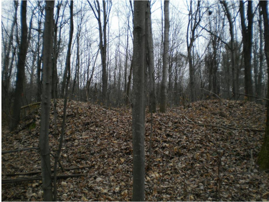
Photo 10 – Another example of the spoil piles, in the southeast portion of the site (December 4 th , 2017)