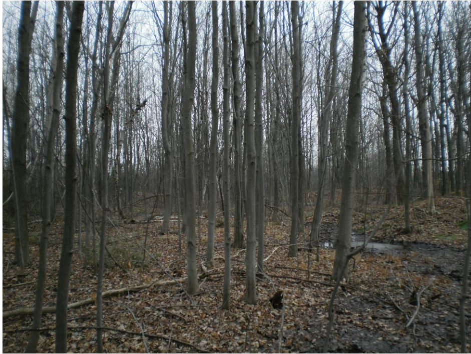
Photo 6 – Typical maple tree size, with white birch and trembling aspen present. This example is in the south-central portion of the site (December 4 th , 2017)