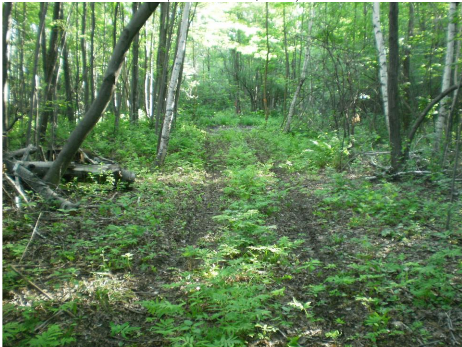
Photo 11 – Many access lanes are on the site. This example is in the southwest portion, with view looking west (June 20 th , 2018)