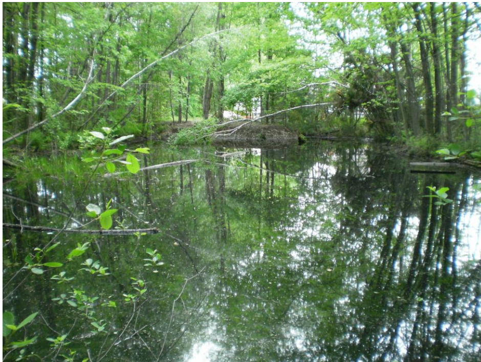
Photo 1 – One of the larger areas of standing water. This example is in the northeast portion of the site (May 27 th , 2018).

The site has become more isolated as the adjacent portions of south Orleans are converted to urban residential development, including construction of Brian Coburn Boulevard and many urban subdivisions. The lands between the site and Mer Bleue are now dominated by urban residences, providing no wildlife linkage to the extensive natural areas of Mer Bleue. Thus, the site is not anticipated to perform a significant linkage function.