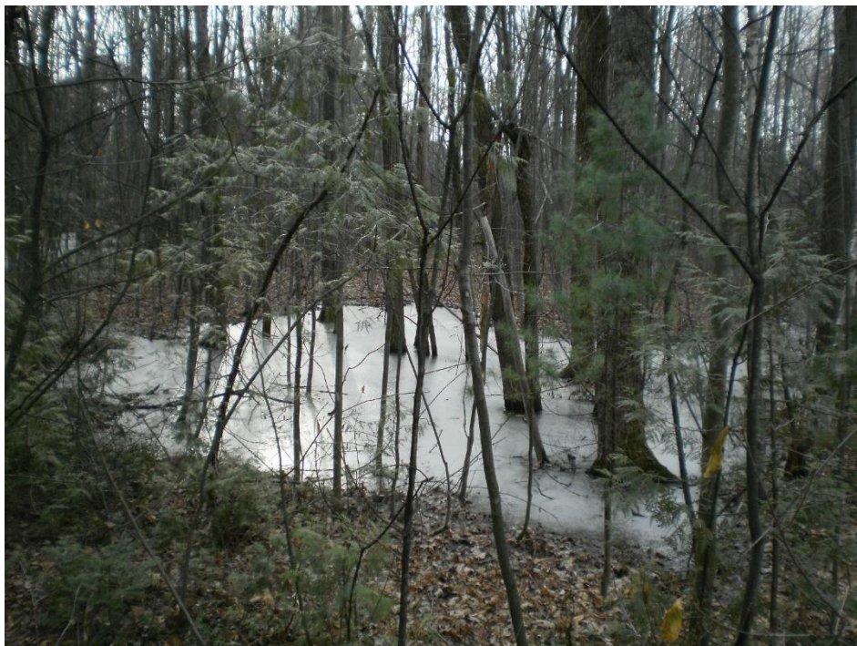
Photo 3 – Another low area from former extraction activity. This example is in the west portion of the site (December 4 th , 2017)