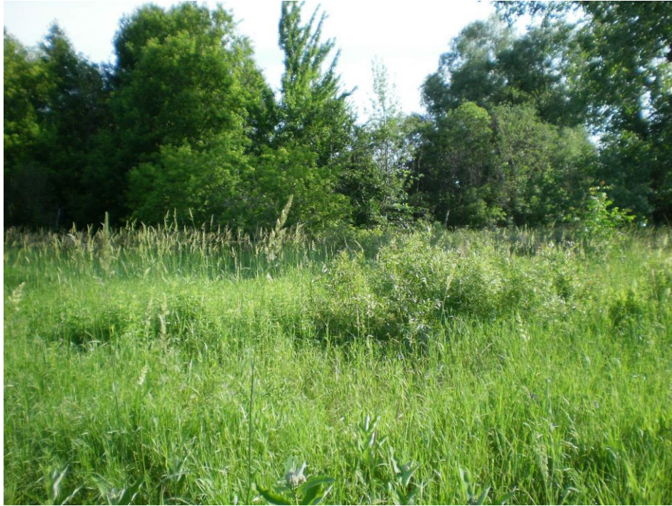
Photo 14 - Cultural meadow in the southeast corner of the site north of Navan Road. View looking north to the southeast edge of maple swamp (June 20 th , 2018)