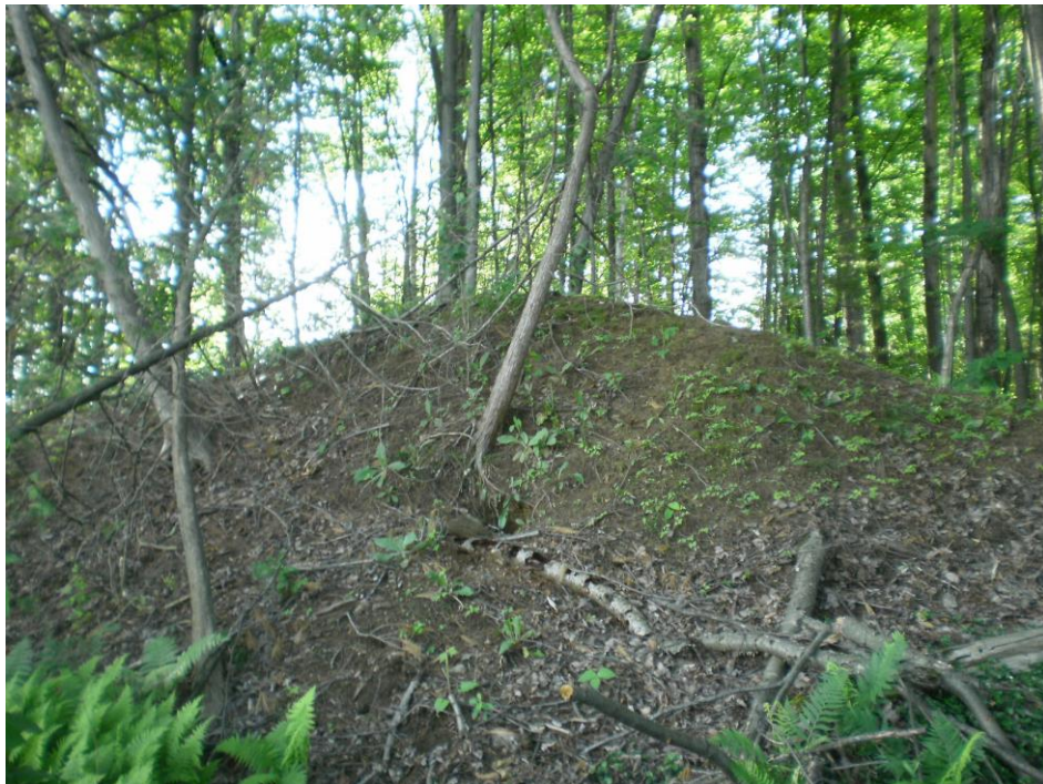
Photo 9 – Spoil piles from past sand extraction are common throughout the site. This example is in the northeast portion of the site (June 20 th , 2018)