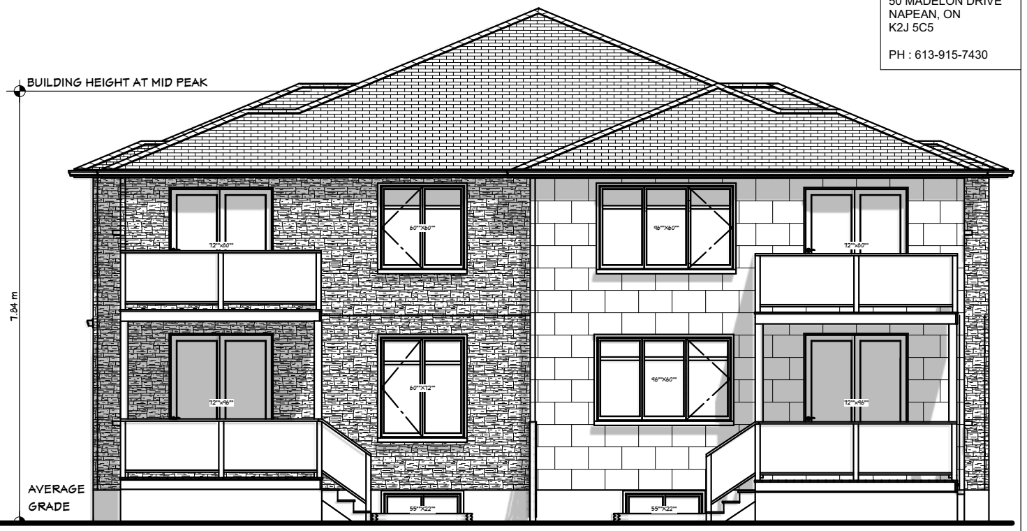
○ PROPOSED REAR ELEVATION SCALE 1/8" = 1'-0"