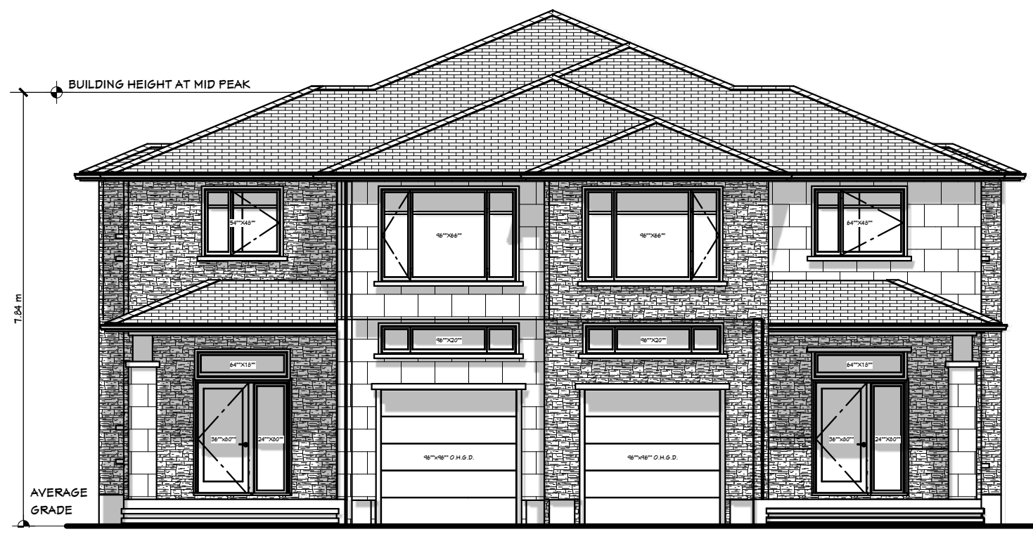
○ PROPOSED FRONT ELEVATION SCALE 1/8" = 1'-0"

PROPERTY OF JOHN RUSSO 1412 STAR TOP ROAD OTTAWA, ON K1B 4V7 DESIGNER BRENT KELLY 50 MADELON DRIVE NAPEAN, ON K2J 5C5 PH : 613-915-7430