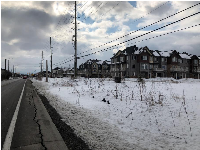
Photo 4 – Looking southeast at Maple Grove Road and residential houses on the surrounding lands south of the Site.