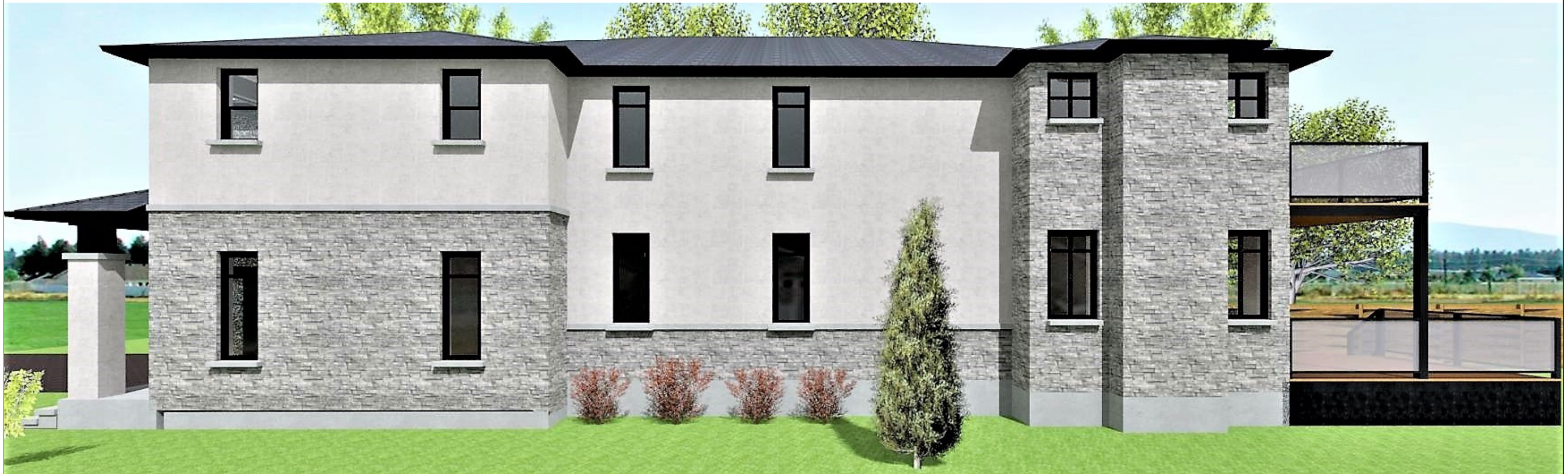
○ CONCEPT 3D VIEWS