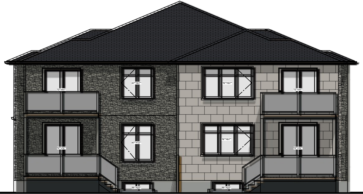
○ PROPOSED REAR ELEVATION SCALE 1/8" = 1'-0"