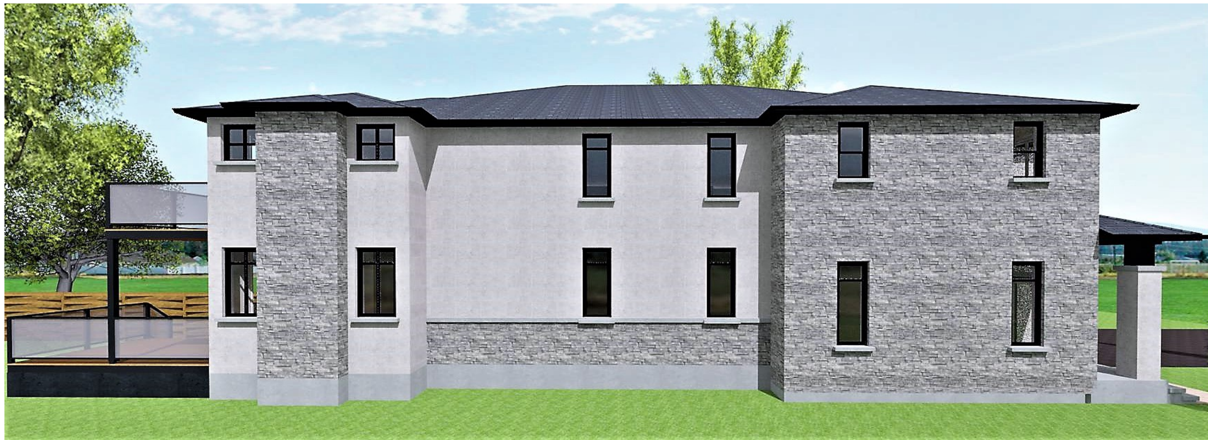
○ CONCEPT 3D VIEWS