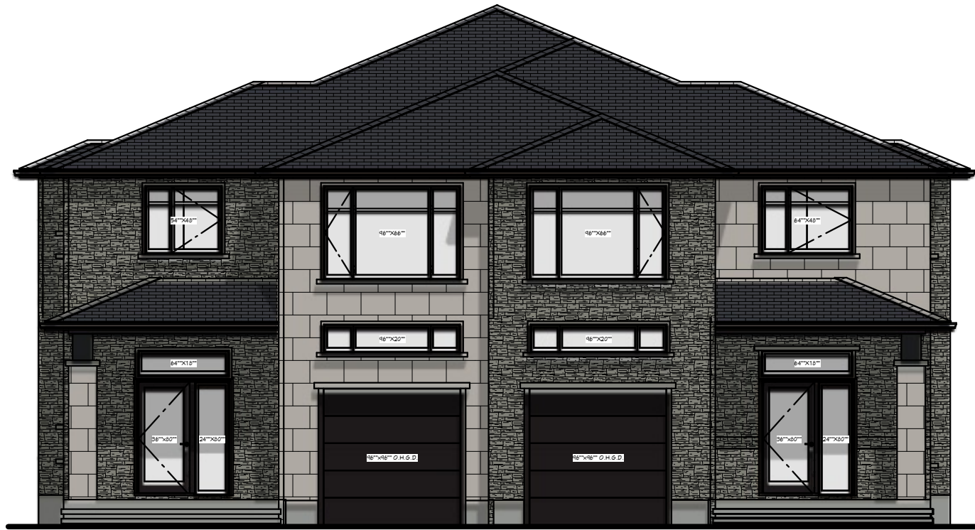
○ PROPOSED FRONT ELEVATION SCALE 1/8" = 1'-0"