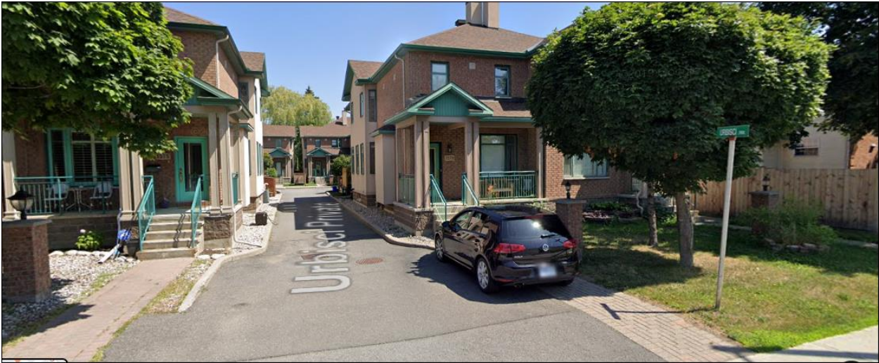
Figure 10- 1091-1095 Normandy Crescent– Multiple semi- detached units