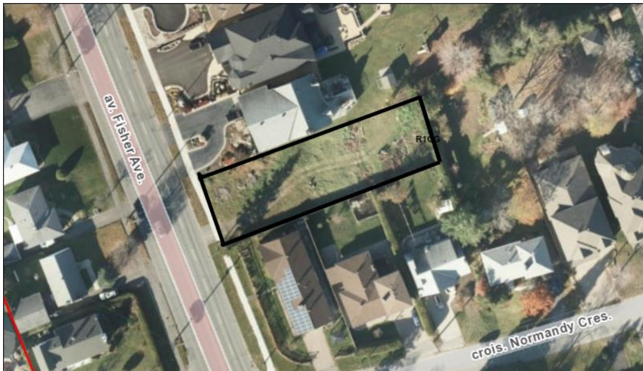
Figure 1. Location and Zoning

Rortar Land Development Consultants have been retained by the owner of 1707 Fisher Avenue to prepare a planning rationale in support of an application for amendment to City of Ottawa Zoning By-law 2008-250. The purpose of the application is to facilitate development of an existing parcel of residential land at 1707 Fisher Avenue in the Carleton Heights Community of the City of Ottawa. The now vacant property is located on the easterly side of Fisher Avenue, 0.7 km. south of Meadowlands Drive, north of Normandy Crescent as shown in Figure 1.