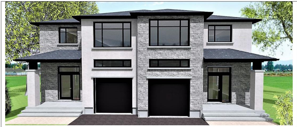
FIGURE 3: FRONT ELEVATION

Figures 3-5 below shows the front, rear and side elevations of the proposed semi-detached building. All elevations feature combinations of masonry and stucco finishing with architecturally integrated glazing and decking materials.