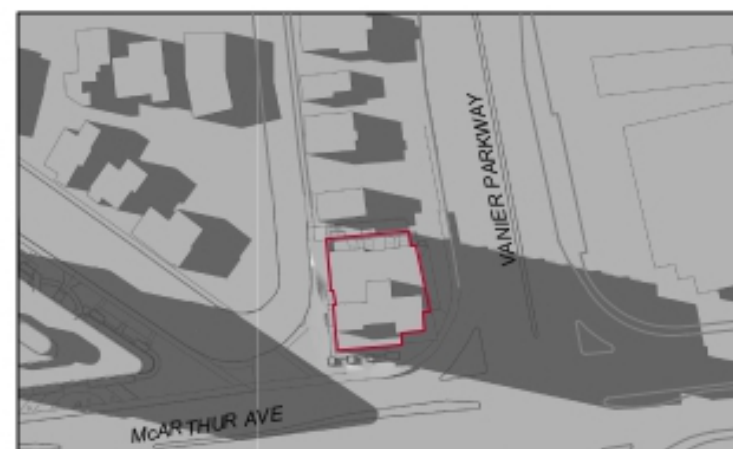
JUNE 20, 5:30pm