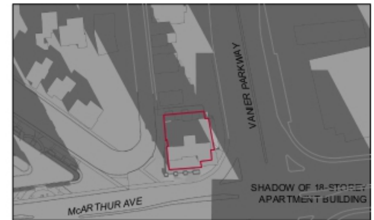
DEC 20, 10:00am