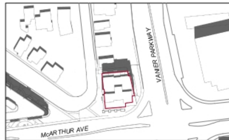
JUNE 20, 12:00pm