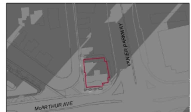
DEC 21, 3:00pm