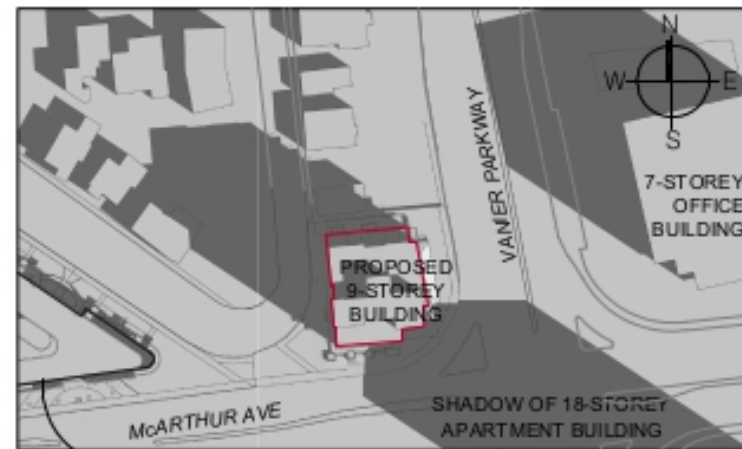
8-STOREY APARTMENT BUILDING CURRENTLY UNDER CONSTRUCTION MARCH 20, 9:00am