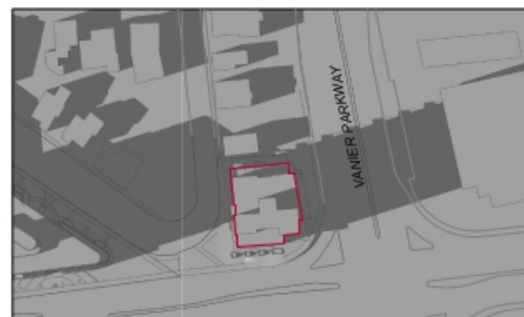
MARCH 20, 4:30pm