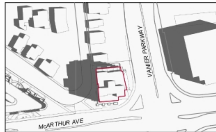
JUNE 20, 9:00am