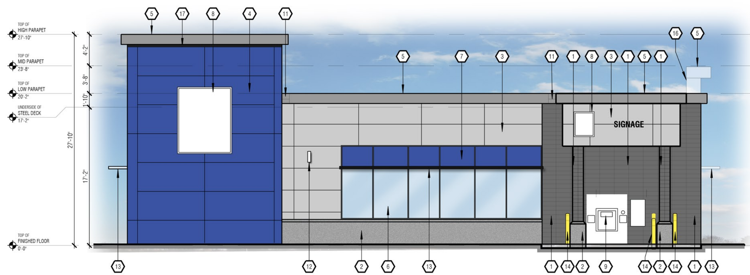
3 WEST ELEVATION SK-2 1/8" = 1'-0"