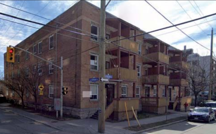
(Figure 5) Gainsborough Apartement Building