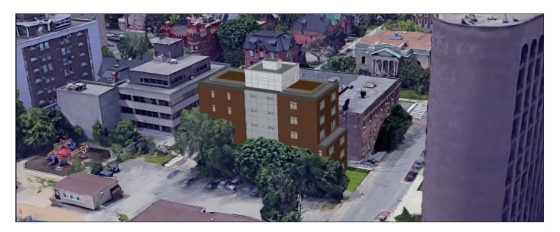
(Figure 8) 246 Gilmour Street - Proposed Development

As stated in the District Plan, "the building form should respect the massing of adjacent heritage properties". The proposed addition actually improves the properties massing with respect to the adjacent properties by bridging the form of the existing high-two-storey school to the east and the multi-tenant original heritage 3 storey residential structures to the west.