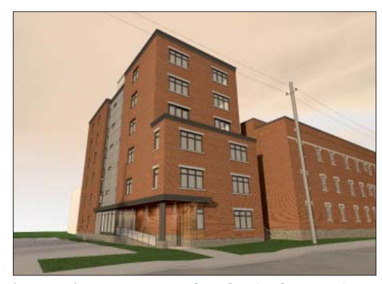
(Figure 11) Perspective view: front facade of proposed development

The design of the Entrance Canopy support column and the railings should take cues from the wood bacony supports and railings of the buildings from the Centertown area.