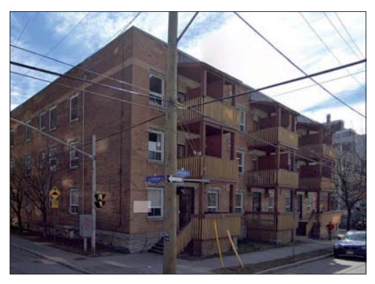
(Figure 13) Gainsborough Apartments