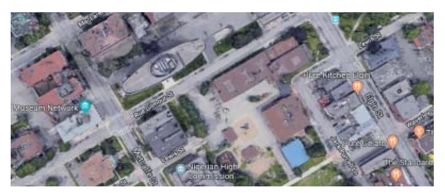
(Figure 1)Bird's eye view of site