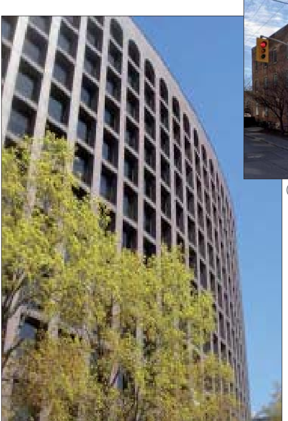
(Figure 7) Public Service Alliance Building

The new development's facades are to be clad mainly in red brick, with prefinished metal panels as accents and to cover the upper penthouse.