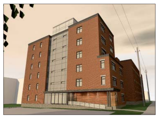
(Figure 12) Perspective view: side facade of proposed development