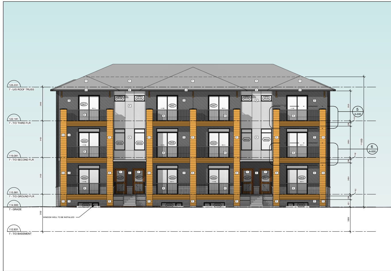
1 SOUTH ELEVATION 7-A200 1:75

PAPER SIZE: ARCH D 24" x 36" (610.00 x 914.00 mm) PLOT SCALE: 1:1