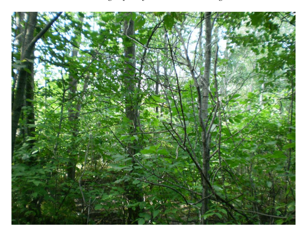
Photo 11 – Typical deciduous trees proposed for removal for road construction in the southwest portion of the upland maple deciduous forest. View looking north