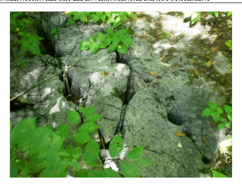
Photo 8 – Fissures in the exposed bedrock are common in the upland maple forest. This example is in the east portion of the forest