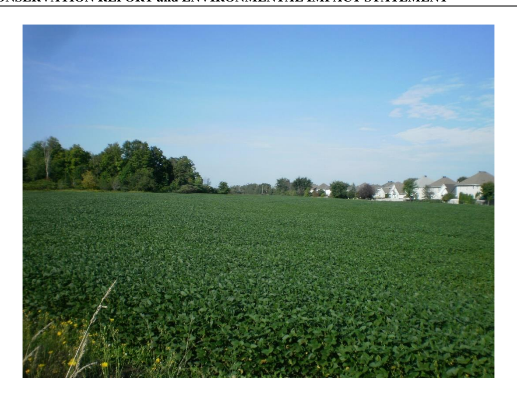
Photo 2 – Soybean field in the east portion of the site, with maple forest in the background. View looking west from Plainridge Crescent