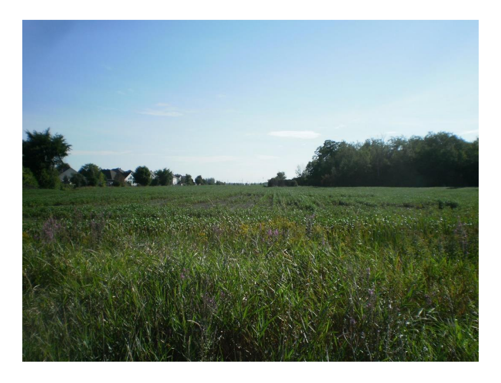
Photo\ 1-Soybean\ field\ in\ the\ west\ portion\ of\ the\ site,\ with\ maple\ forest\ in\ the\ background. View looking east from Portobello Boulevard

grey squirrel. No stick nests or other evidence of raptor use were observed. A few large trees with cavities for potential summer bat roosts were observed in the upland deciduous forest in the central portion of the Phase 6 lands (Photo 6).