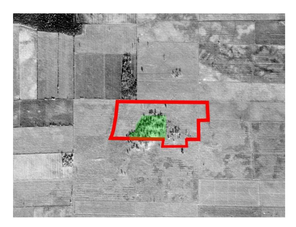
Figure 1 – 1960 aerial photography with site outlined in red and forest to be retained shaded in green

The Natural Heritage Reference Manual (OMNR 2010) provides criteria for identifying significant valleylands. No significant valleylands are present on or adjacent to the Phase 6 lands.