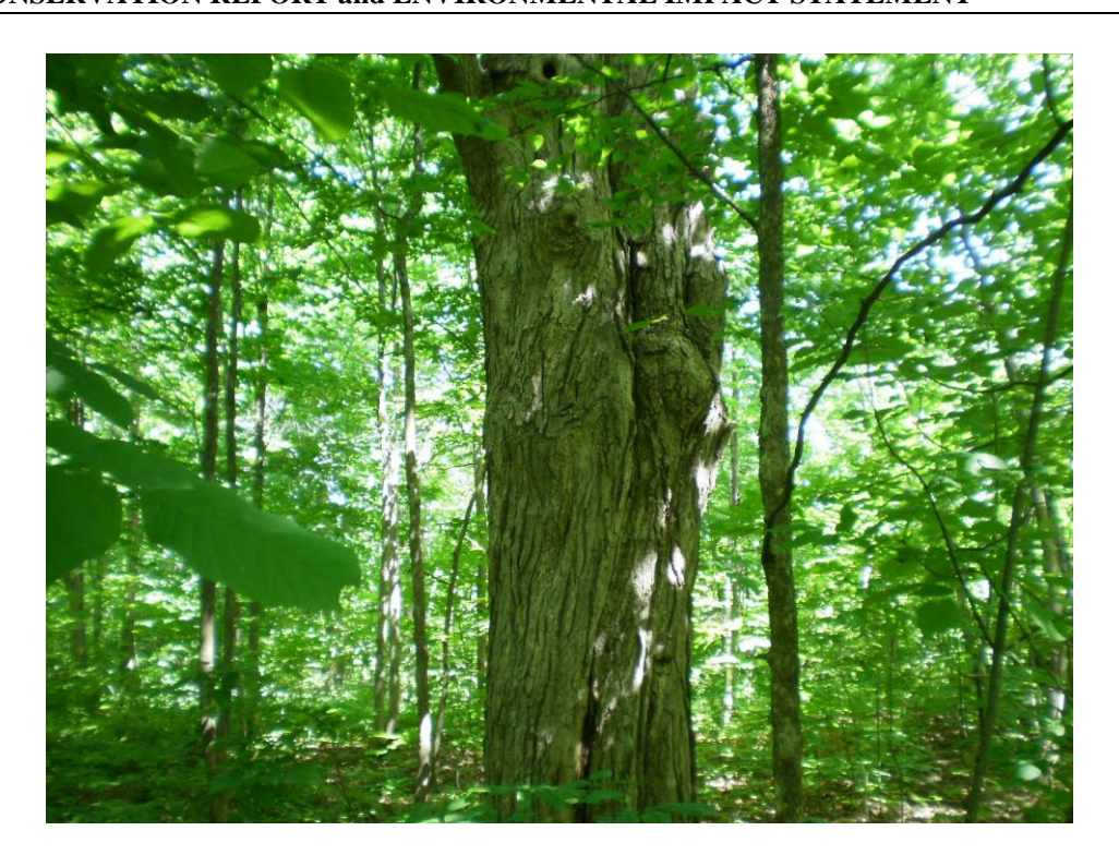
Photo 6 – Mature sugar maple with potential wildlife cavities to be retained along the east edge of the passive park area. View looking north