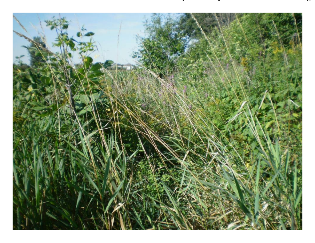
Photo 5 - Vegetation is established throughout the swale along north edge of the site. View looking west from the north-central portion of the site.