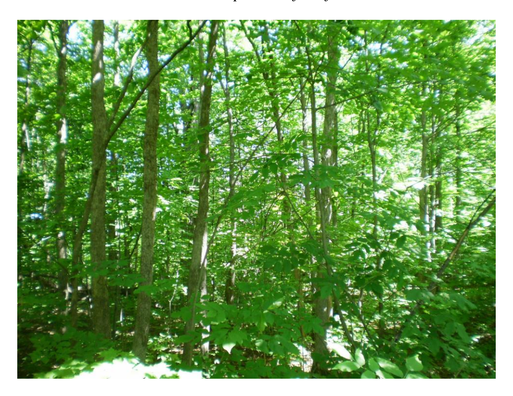
Photo 9 – Younger portion of the upland maple deciduous forest in the east portion of the forest. This portion of the forest is proposed for development. View looking north