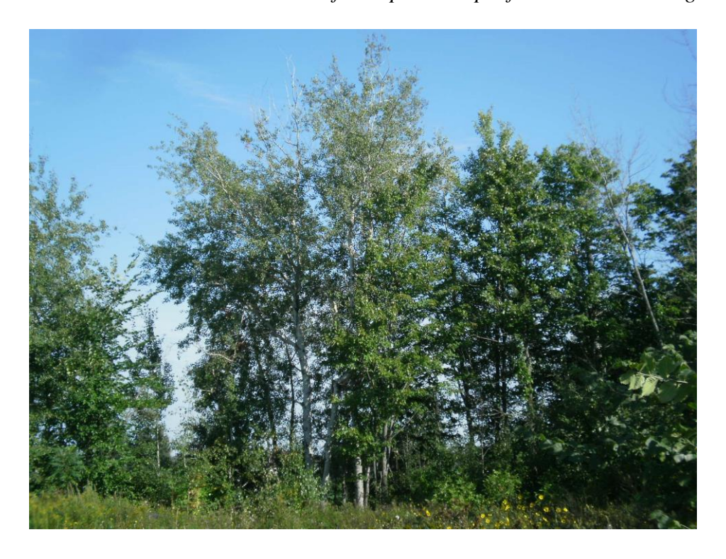
Photo 13 – Cultural woodland in the southwest portion of the site. View looking southeast