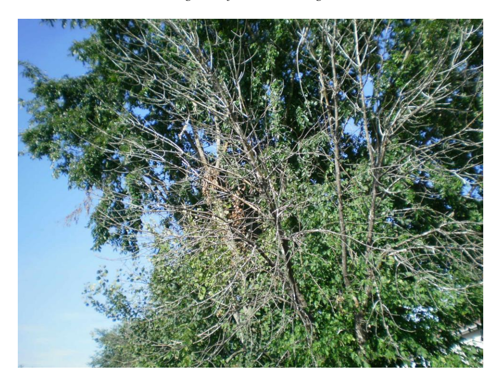
Photo 3 – White elm and smaller trembling aspen in the intermittent deciduous hedgerow along the north edge of the site. View looking west