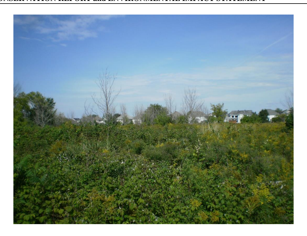
Photo 4 – Cultural thicket habitat in the southeast portion of the site. View looking west