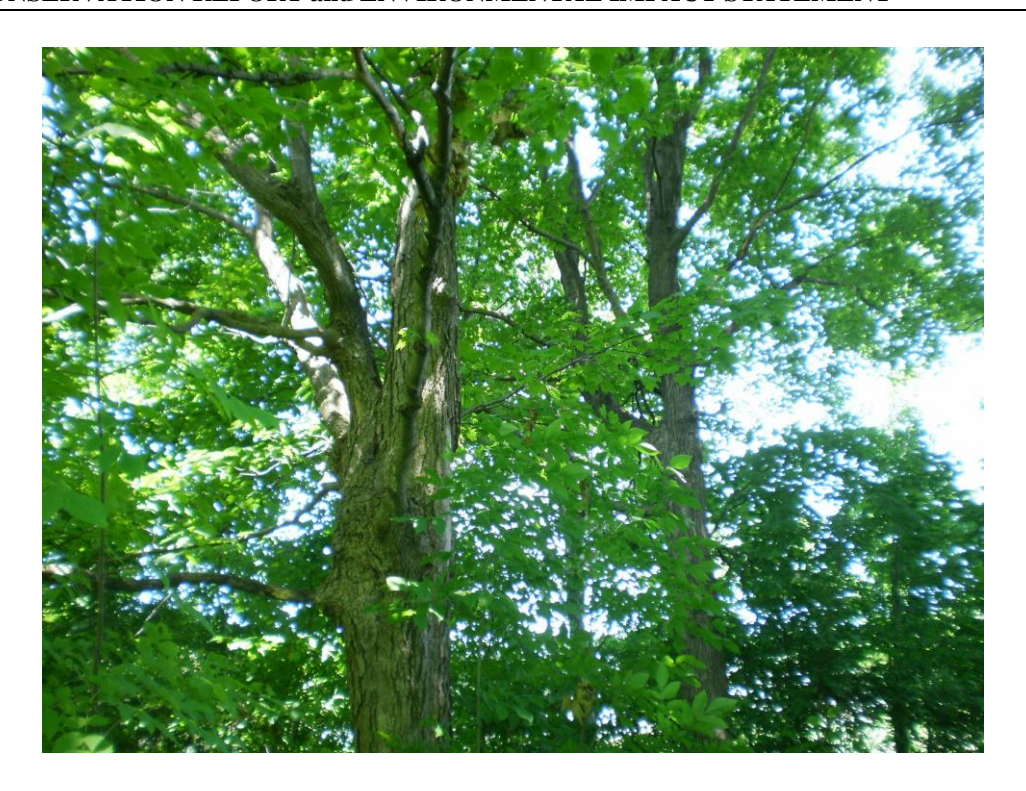
Photo 10 – A few mature sugar maple trees are proposed for removal. This example is at the northeast edge of the forest. View looking north