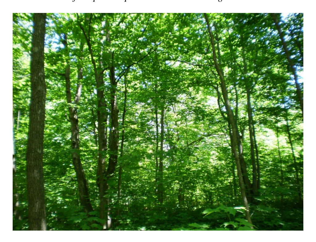
Photo 7 - Typical conditions of upland maple deciduous forest to be retained as a passive park in the central portion of the site. This example is in the west portion with view looking northeast