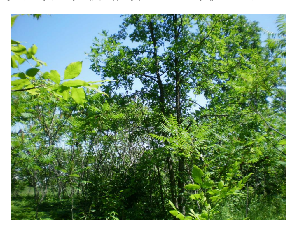
Photo 12 – Cultural woodland to east of the upland maple forest. View looking north