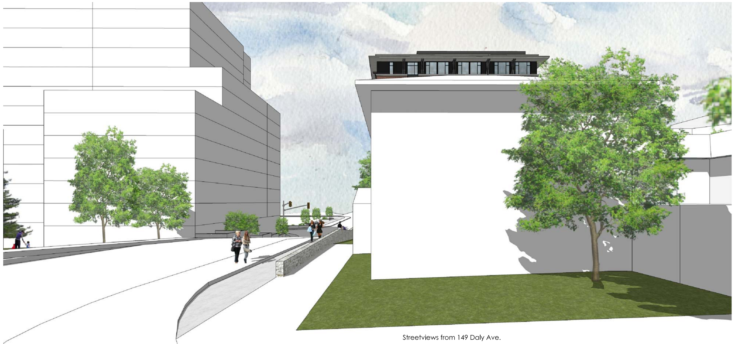
Streetviews from 149 Daly Ave.