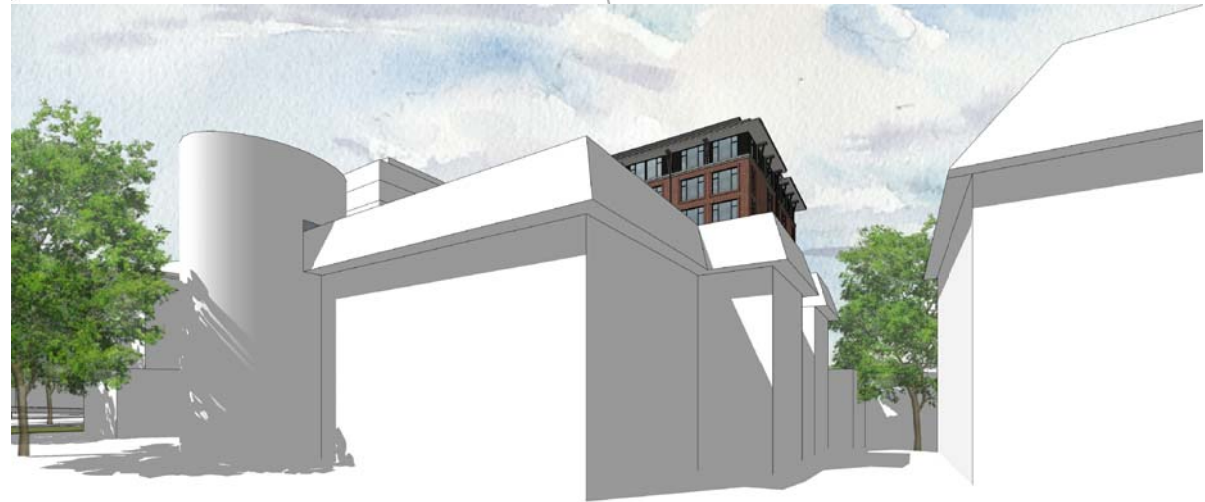
Streetviews from 157-161 Daly Ave.