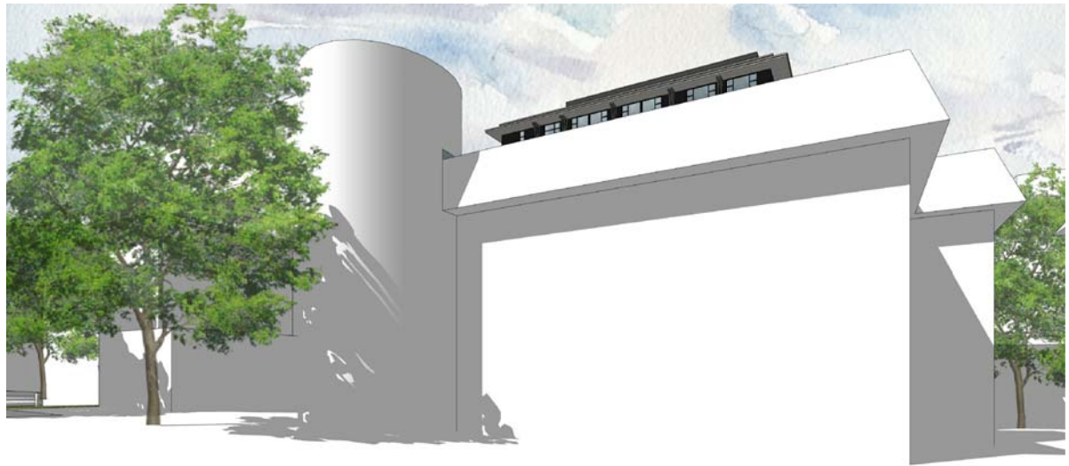
Streetviews from 157 Daly Ave.