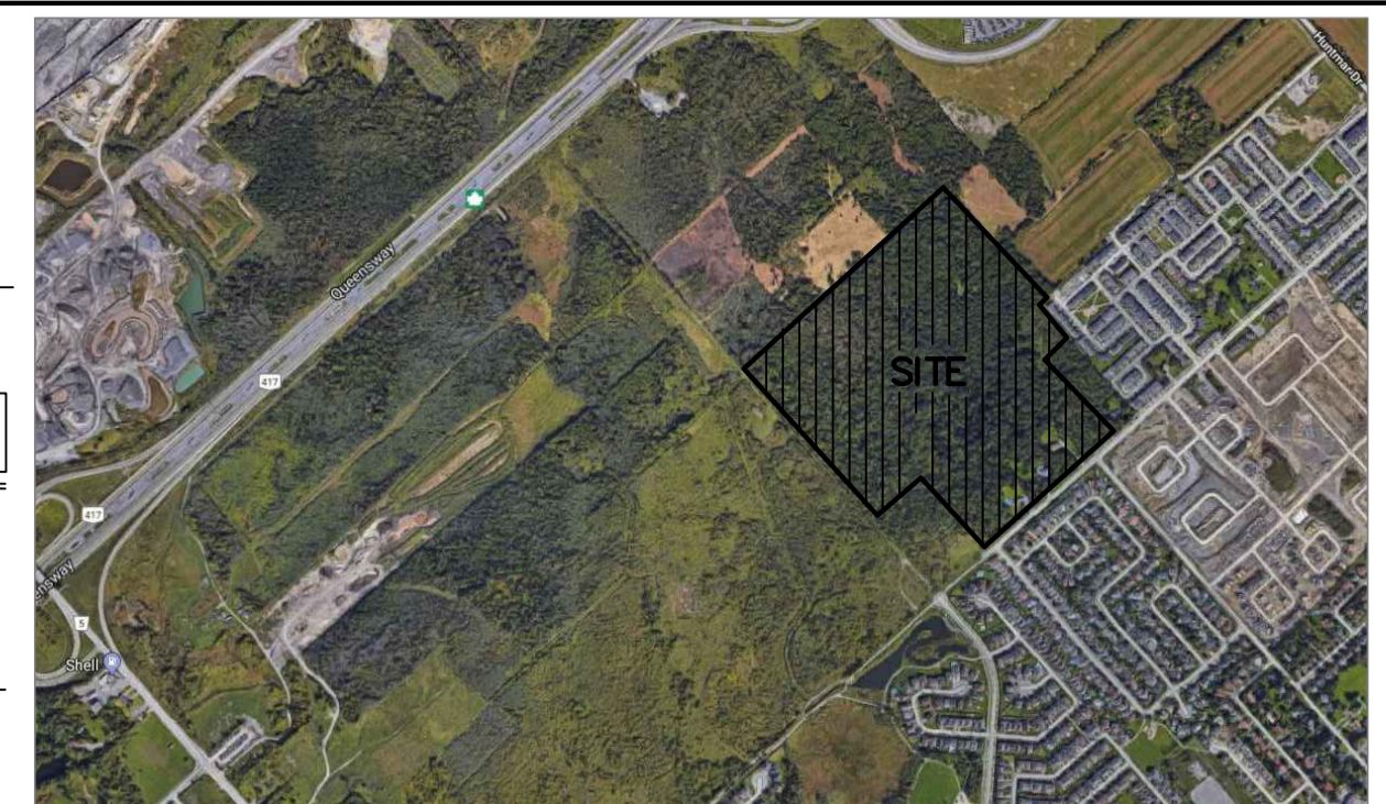
KEY PLAN - NOT TO SCALE

UNDEVELOPED PART 1, PLAN 4R-20912 PIN 04487-0339