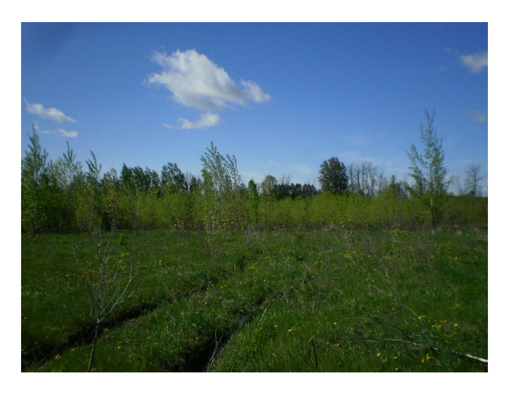
Photo 1 – Cultural meadow in the northeast portion of the site. View looking south to cultural thicket habitat