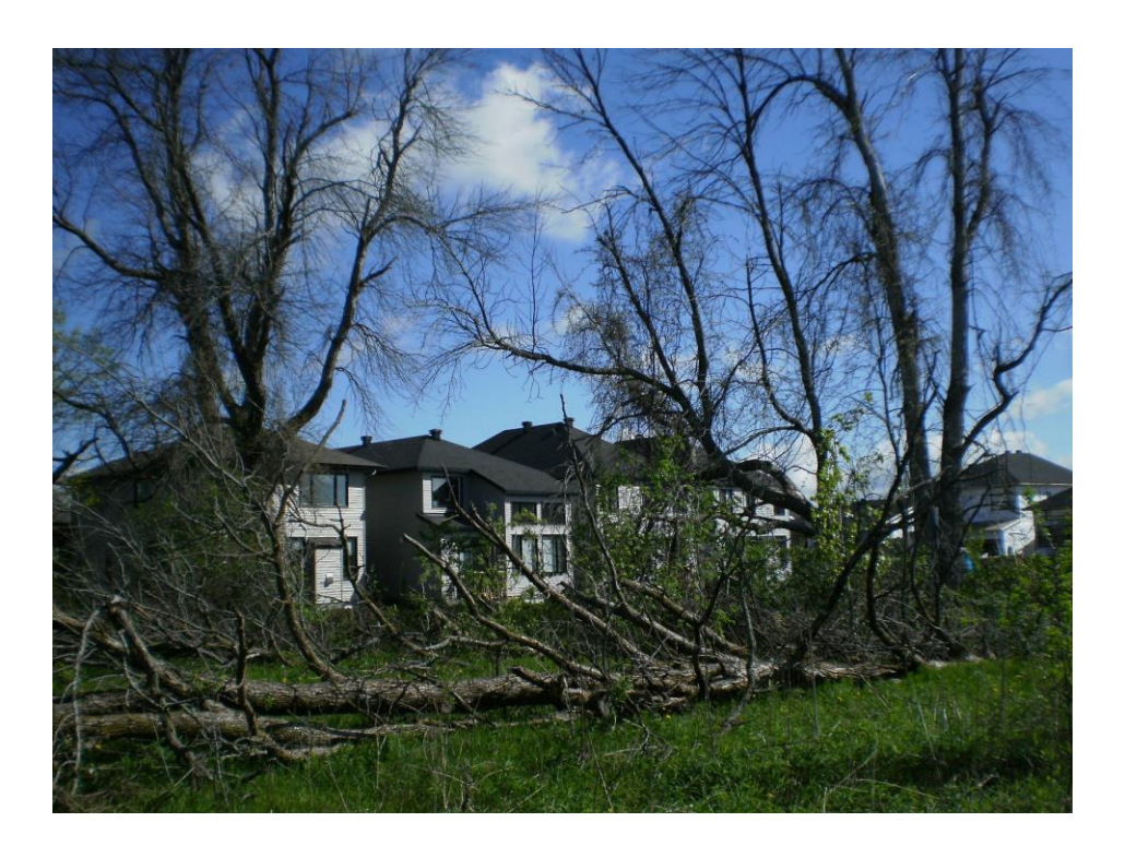
Photo 3 – Intermittent deciduous hedgerow with some tree removal dominated by white ash along the east edge of the site. View looking east to adjacent new residential development