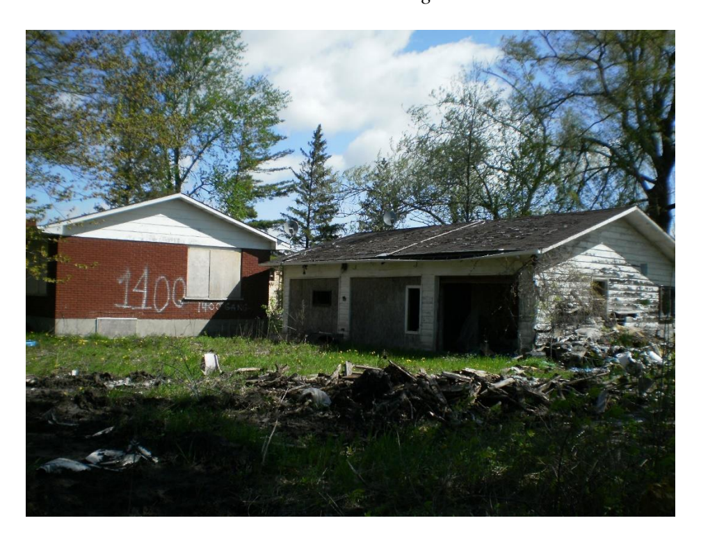
Photo 6 – Boarded up residence and garage with open doors in the northwest portion of the site. View looking northeast