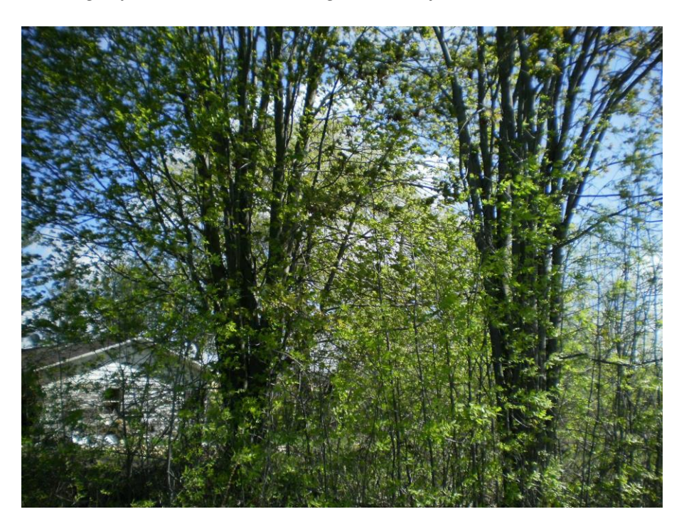
Photo 4 – Coppice red maple in the cultural woodland in the northwest portion of the site. View looking northeast