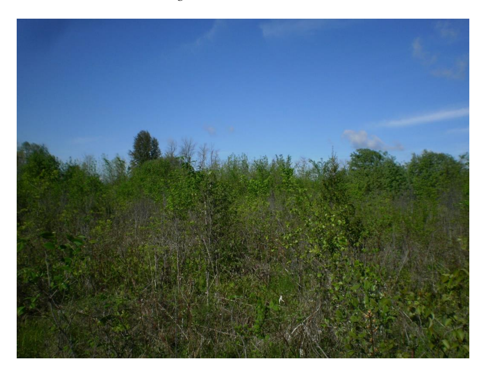
Photo 2 – Cultural thicket in the southeast portion of the site. View looking west