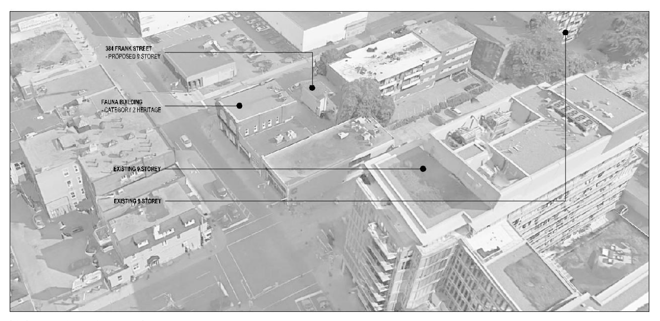
bird's eye view - from south-west

Within 100m one can access a variety of shops, personal services establishments, restaurants and other residential accommodations.