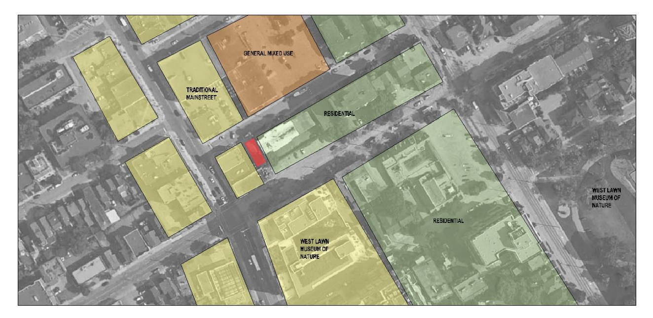
zoning diagram - context

The property at 384 Frank Street, currently designated in the city's 2008-250 Consolidated By-law as a Minor Institutional (I1A) with a Mature Neighbourhood Overlay and a maximum building height of 15m, is surrounded by a variety of neighbouring zones. It is located one property east of Bank Street which is zoned as Traditional Mainstreet, next to residential zones located to the east and south and a General Mixed Use zone to the immediate north.