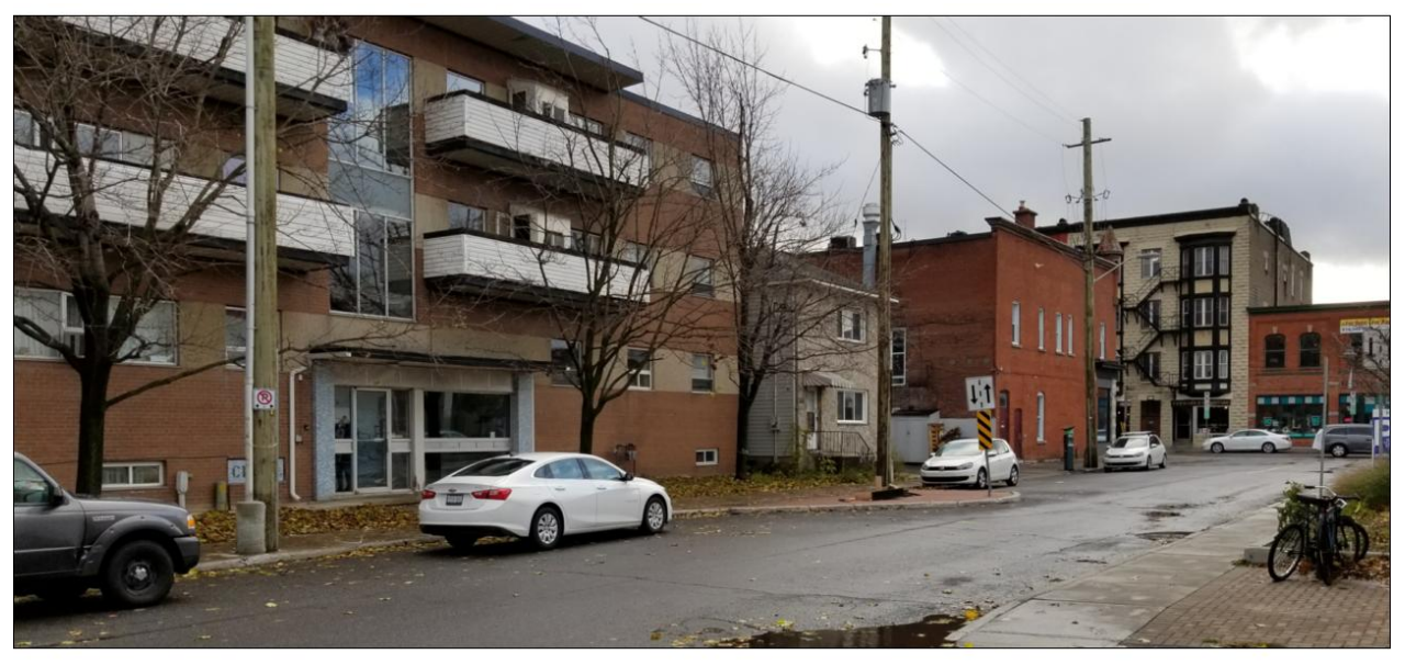
looking west on Frank Street toward Bank Street