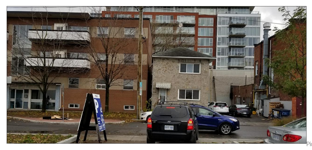
view of existing 2 storey building on site

The property is 206.6 sq.m in area, 20.5m deep and 10m wide along Frank Street. Within the property is a 3m easement providing access to the rear sides of the neighbouring properties. Located on the site is an existing 2 storey residential building currently unoccupied and defined in the Cultural Heritage Impact Report as 'a minor examples of residential development...likely built in the post-war period...remodelled c1970...and noted as vernacular and its architectural integrity as poor'.