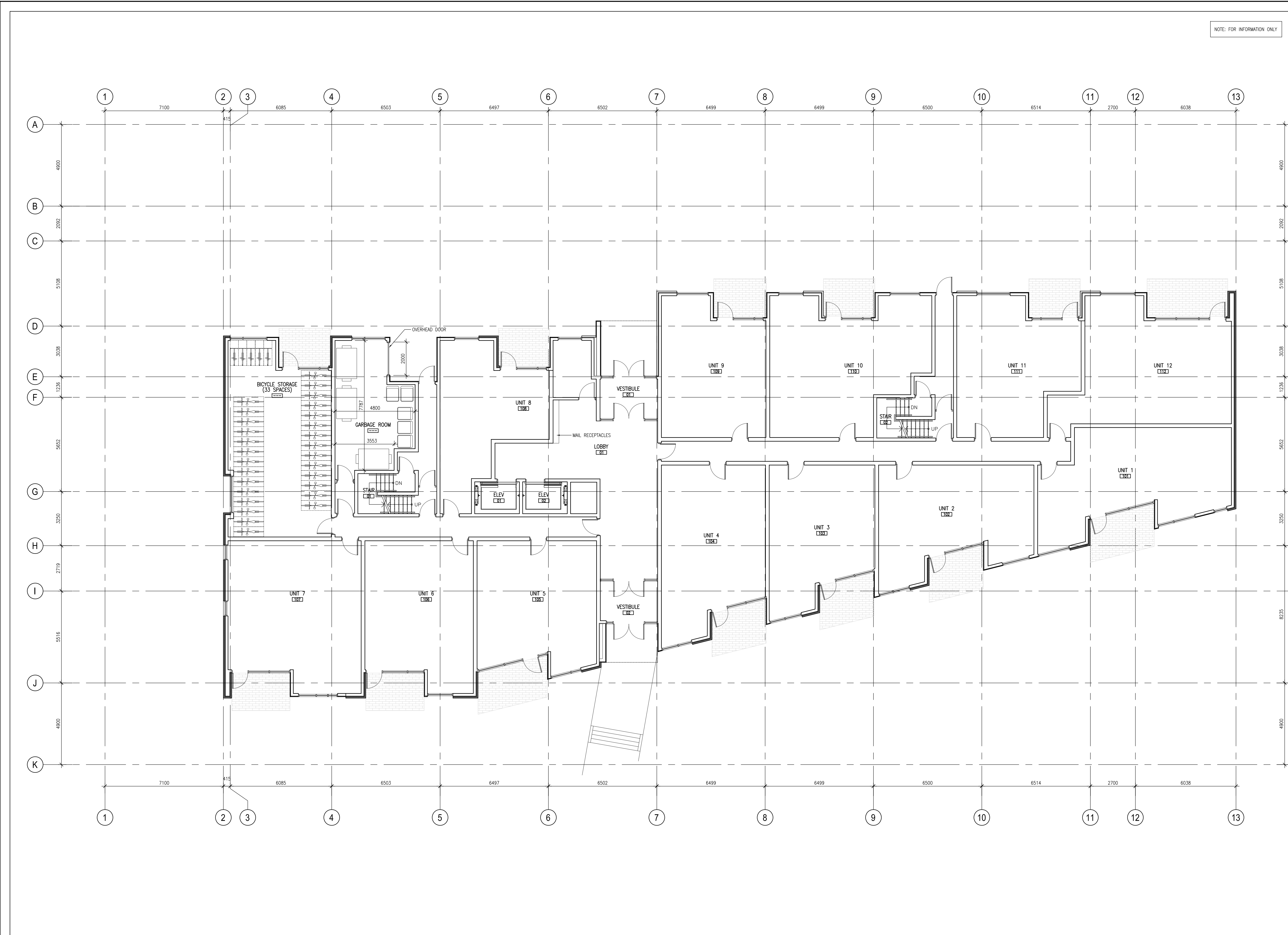
1 LEVEL 1 FLOOR PLAN A101 SCALE: 1:100