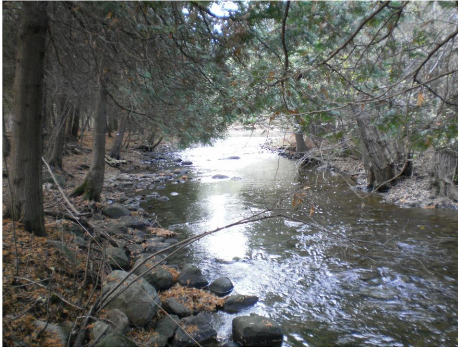
Photo 12 – Canopy cover is excellent along Huntley Creek in the north-central portion of the overall site. View looking east