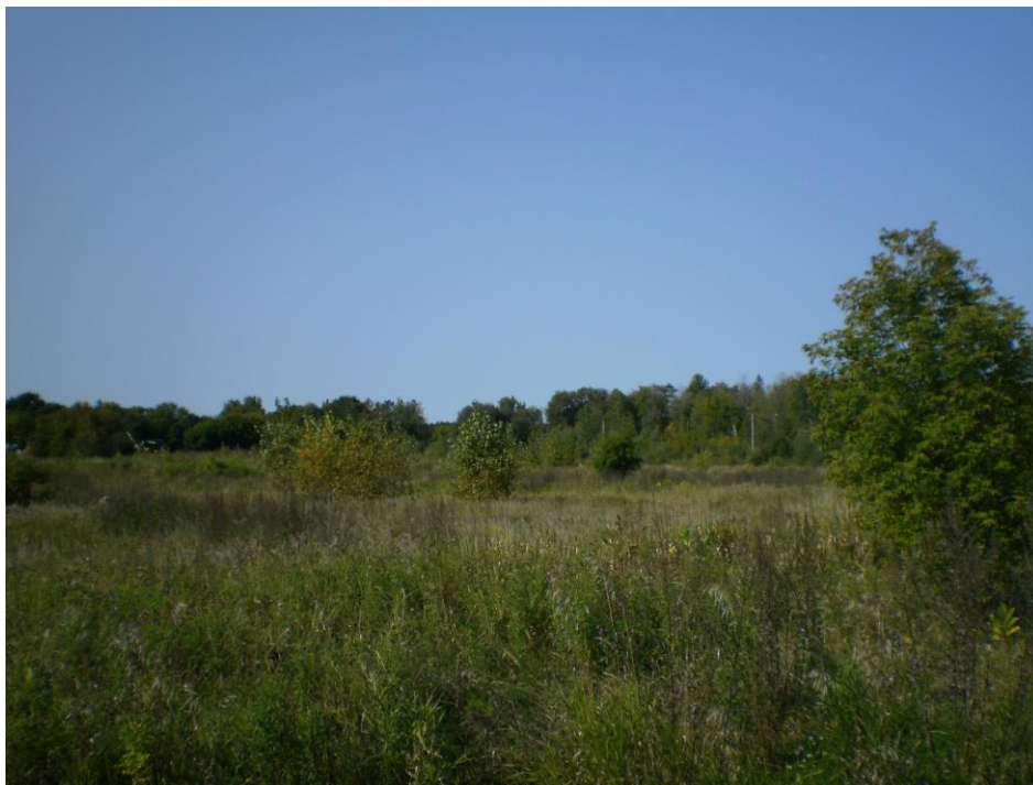
Photo 1 – Cultural meadow habitat in the west portion of the site. View looking west from the central portion of the site

Wildlife observations during the field surveys included American crow, Canada goose, ring-billed gull, great-blue heron, turkey vulture, northern flicker, pileated woodpecker, downy woodpecker, ruffed grouse, European starling, common grackle, American robin, blue jay, black-capped chickadee, alder flycatcher, red-eyed vireo, common yellowthroat, yellow warbler, yellow-rumped warbler, red-eyed vireo, American goldfinch, northern cardinal, dark-eyed junco, song sparrow, white-throated sparrow, northern leopard frog, woodchuck, red squirrel, and white-tailed deer tracks. Green frogs were heard from the dug pond in the south portion of the Huntley Creek corridor, east of the existing residence. No stick nests or other evidence of raptor use were observed on or adjacent to the site and no stone fences were noted. Scattered blast rock in a couple of areas on the site were not consolidated and did not appear suitable for snakes. Noise from the recycling plant to the southwest was fairly constant over much of the site.