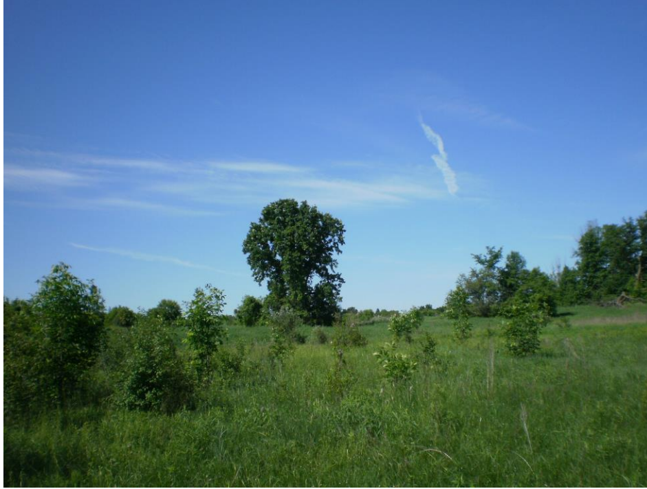
Photo 2 – Cultural meadow habitat in the central-east portion of the site. View looking west, with mature bur oak in the background