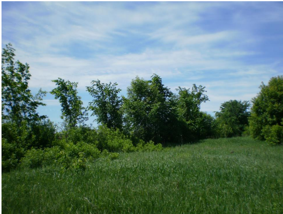
Photo 7 – Intermittent deciduous hedgerow along the south edge of the site. View looking east