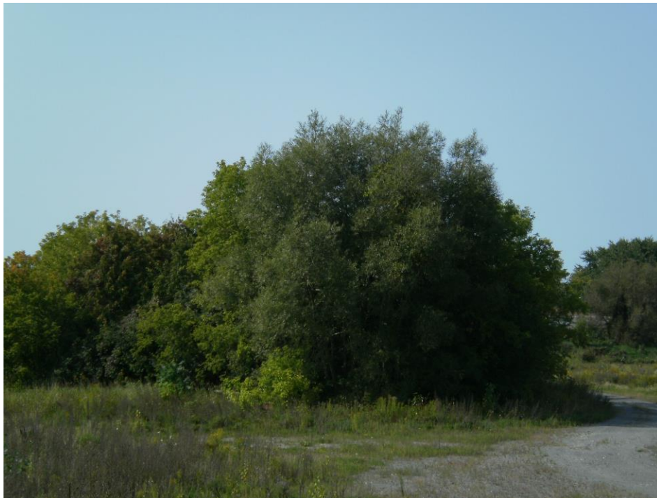
Photo 5 – Small area of cultural woodland in the west corner of the site. View looking west