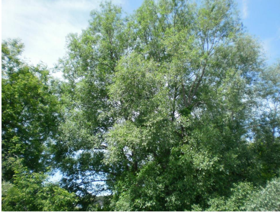
Photo 8 - Mature crack willow in north-south deciduous hedgerow in the northwest corner of the site along the proposed access from Carp Road