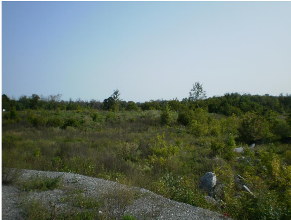
Photo 3 – Cultural thicket and meadow habitat in the central portion of the site. View looking east