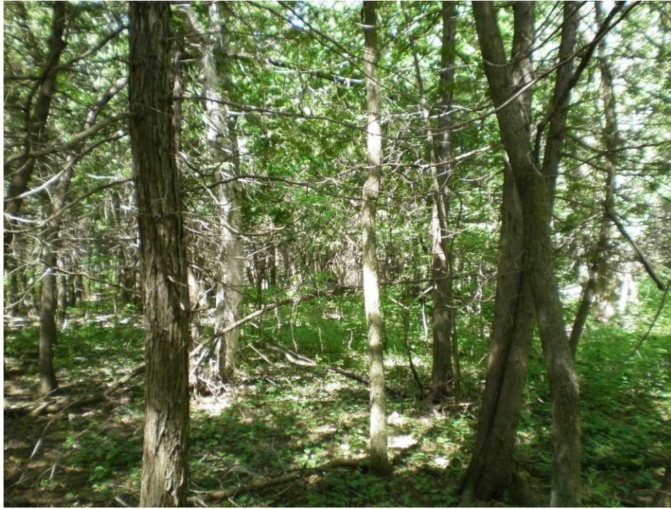
Photo 10 – Typical upland cedar coniferous forest along the south side of the Huntley Creek corridor. View looking east