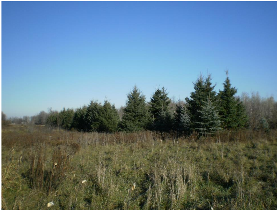
Photo 9 – Planted white spruce in an east-west coniferous hedgerow in the southeast portion of the site. View looking east