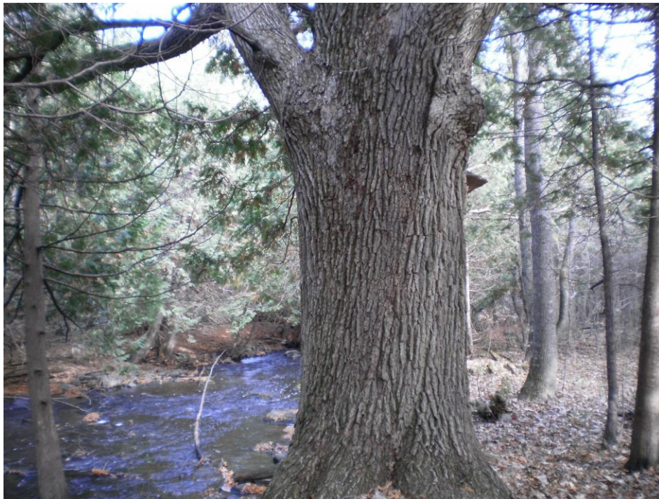
Photo 11 – Mature bur oak along south edge of Huntley Creek. View looking east