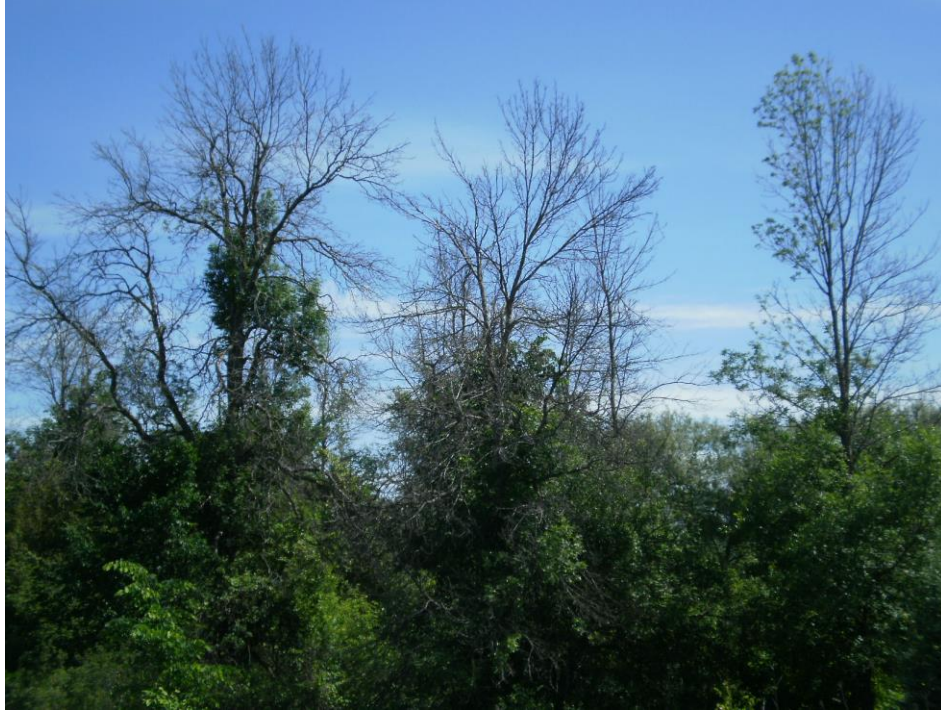
Photo 6 – Cultural woodland on the south side of the Huntley Creek corridor in the east portion of the overall site. Many of the ash with very little leaf-out on June 10 th . View looking northeast