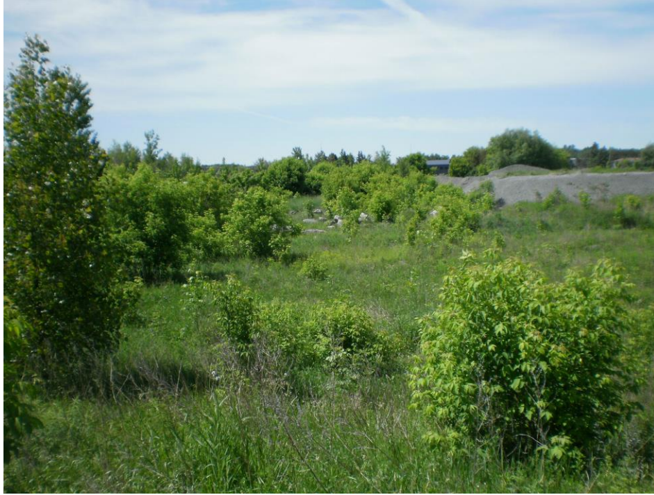
Photo 4 – Cultural thicket in the central portion of the site. View looking west