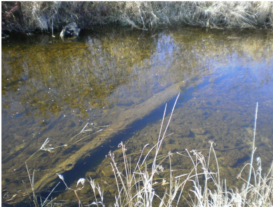
Photo 13 – Woody debris, undercut banks, cobble and aquatic vegetation provide a good diversity of instream aquatic habitat structure in Huntley Creek. This example is in the northeast portion of the overall site