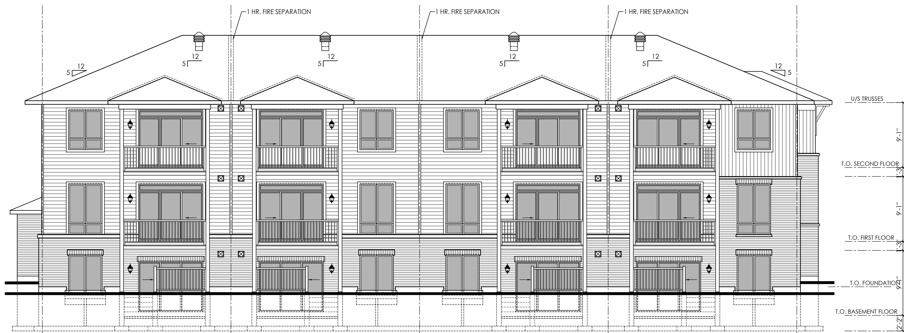
UNIT A END rev., - _____ UNIT B END rev., - _____ UNIT C END rev., - _____ REAR ELEVATION