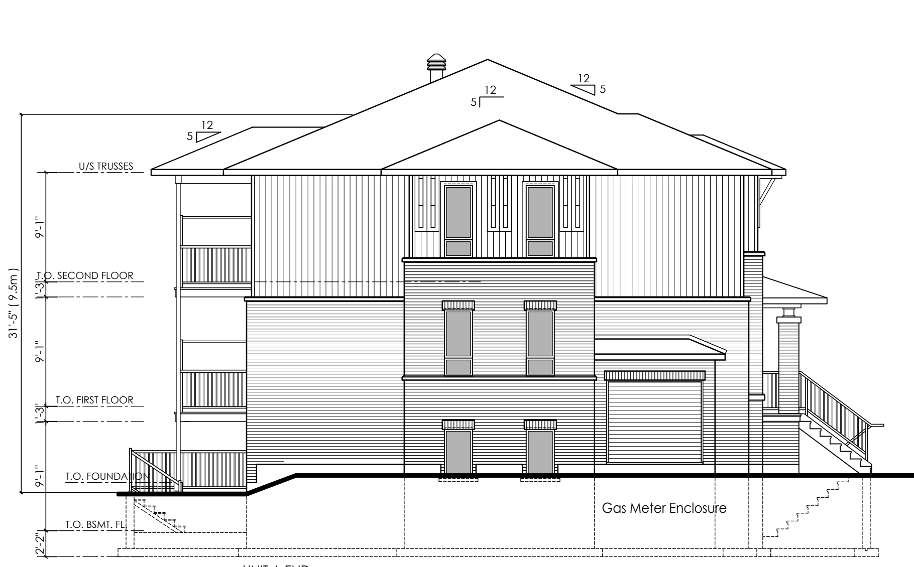
UNIT A END - _____ UNIT B END - _____ UNIT C END - _____ STREET SIDE ELEVATION - GAS METER ENCLOSURE