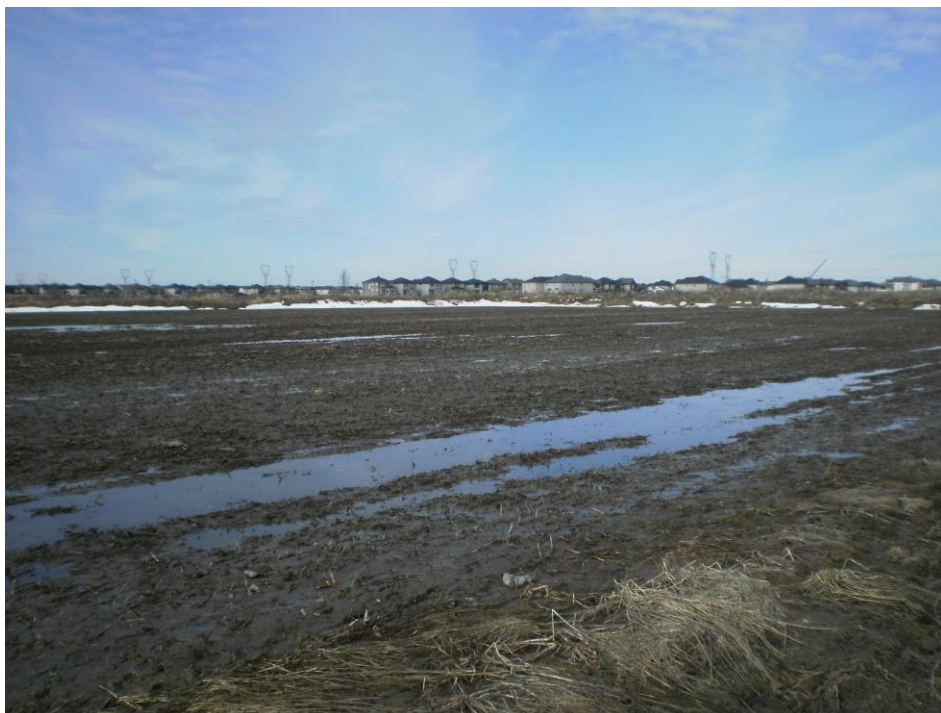
Photo 2 – Fields in the east portion of the site. View looking northwest from current west end of Cope Road (April 3 rd , 2017)