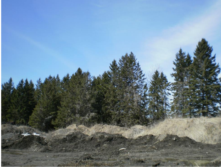
Photos 7 and 8 – Rows of white spruce near the west edge of the site, 260 metres north of Fernbank Road (April 3 rd , 2017 – above, September 14 th , 2014 - below)