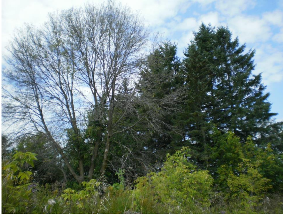
Photo 5 – White spruce dominates the central cultural woodland north of Fernbank Road with ash in very poor condition (September 14 th , 2014)