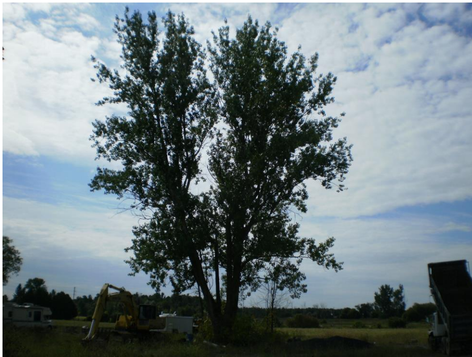
Photo 6 – Mature eastern cottonwood in the west cultural woodland (September 14 th , 2014)