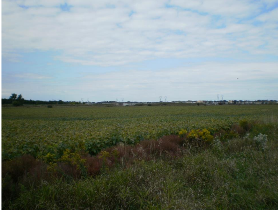
Photo 1 – Soybean fields dominate the site. This view is looking northwest from north of Fernbank Road in the south-central portion of the site (September 14 th , 2014)