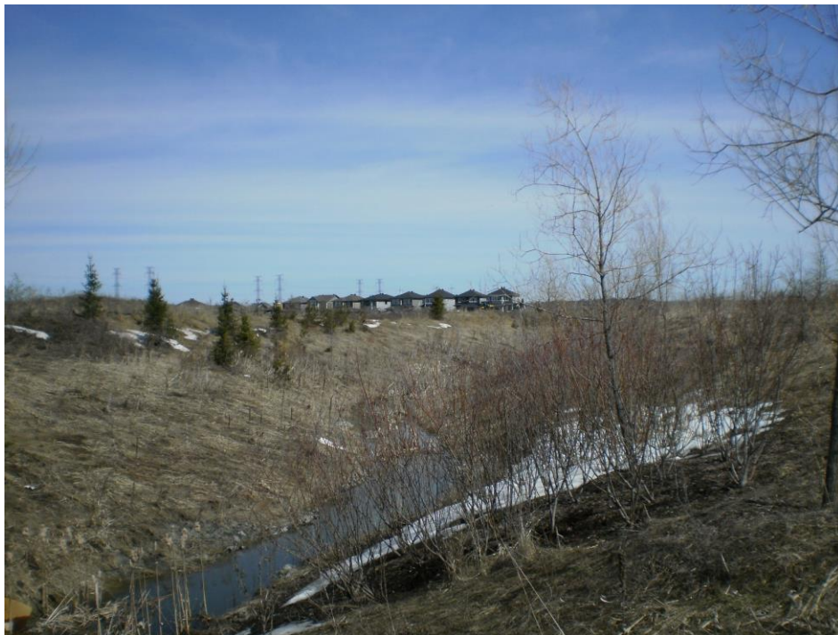
Photo 4 – Plantings and other enhancements along the Monahan Drain corridor immediately to the north of the site. View looking east from access road along the Tapadero Avenue alignment (April 3 rd , 2017)