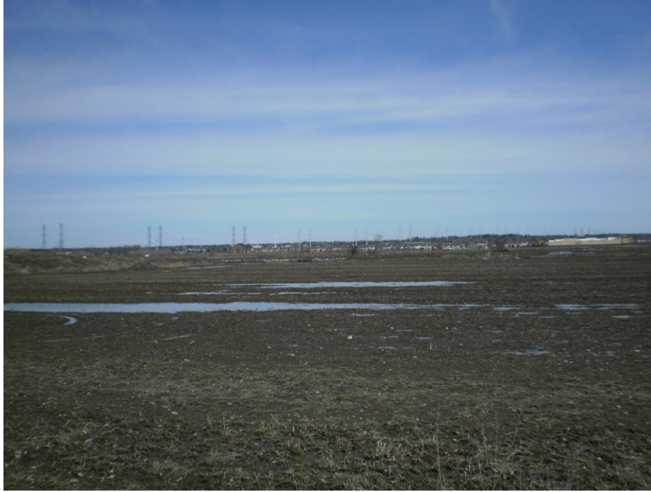
Photo 3 – Fields in the west portion of the site. View looking east from access road along the Tapadero Avenue alignment (April 3 rd , 2017)