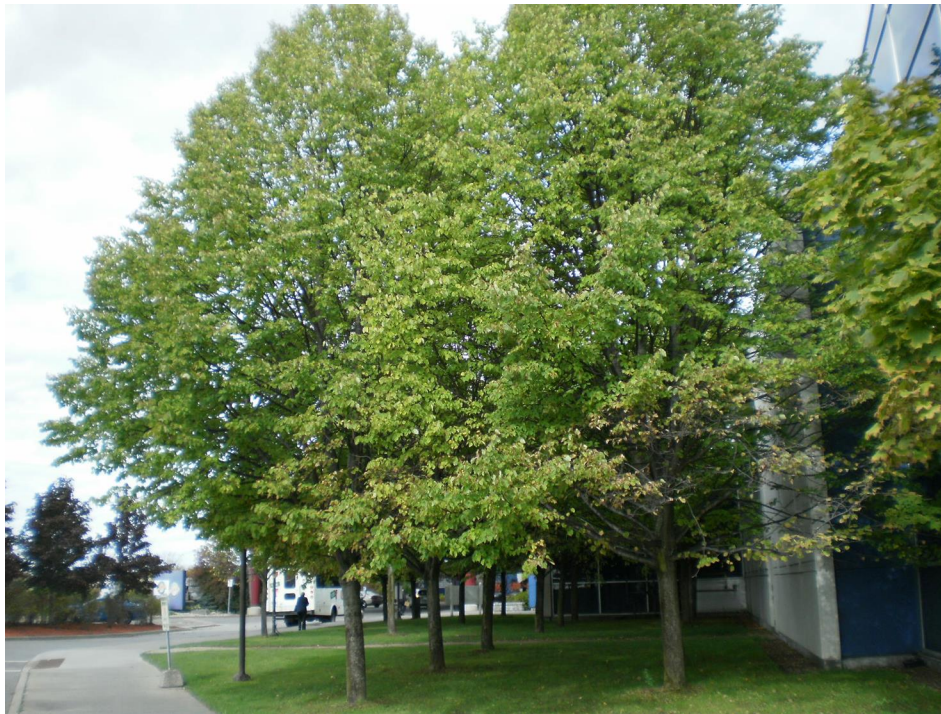
Photo 4 – Planted sugar maples along the entrance to the main building