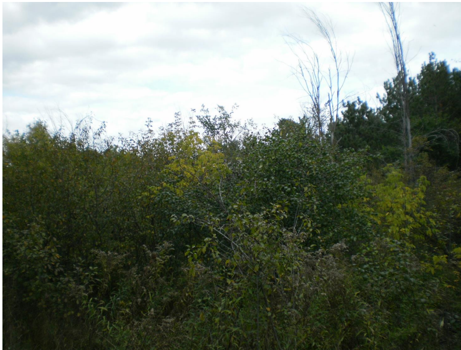
Photo 2 - Cultural thicket in the northeast corner of the study area. View looking east