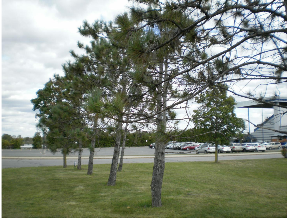
Photo 5 – Planted Scot's pine to the south of the north entrance off Albion Road. View looking east