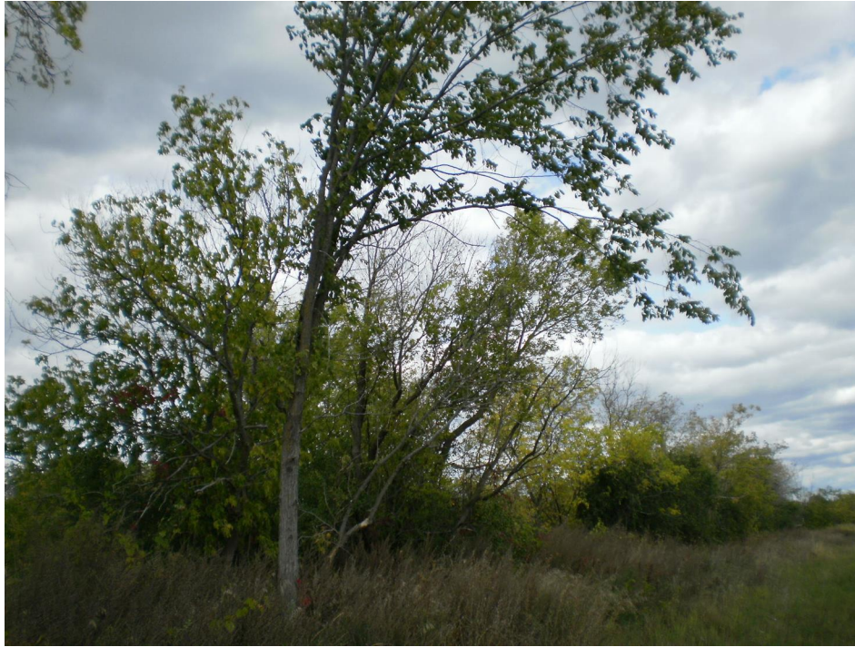
Photo 3 - Young white elm in intermittent hedgerow along the north portion of the site. View looking east