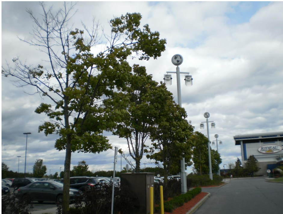
Photo 6 – Planted sugar maples along the north side of the main entrance off Albion Road. View looking east