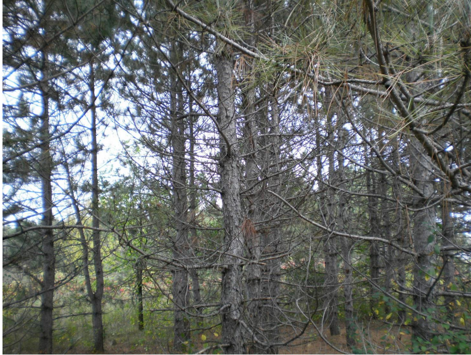
Photo 1 - Red pines planted in the northeast corner of the study area