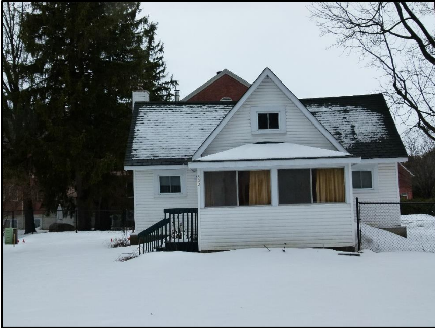
Photograph 1: 530 Edison Avenue (March 28 th , 2017).