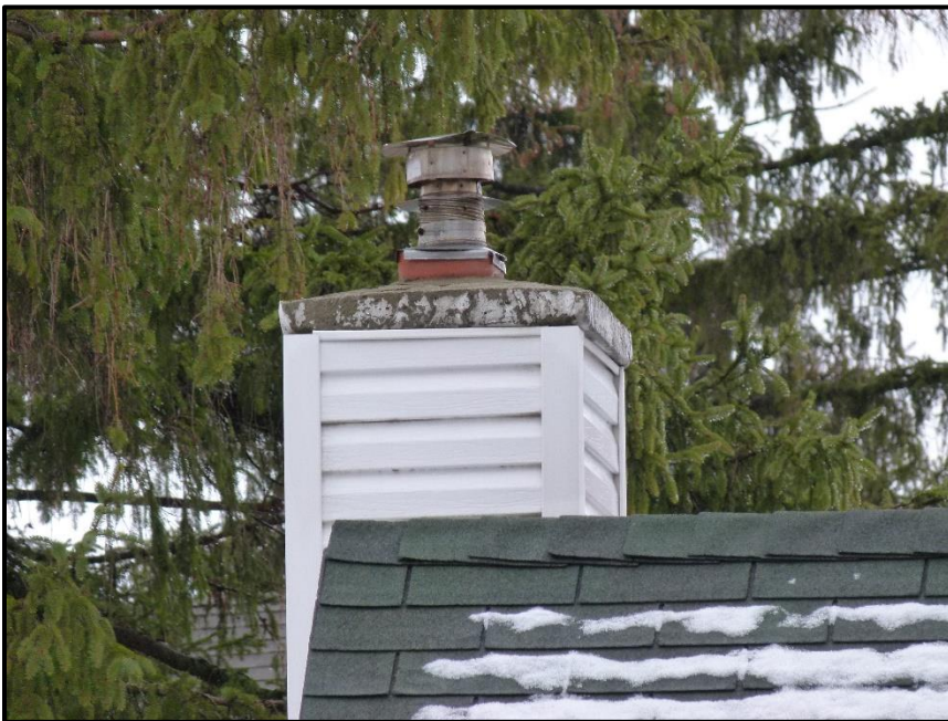
Photograph 2: Chimney #1 at 530 Edison Avenue. Note metal cap and ceramic liner (March 28 th , 2017).