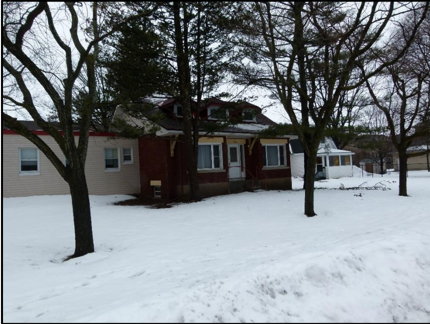
Photograph 3: 534 Edison Avenue (March 28 th , 2017).