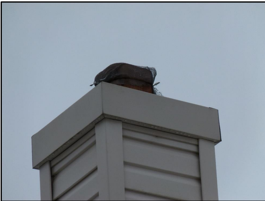
Photograph 4: Chimney #2 at 534 Edison Avenue. Note ceramic liner with wire mesh cap (March 28 th , 2017).