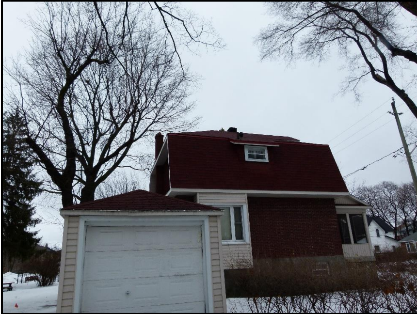
Photograph 5: 540 Edison Avenue (March 28 th , 2017).