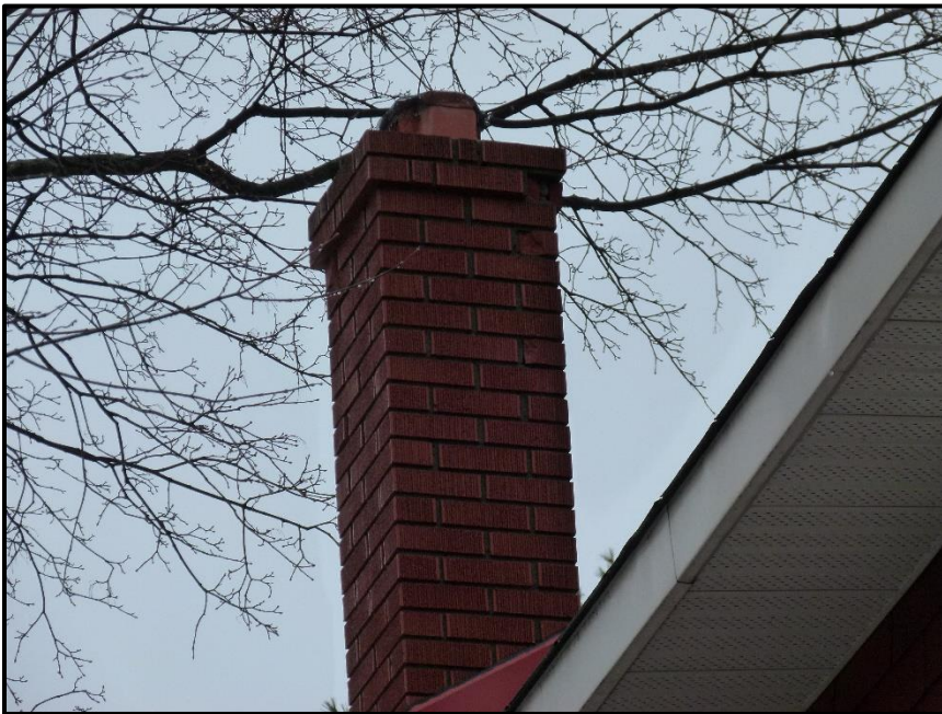
Photograph 6: Chimney #3 at 540 Edison Avenue. Note ceramic liner with wire mesh cap (March 28 th , 2017).