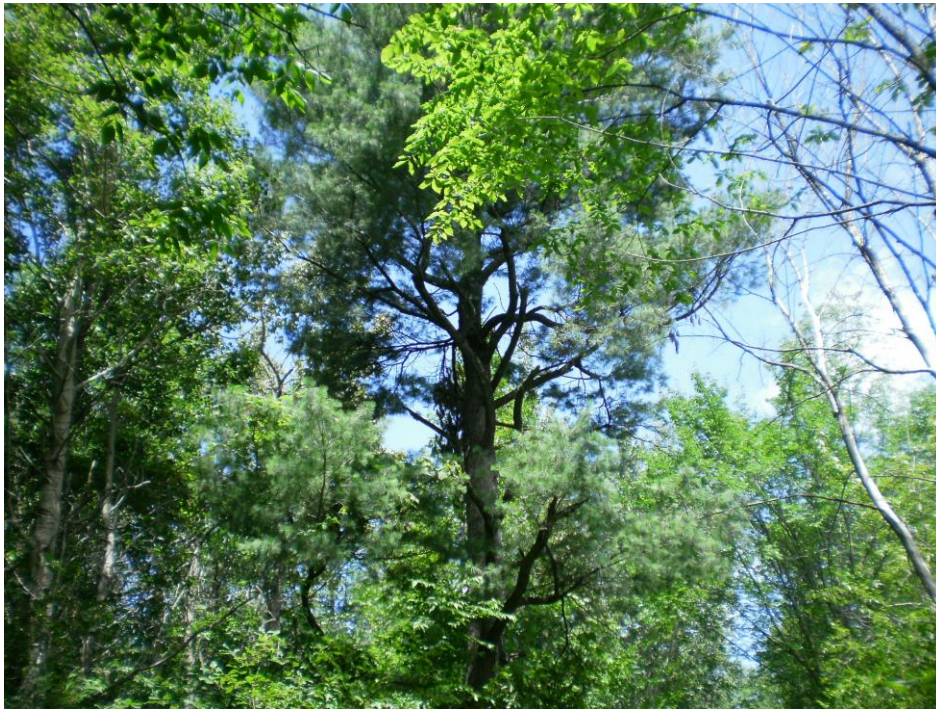
Photo 3 – A few white pines are along the south-central edge of the site