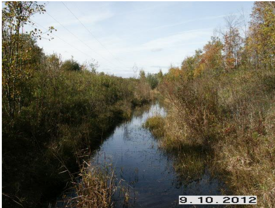
Photo 11 – Sunset Lakes Mutual Agreement Drain in the west portion of the site. View looking northwest (upstream)