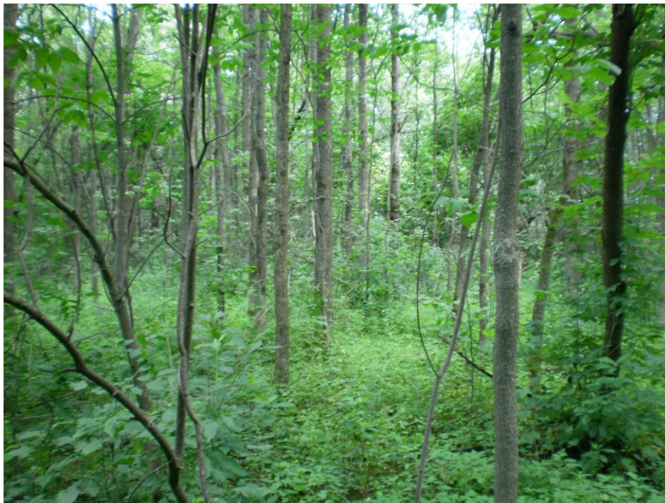
Photo 8 – Dry-fresh ash-poplar forest in the northwest portion of the site