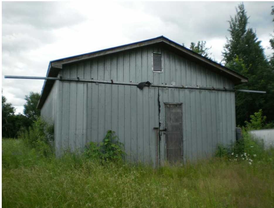
Photo 12 – Shed at west end of meadow habitat, just east of the fresh-moist poplar forest in the east portion of the site