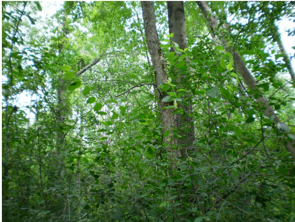
Photo 6 – Fresh-moist poplar-maple forest in the north-central portion of the site