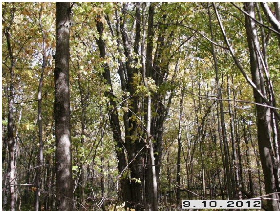
Photo 4 - Larger maples in the southwest portion of the site just east of the Sunset Lakes Mutual Agreement Drain