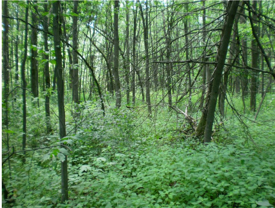
Photo 7 – Fresh-moist ash deciduous forest in the southwest portion of the site