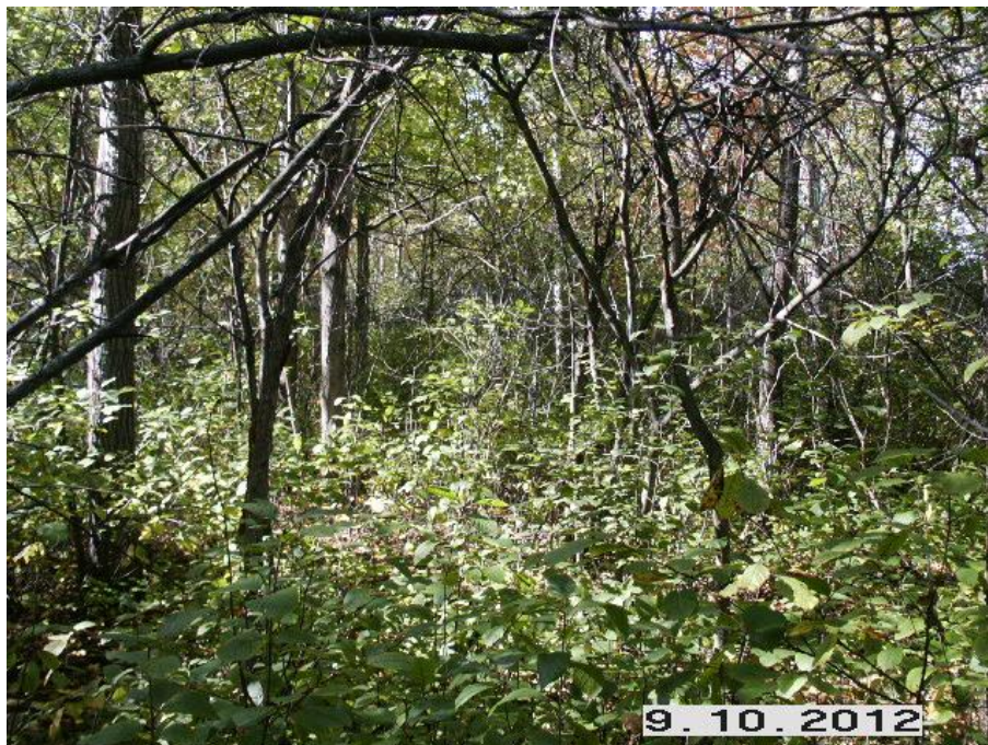
Photo 2 – Typical buckthorn density in the fresh-moist poplar forest