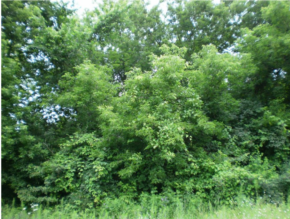
Photo 9 – Cultural woodland in the southeast corner of the site, just west of Old Prescott Road