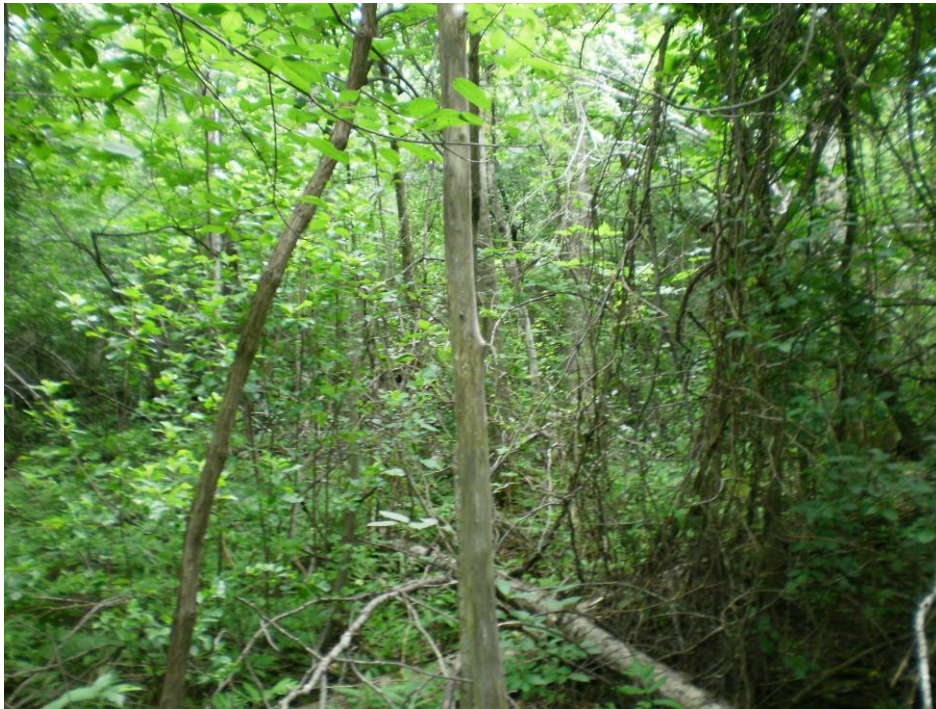
Photo 1 – Fresh-moist poplar forest in the east portion of the site