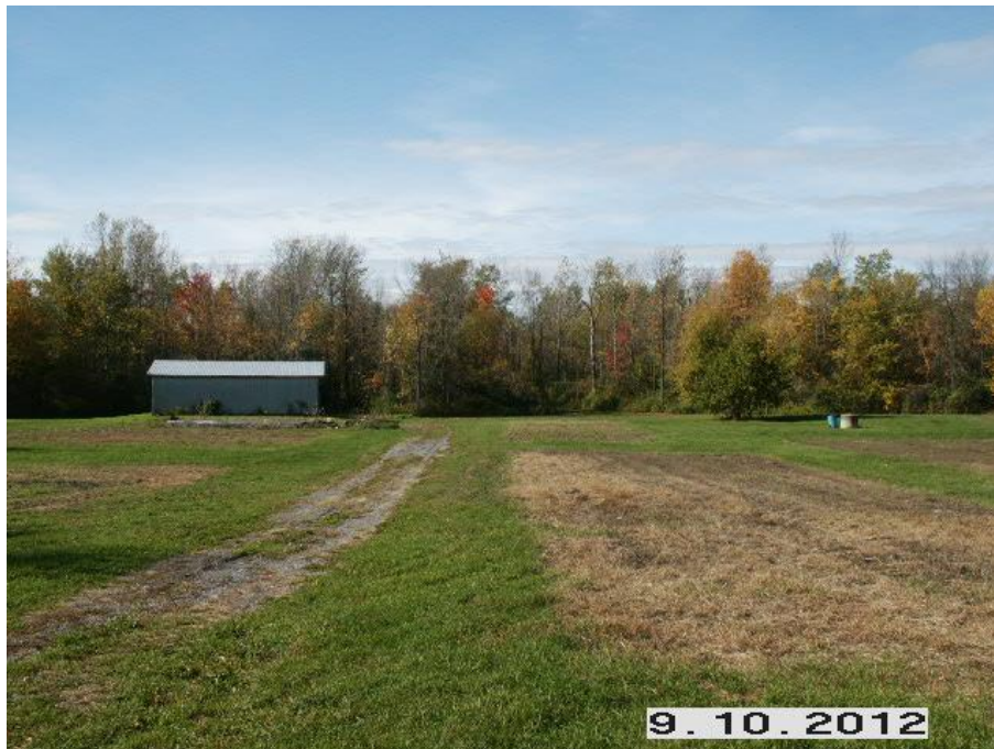
Photo 10 – Former vegetable plots in the east portion of the site, west of Old Prescott Road. View looking west