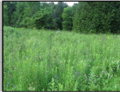
Communities 2 and 9: Dry-moist old field