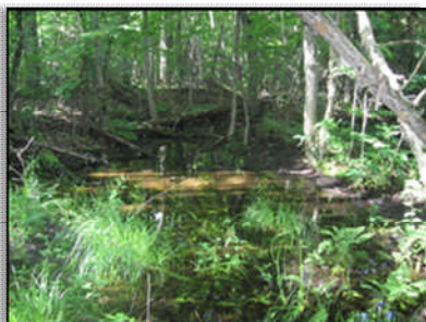
Community 11: Woodland Pool