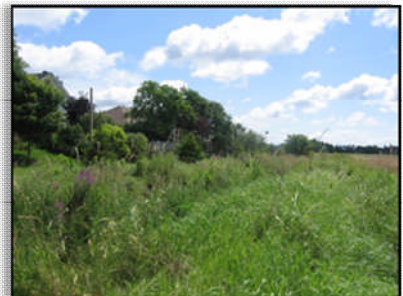
VanGaal Drain (SouthEast)