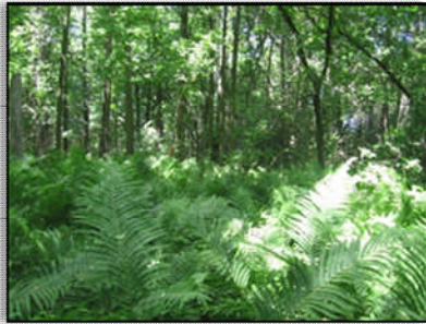
Community 1: Fresh-moist Poplar Deciduous Forest