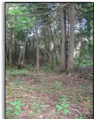
Community 12: Fresh-Moist Sugar Maple – Lowland Ash Deciduous Forest