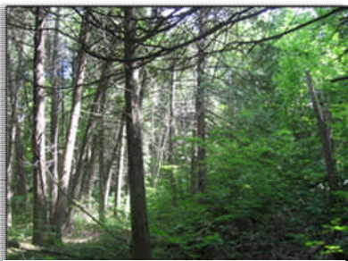
Community 16: Fresh – Moist White Cedar – Hardwood Mixed Forest