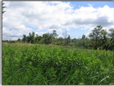
Community 4: Forb Mineral Meadow Marsh