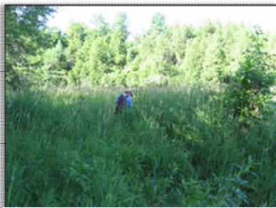
Community 18: Reed Canary-grass Mineral Meadow Marsh