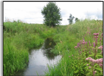
VanGaal Drain (NorthWest)