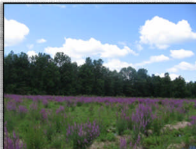
Woodlot 3 (from field)