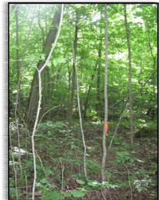
Community 11: Fresh-Moist White Cedar Coniferous Forest