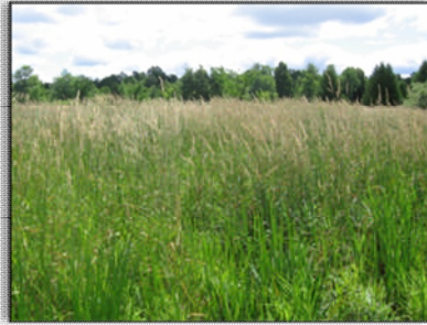
Community 5: Reed Canary-grass Mineral Meadow Marsh