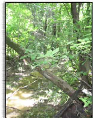
Hedgerow 6 (note drainage)