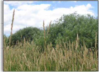
Community 7: Willow Mineral Thicket Swamp (in background of photo)