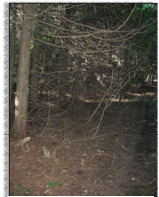
Community 15: Fresh – Moist White Cedar Coniferous Forest