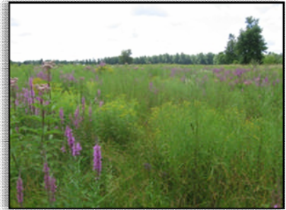
Community 3: Dry-moist old field