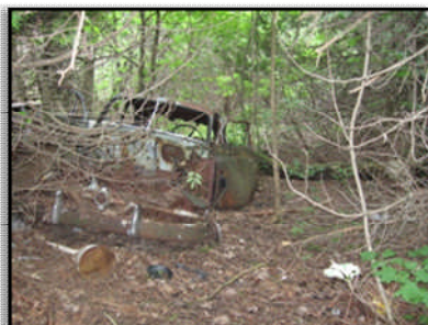
Community 12: Old Car