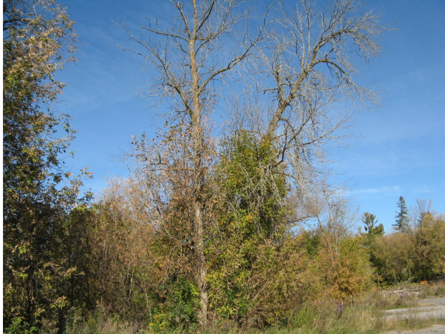
Photo 7 – White ash in very poor condition in the northwest corner of the site, to the east of the Carp River. View looking north.