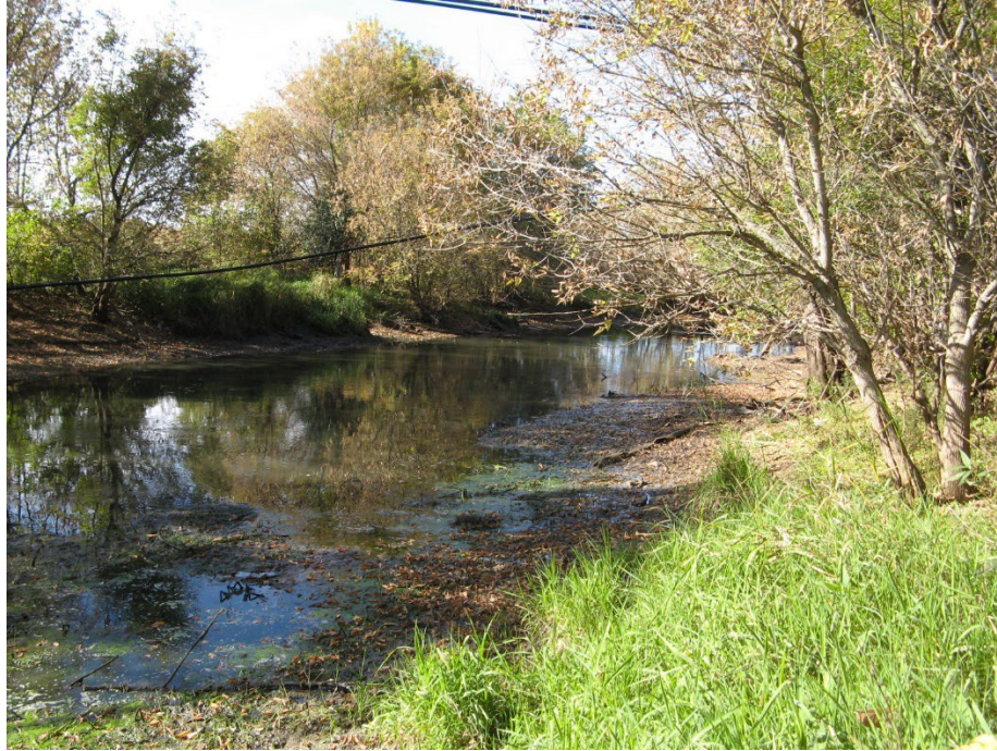
Photo 3 –Carp River adjacent to the southeast portion of the site. View looking northwest