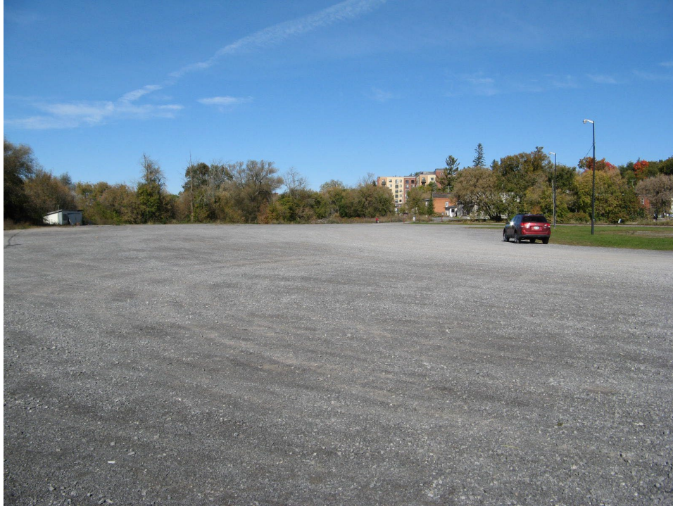
Photo 1 – Core of the site looking north from south-central portion