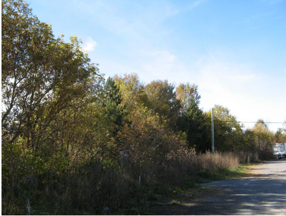
Photo 5 – Manitoba maples along the riparian corridor in the west portion of the site and east of the Carp River. View looking north