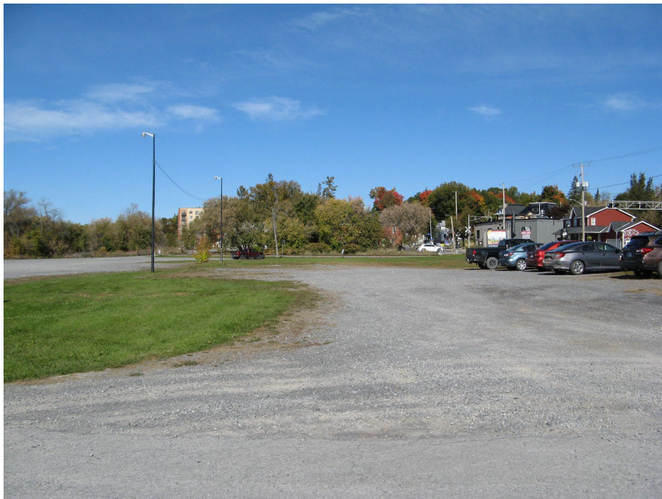
Photo 2 – East portion of the site, adjacent to Carp Road. Some areas have been seeded with others used for parking. View looking north