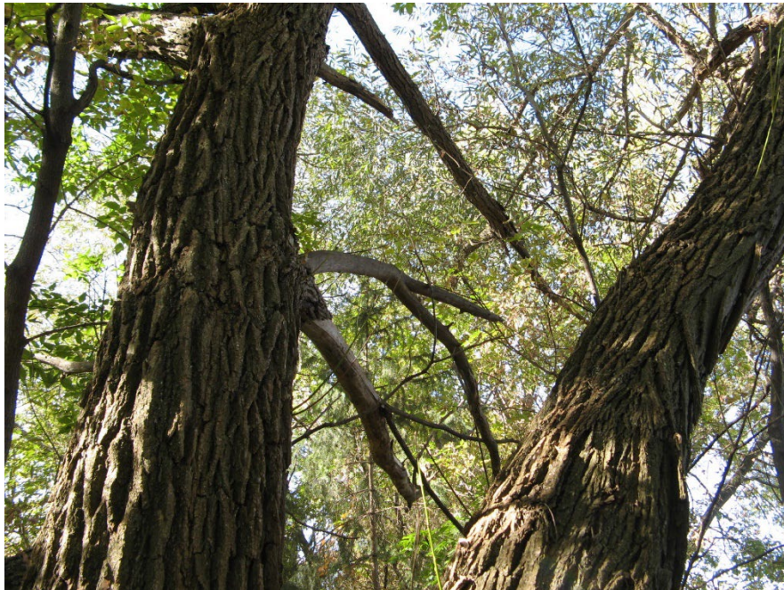
Photo 6 – Mature crack willow in the southeast portion of the site, north of the Carp River and west side Carp Road. View looking southwest