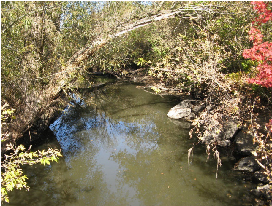
Photo 4 – Good cover provided by riparian vegetation on both sides of the Carp River adjacent to the north portion of the site. Note rock protection along east shoreline. View looking north